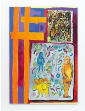
Stadthexen, 2024 Oil and pigment on canvas 200 x 140 cm