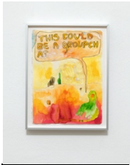
This could be a groupchat, 2023 Pen, watercolor and pigment on paper 24,8 x 18,5 cm