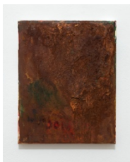
Rostige Studie, 2024 Pen, watercolor and pigment on paper 30 x 24 cm