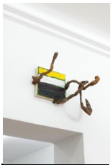
Growing horns or growing roots, 2024 Oil on canvas, modelling clay, wire, steel powder, rust 31,3 x 24,5 x 21,1 cm