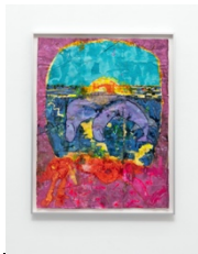
Dreaming Dolphins, 2023 Pencil, watercolor, ink and dye on paper Unframed: 73,6 x 55,7 cm, framed: 78,5 x 61,5 cm