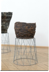
Studies for Fountain Pans, 2023 Stoneware, iron oxide, cobalt oxide, metal rack 29,5 x 21,3 x 28,1 cm