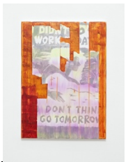
Jugendzimmer Studie, 2024 Oil on canvas 62 x 45 cm