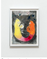
Schau halt nochmal, 2023 Pen, watercolor and ink on paper 24,8 x 18,5 cm