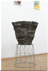
Studies for Fountain Pans, 2023 Stoneware, iron oxide, cobalt oxide, metal rack 47,5 x 39,9 x 44 cm