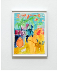
Alle sind in Miami nur ich bin im Büro, 2023 Pencil, watercolor and ink on paper 24,8 x 18,5 cm