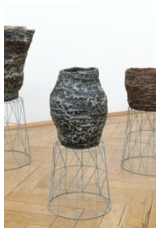
Protestantisches Objekt , 2023 Stoneware, iron oxide, cobalt oxide, zinc oxide, metal rack 21,6 x 30 x 20,9 cm