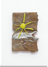
So tun als gehört man zu den Schottermassen , 2024 Cast aluminium, steel powder, rust, oil paint, spray paint 16,5 x 24,5 x 2 cm