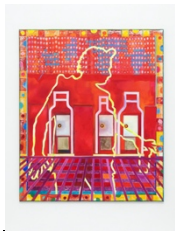
Rotes Zimmer / Red Room, 2024 Oil on canvas 180 x 150 cm