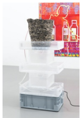
Study for Fountain Pans, 2024 Stoneware, iron oxide, cobalt oxide, Euro storage container, pump 132 x 61 x 42 cm