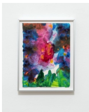
Ich werd nicht mehr rumbrummen ich schwörs, 2023 Pen, watercolor, ink and pigment on paper 24,8 x 18,5 cm