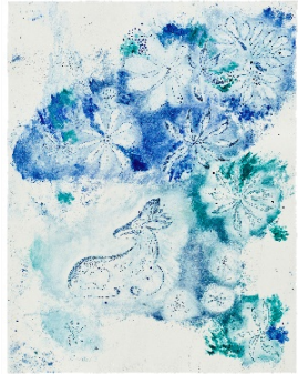
Lisa Lurati Untitled 23, 2023 Monoprint, 89,5 x 69 cm Production: Hürdega, Locarno