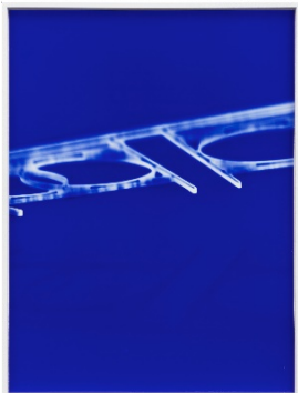
Noha Mokhtar Saadiya (bleue) 5, 2023 photogram, 40 x 30 cm Unique Production: F+F Fotolabor, Zurich