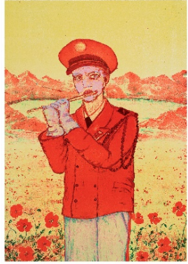
Andriu Deplazes «Trompetersoldat (Flötist)», 2023, Lithography, 89,5 x 62,8 cm, Production: Thomi Wolfensberger Zürich