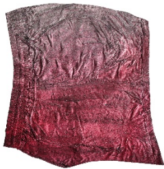
Manon Wertebroek sans titre 8, 2024 textile, latex, acrylic color, varnish, 49 x 47 cm Production: Manon Wertebroek, Paris