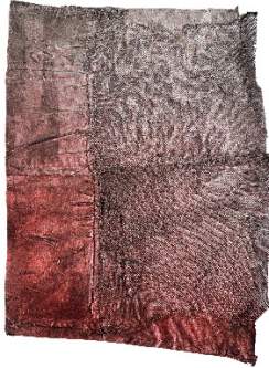
Manon Wertebroek sans titre 12, 2024 textile, latex, acrylic color, varnish, 56 x 43 cm Production: Manon Wertebroek, Paris