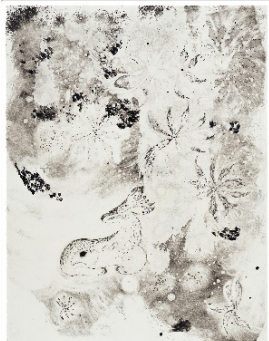
Lisa Lurati Untitled 21, 2023 Monoprint, 89,5 x 69 cm Production: Hürdega, Locarno