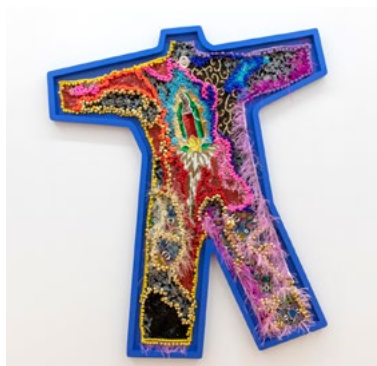
8. La piel de la celebración: la creadora , 2024 Bells, vintage fabrics, feathers, beads, and ribbons in artist's frame 93 x 55 x 2 inches (236 x 140 x 5 cm)