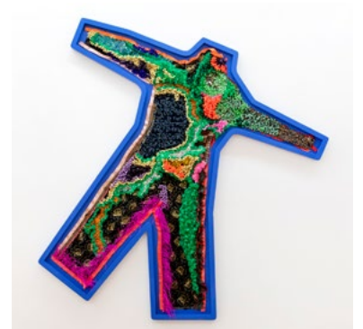
6. La piel de la celebración: el viaje , 2024 Bells, vintage fabrics, feathers, beads, and ribbons in artist's frame 93 x 55 x 2 inches (236 x 140 x 5 cm)