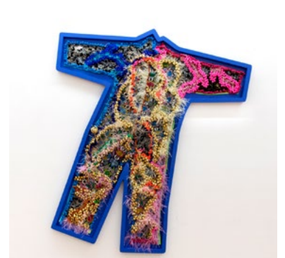
9. La piel de la celebración: serpiente y pájaro , 2024 Bells, vintage fabrics, feathers, beads, and ribbons in artist's frame 93 x 55 x 2 inches (236 x 140 x 5 cm)