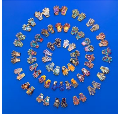
2. Treinta y tres segundos de compasión , 2023 Bells, vintage fabrics, feathers, and beads on 34 pairs of work-wear gloves 115 inches, or variable