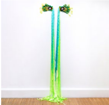
1. Las lagrimas de la soledad , 2024 Bells, vintage fabrics, feathers, beads, and ribbons on a pair of work-wear gloves 102 x 31 x 1 inches (259 x 79 x 3 cm)