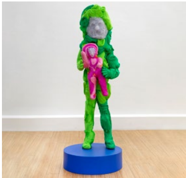
4. Los hilos de la vida , 2024 Clothing display mannequin, paper-mâché, upholstery foam, needles, pins, and beads on pedestal 55 x 19 5/8 x 19 5/8 inches (140 x 50 x 50 cm)