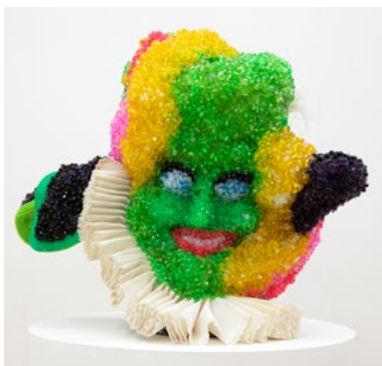
7. El espejo , 2024 Beads, upholstery foam, feathers, bells, and silk 20 3/8 x 24 x 12 inches (52 x 61 x 31 cm)