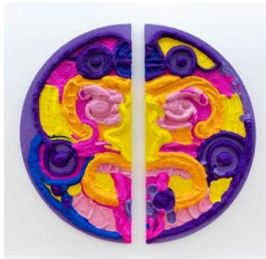
5. El pasaje , 2024 Macrame cord and upholstery foam on canvas 74 x 74 x 2 inches (188 x 188 x 5 cm)