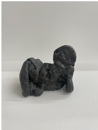
Exhibition image: 捻 -Drawing Sculptures-105, Glazed ceramic, 2023

Maruka bldg 2F, 2-2-14 Nihonbashi-Bakurocho, Chuo-ku, Tokyo