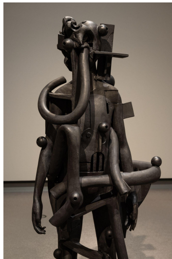
Exhibition image: 像化- Planets on the Planet 01., Glazed ceramic, 2023