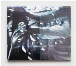
Kate Mosher Hall, Big push , 2024 Acrylic, flashe, and color pencil on canvas 55 x 65 inches (139.7 x 165.1 cm) (KHA0117)