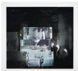
Kate Mosher Hall, Squeeze wax , 2024 Acrylic, flashe, charcoal, and color pencil on canvas 92 x 84 inches (233.7 x 213.4 cm) (KHA0119)