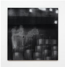
Kate Mosher Hall, Hit silver , 2024 Acrylic and flashe on canvas 52 x 50 inches (132.1 x 127 cm) (KHA0118)