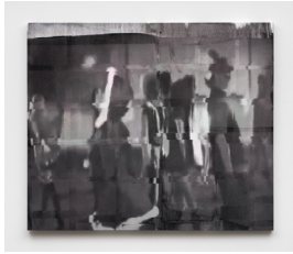
Kate Mosher Hall, Clothing as a spell , 2024 Acrylic and flashe on canvas 55 x 65 inches (139.7 x 165.1 cm) (KHA0115)