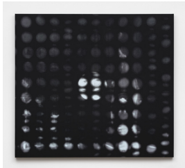
Kate Mosher Hall, Moon mesh , 2024 Acrylic on canvas 80 x 72 inches (203.2 x 182.9 cm) (KHA0114)