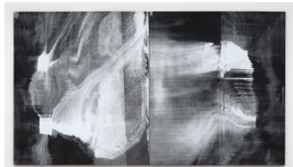
Kate Mosher Hall, Pull up pull up , 2024 Acrylic and charcoal on canvas Diptych dimensions: 90 x 160 inches (228.6 x 406.4 cm) (KHA0113)