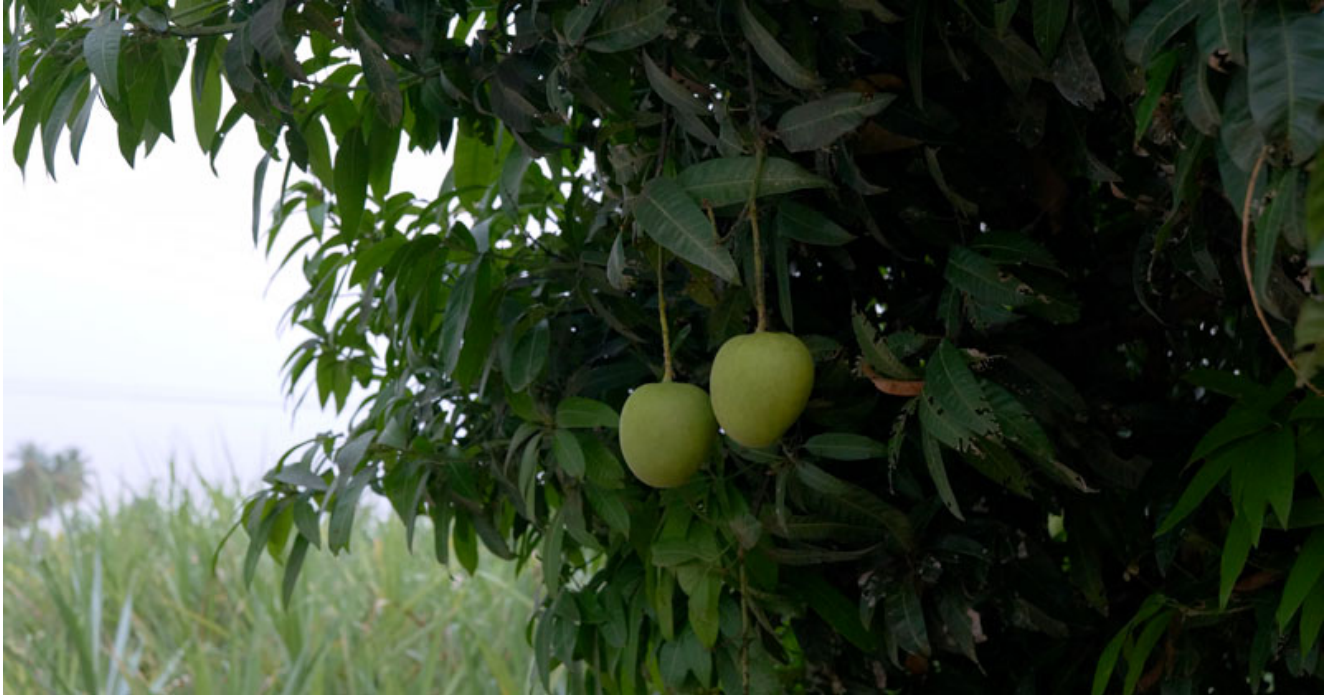
Sindhu Thirumalaisamy After picking up stones around the fort, 2024 Video Digital video, stereo sound 6m 12s S.Th0001