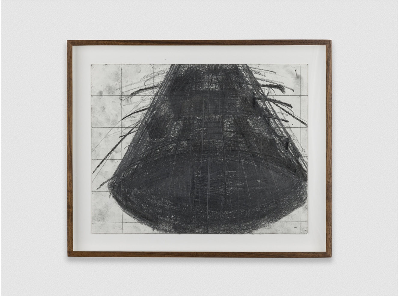
Kaveri Raina Untitled (blues that persist), 2023 Graphite, charcoal, oil pastel, paper 11 x 14 in (27.9 x 35.6 cm) K.Raina0001 Framed