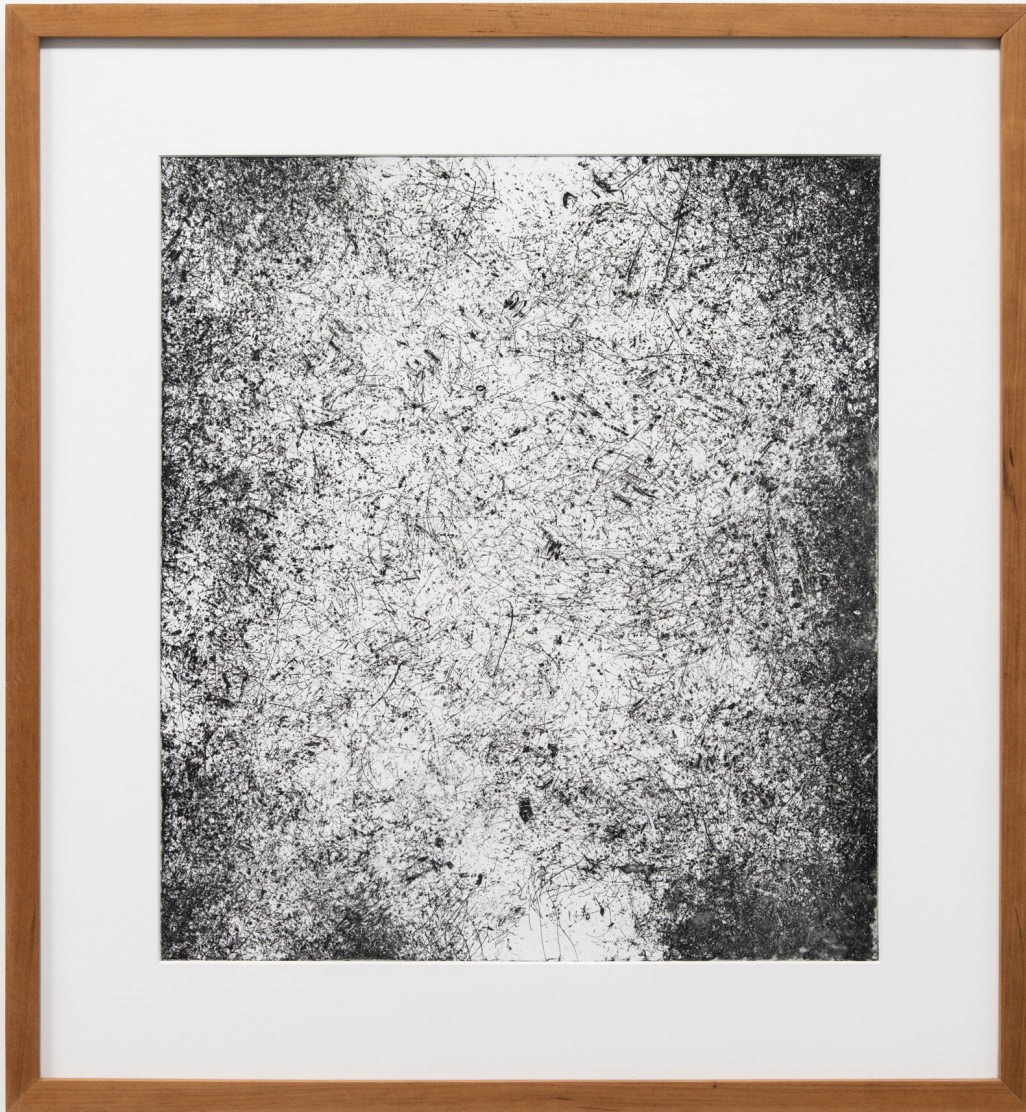
Kate Newby Just be prepared (backyard birds, Southtown) , 2017 Etching and relief 19.5 x 17.5 in (49.5 x 44.5 cm) Print 27.25 x 25.25 x 1.5 in (69.2 x 64.1 x 3.8 cm) Framed K.N0084