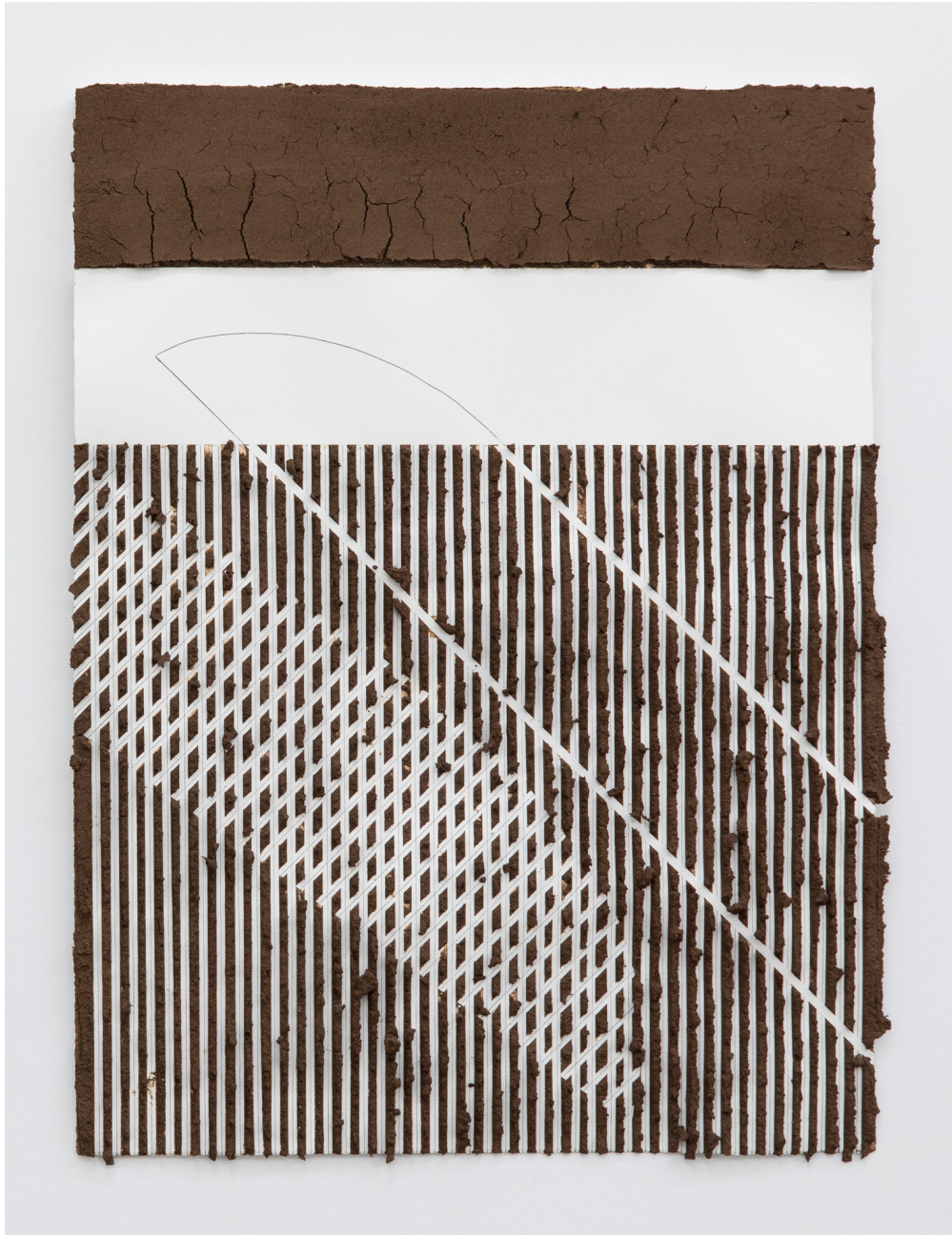
Christine Howard Sandoval Untitled (TBD), 2023 Adobe on paper 20 x 40 in (50.8 x 101.6 cm) C.HS0002