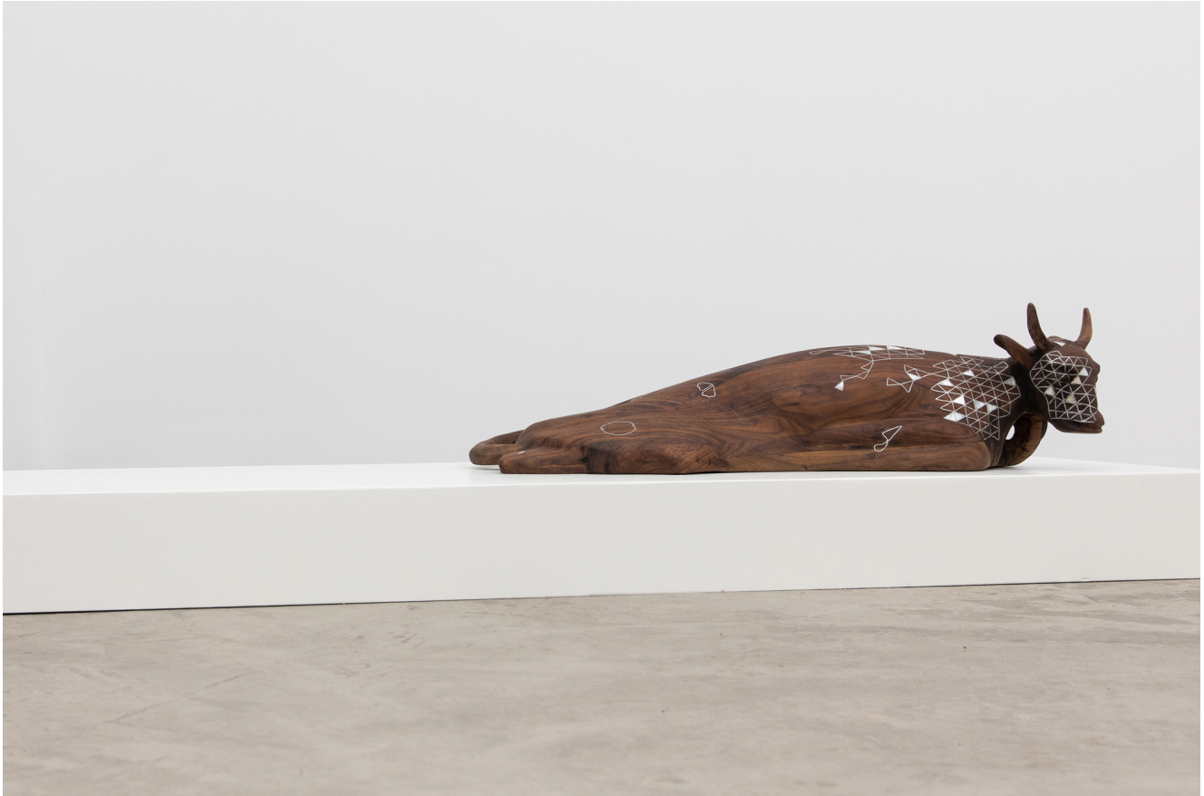
Nour Bishouty Staffage , 2023 Carved walnut with nickel and mother-of-pearl inlay 10.6 x 35.4 x 10.2 in (27 x 90 x 26 cm) N.Bishouty0001