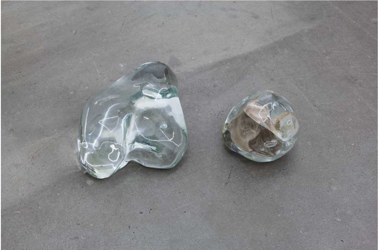
Kate Newby A sky, a wall, and a tree, 2016 Glass, sand Dimensions variable K.Newby0016