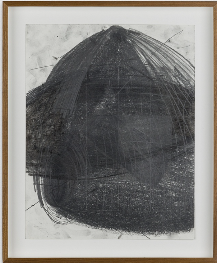
Kaveri Raina Untitled (blues that persist), 2023 Graphite, charcoal, oil pastel, paper 14 x 11 in (35.6 x 27.9 cm) K.Raina0002 Framed