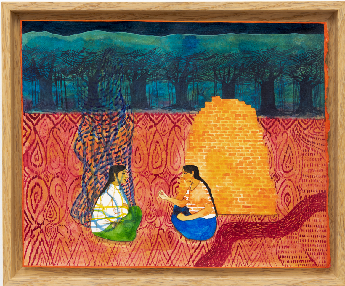
Karishma D'Souza Clarity Conversions, 2018 Watercolor on paper 11 x 13.8 in (28 x 35 cm) 12.6 x 15.2 x 1.2 in (32 x 38.5 x 3 cm) Framed K.DSouza0001