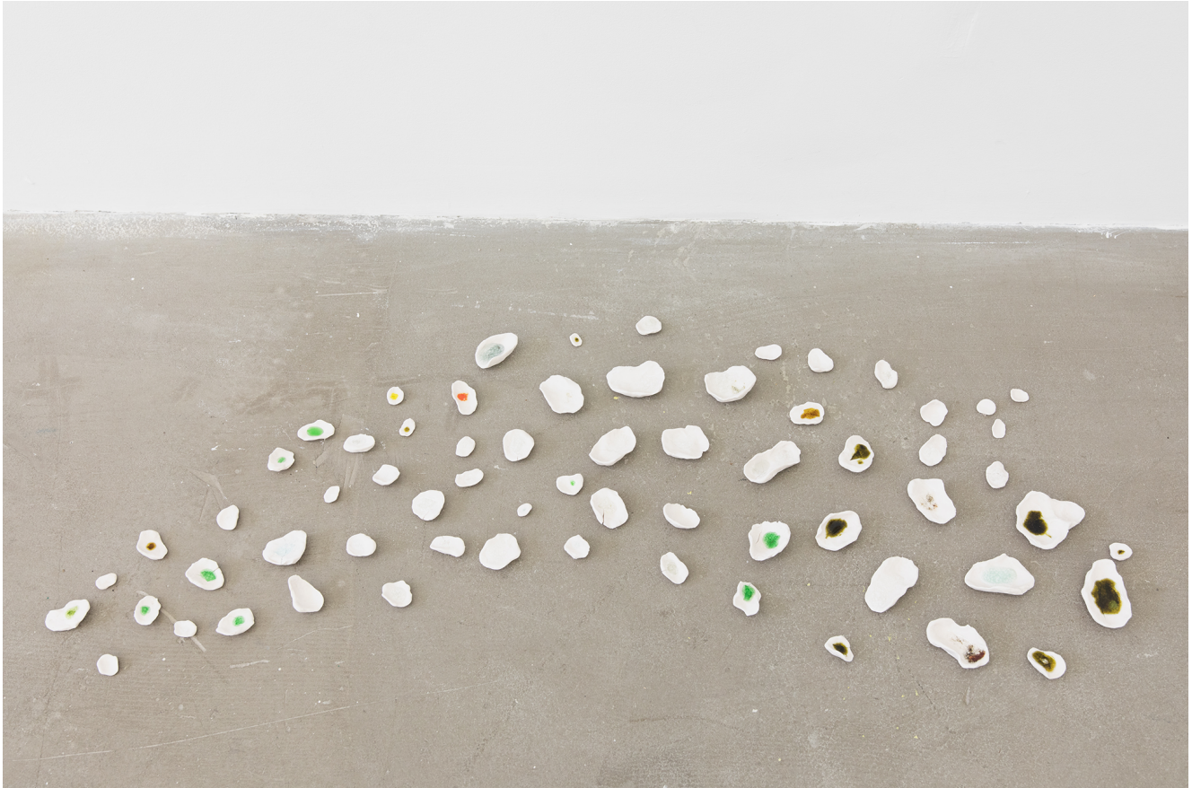
Kate Newby What's the worst that can happen #3, 2018 Porcelain, found glass from sidewalks Dimensions variable K.Newby0034