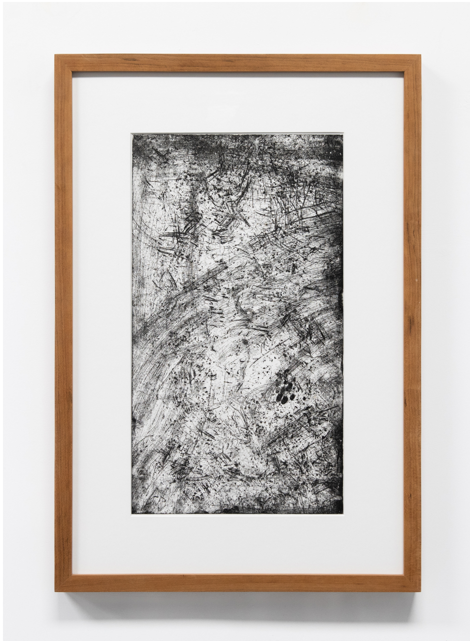
Kate Newby Just be prepared (backyard birds, Southtown) , 2017 Etching and relief 18 x 10 in (45.7 x 25.4 cm) Print 25.25 x 17.25 x 1.5 in (64.1 x 43.8 x 3.8 cm) Framed K.N0082