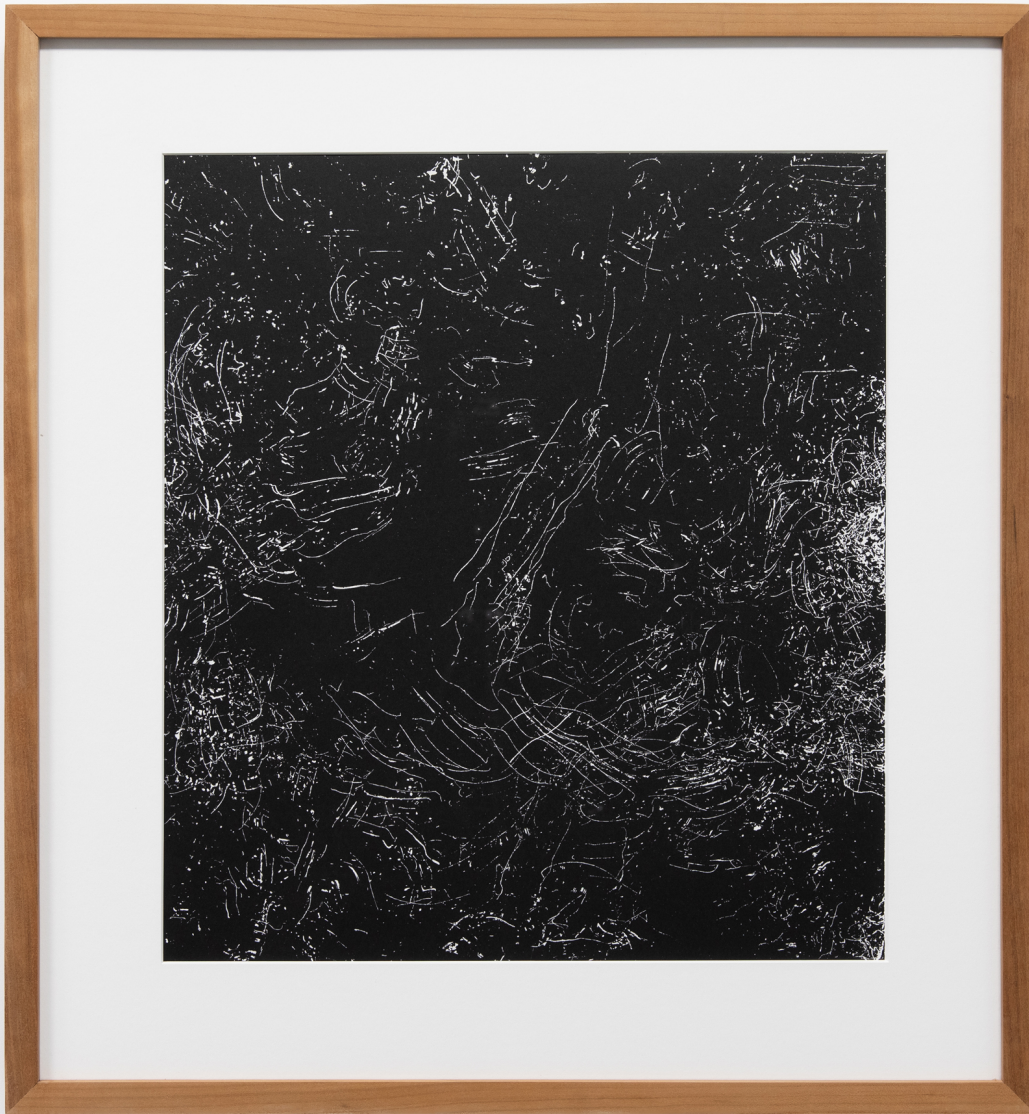
Kate Newby Just be prepared (backyard birds, Southtown) , 2017 Etching and relief 19.5 x 17.5 in (49.5 x 44.5 cm) Print 27.25 x 25.25 x 1.5 in (69.2 x 64.1 x 3.8 cm) Framed K.N0083