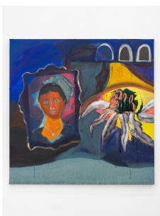
Inès di Folco Jemni Souvenir , 2024 Oil on canvas 100 × 100 cm

Courtesy of the artist and Crèveœur, Paris. Photo: Martin Argyroglo.