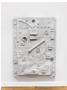
Cezary Poniatowski Guardians of Sleep , 2024 Extruded polystyrene, metal vents, gunfoam 175 × 130 × 25 cm