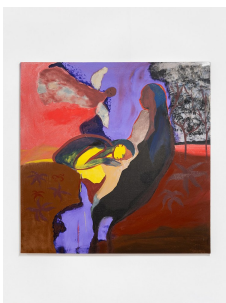
Inès di Folco Jemni Message , 2023 Oil on canvas 100 × 100 cm