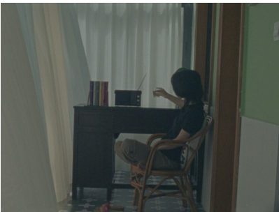
Peng Zuqiang The Cyan Garden, 2022 Single channel, color & BW, 16 mm transferred to HD video 8 min 5 sec Edition of 5

Courtesy of the artist and Crèvecœur, Paris. Photo: Martin Argyroglo.