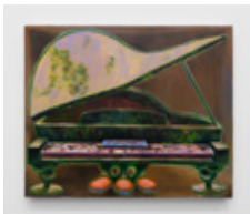
Joel Dean Notes on the Fall of Emphasis (3 key piano) , 2023 Oil on canvas 20 x 24 in (50.8 x 61 cm) JD024