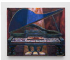
Joel Dean Notes on the Fall of Emphasis (3 key piano) , 2023 Oil on canvas 20 x 24 in (50.8 x 61 cm) JD024