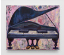
Joel Dean Notes on the Fall of Emphasis (5 key piano) , 2023 Oil on canvas 20 x 24 in (50.8 x 61 cm) JD023