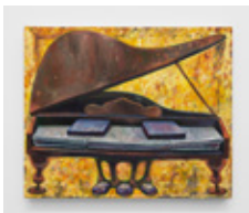
Joel Dean Notes on the Fall of Emphasis (5 key piano) , 2023 Oil on canvas 20 x 24 in (50.8 x 61 cm) JD023