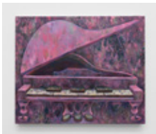
Joel Dean Notes on the Fall of Emphasis (7 key piano) , 2023 Oil on canvas 20 x 24 in (50.8 x 61 cm) JD022