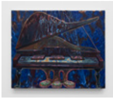
Joel Dean Notes on the Fall of Emphasis (7 key piano) , 2023 Oil on canvas 20 x 24 in (50.8 x 61 cm) JD022