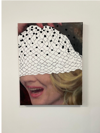
Phantasmagoric at February (2024) Acrylic, gouache, glitter, graphite, colored pencil, pigment transfer and hydrochromic ink on canvas 22 x 35.5 in