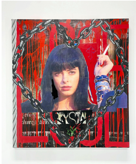
SWEET LEAF (2023)

acrylic, inkjet prints, uv varnish, cut paper, colored pencil, and handwriting paper on canvas 35 x 32 inches