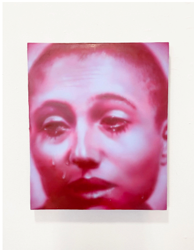
Again out getting ribs (2024) Acrylic on linen 15x 18in