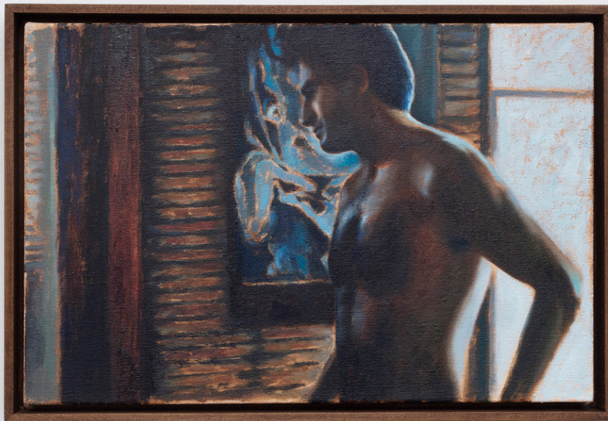
Matt Lifson Dan and Alice , 2023 Oil on linen in wood frame 9 x 14 in. (22.9 x 35.6 cm)