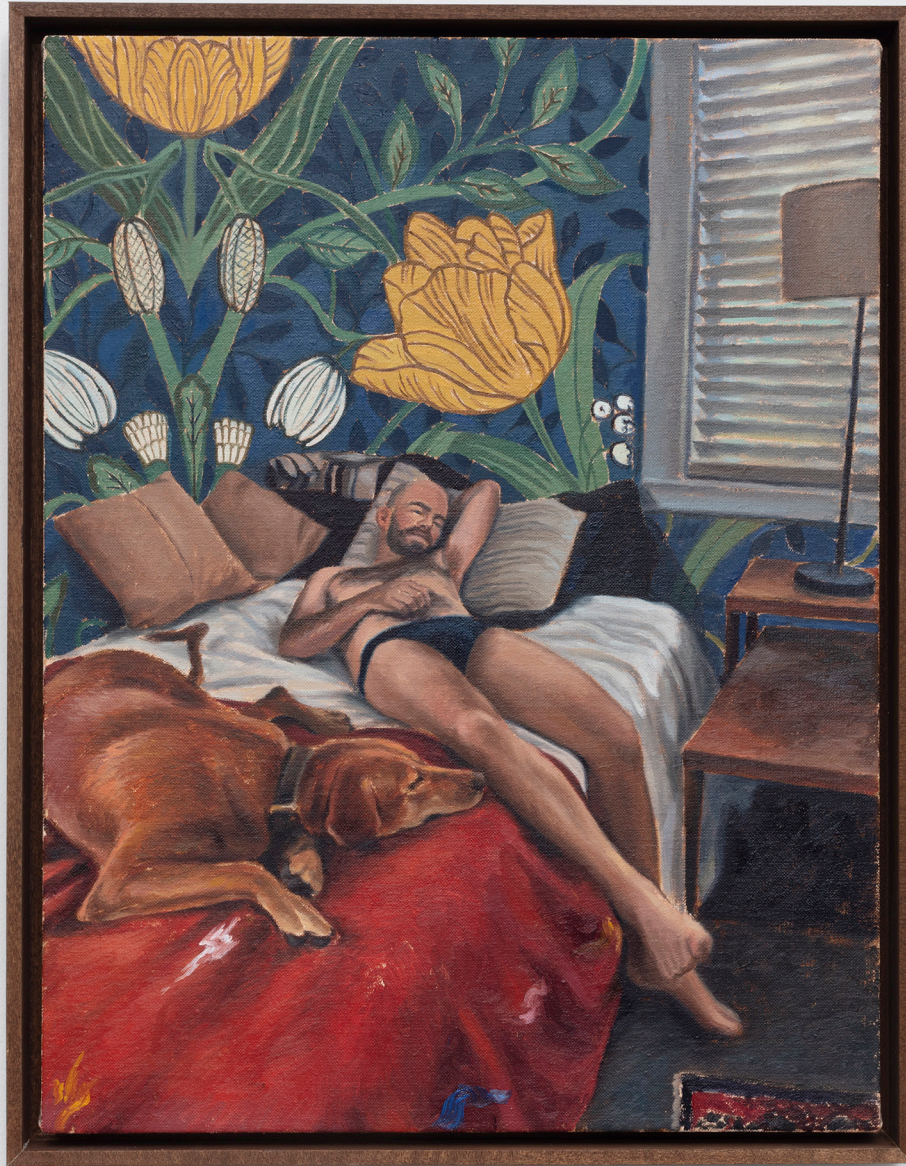
Matt Lifson Brian and Hazel, 2023 Oil on linen in wood frame 17 x 13 in. (43.2 x 33 cm)