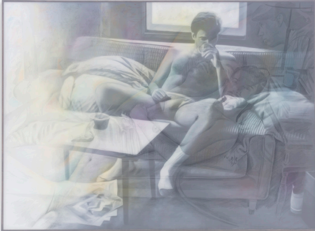
Matt Lifson Morning (whiffs hanging in the air), 2023 Wax pastel, polyester and oil on canvas in wood frame 61 x 79 in. (154.9 x 200.7 cm)