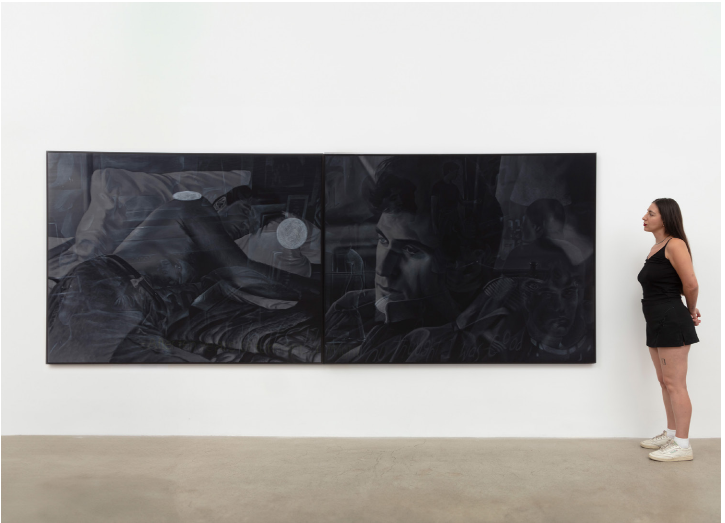
Matt Lifson Night (fade out) , 2023 Wax pastel, polyester and oil on canvas in wood frame 61 x 158 in. (154.9 x 401.3 cm) (diptych)