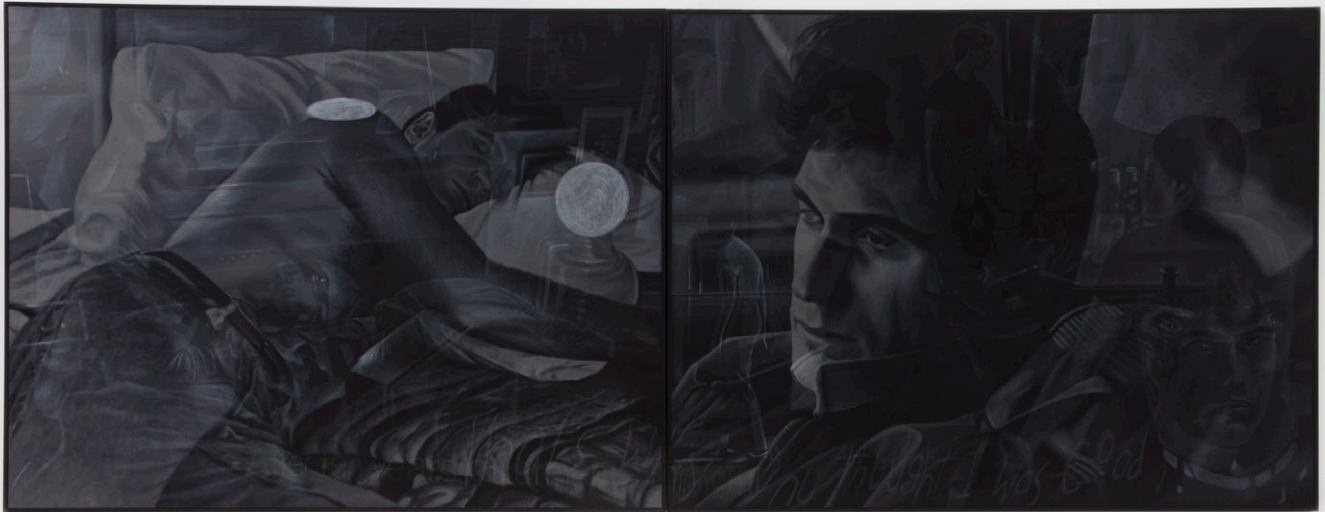
Matt Lifson Night (fade out) , 2023 Wax pastel, polyester and oil on canvas in wood frame 61 x 158 in. (154.9 x 401.3 cm) (diptych)