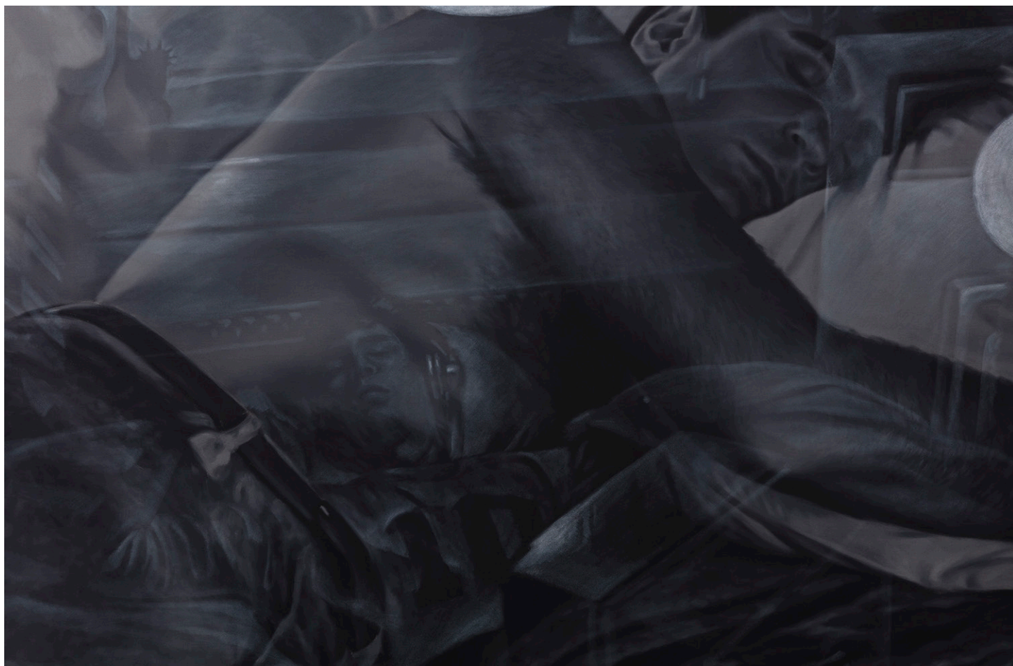
Matt Lifson Night (fade out) (Detail) , 2023 Wax pastel, polyester and oil on canvas in wood frame 61 x 158 in. (154.9 x 401.3 cm) (diptych)