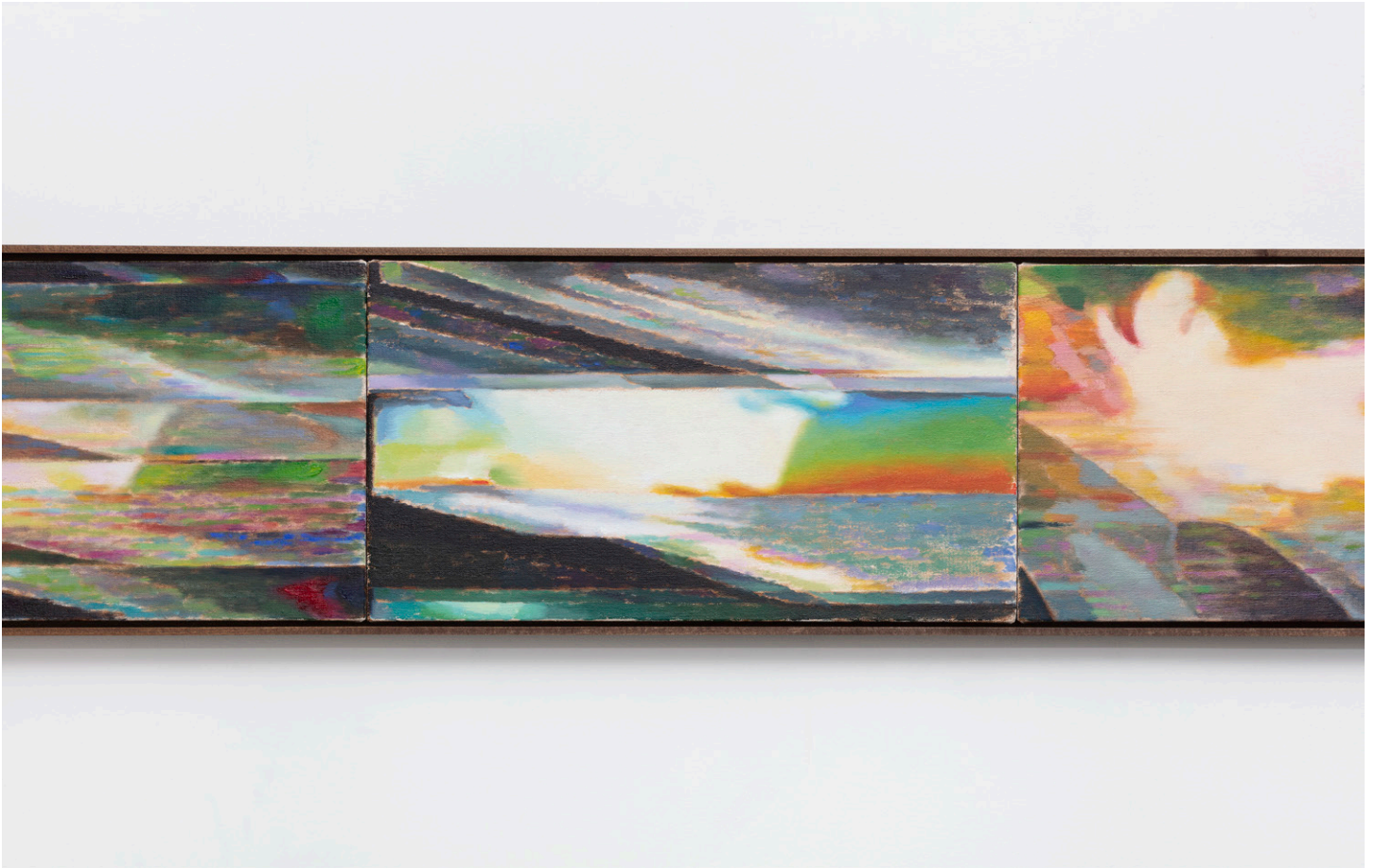
Matt Lifson 1:43-1:44 (Detail) , 2023 Oil on linen in wood frame 12 x 77 in. (30.5 x 195.6 cm)