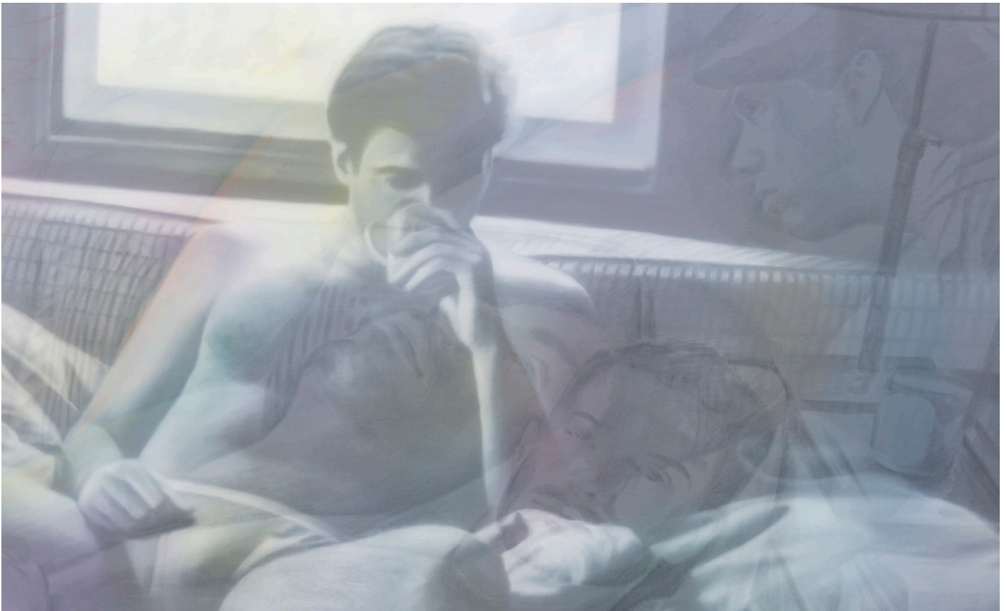
Matt Lifson Morning (whiffs hanging in the air (Detail), 2023 Wax pastel, polyester and oil on canvas in wood frame 61 x 79 in. (154.9 x 200.7 cm)