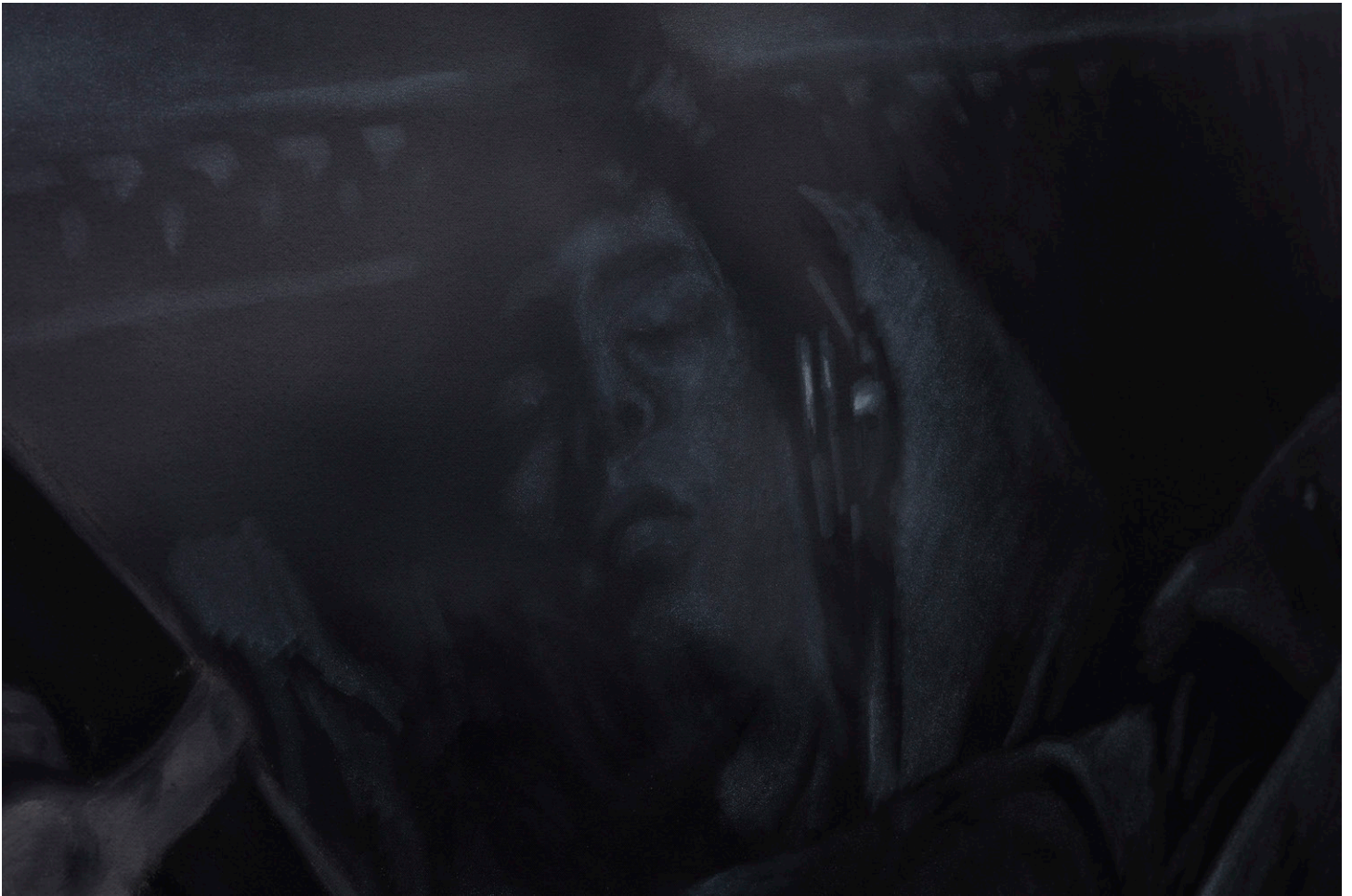
Matt Lifson Night (fade out) (Detail) , 2023 Wax pastel, polyester and oil on canvas in wood frame 61 x 158 in. (154.9 x 401.3 cm) (diptych)