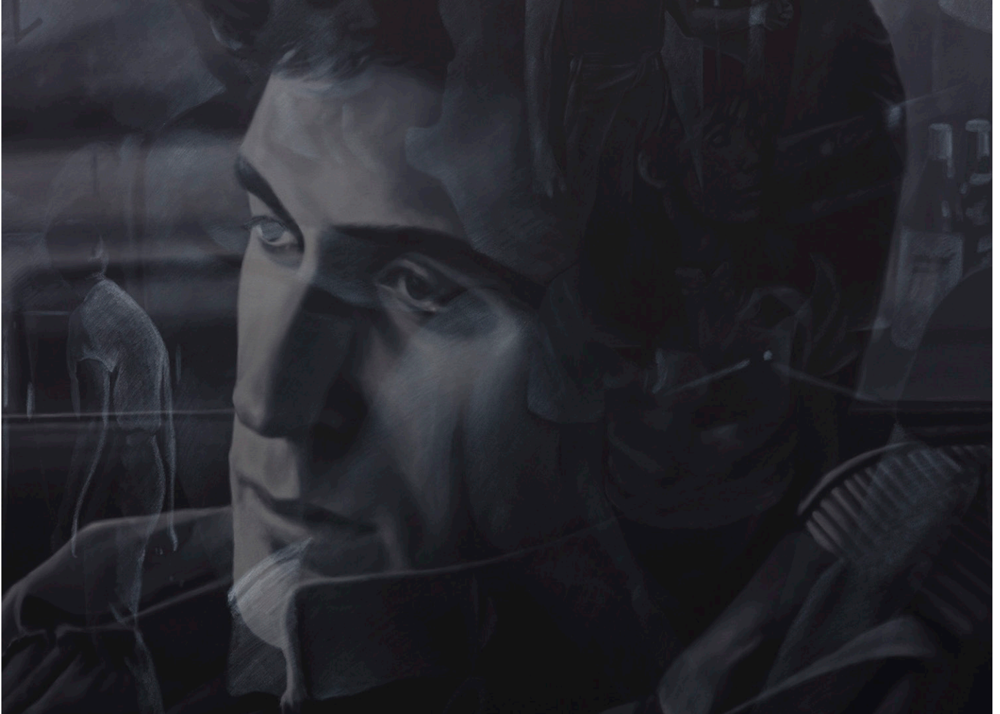
Matt Lifson Night (fade out) (Detail), 2023 Wax pastel, polyester and oil on canvas in wood frame 61 x 158 in. (154.9 x 401.3 cm) (diptych)