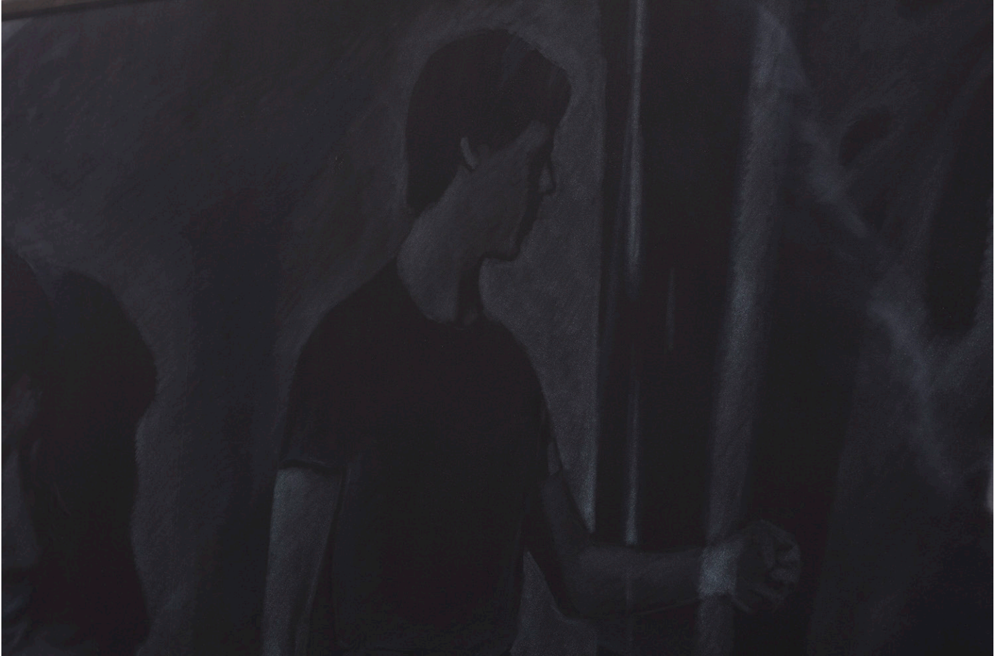
Matt Lifson Night (fade out) (Detail) , 2023 Wax pastel, polyester and oil on canvas in wood frame 61 x 158 in. (154.9 x 401.3 cm) (diptych)