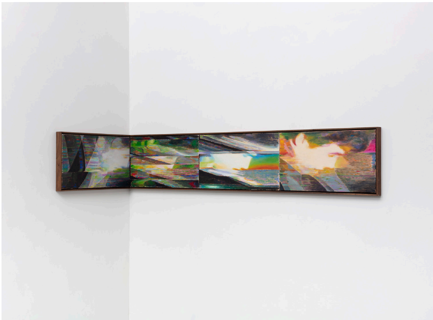
Matt Lifson 1:43-1:44, 2023 Oil on linen in wood frame 12 x 77 in. (30.5 x 195.6 cm)