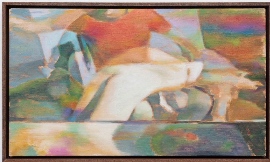
Matt Lifson 00:31, 2023 Oil on linen in wood frame 11 x 19 in. (27.9 x 48.3 cm)