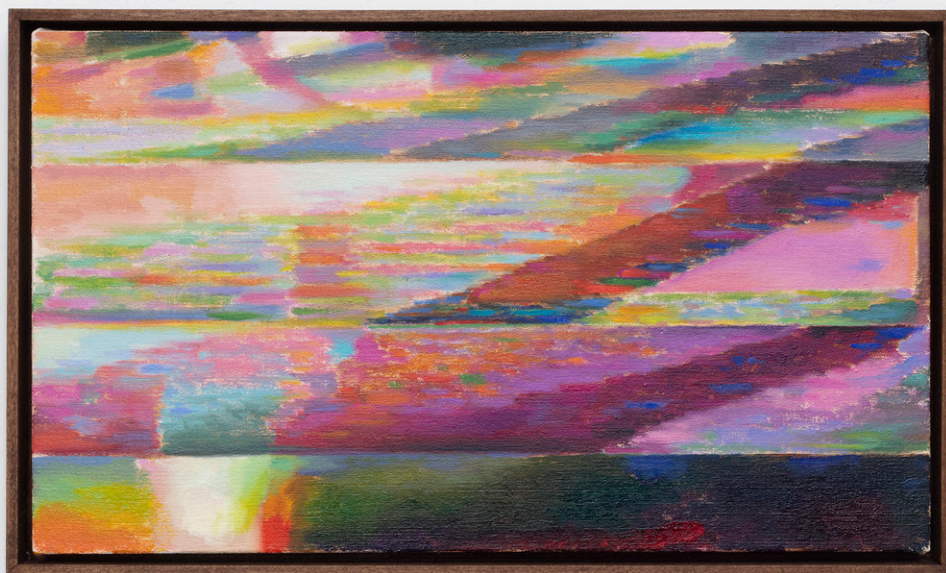
Matt Lifson 1:45, 2023 Oil on linen in wood frame 11 x 19 in. (27.9 x 48.3 cm)