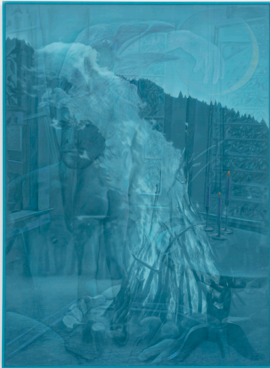
Matt Lifson Evening (after Bosch and Chagall) , 2023 Wax pastel, polyester and oil on canvas in wood frame 61 x 45 in. (154.9 x 114.3 cm)