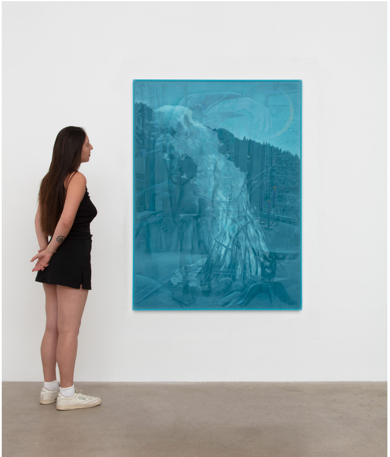
Matt Lifson Evening (after Bosch and Chagall) , 2023 Wax pastel, polyester and oil on canvas in wood frame 61 x 45 in. (154.9 x 114.3 cm)