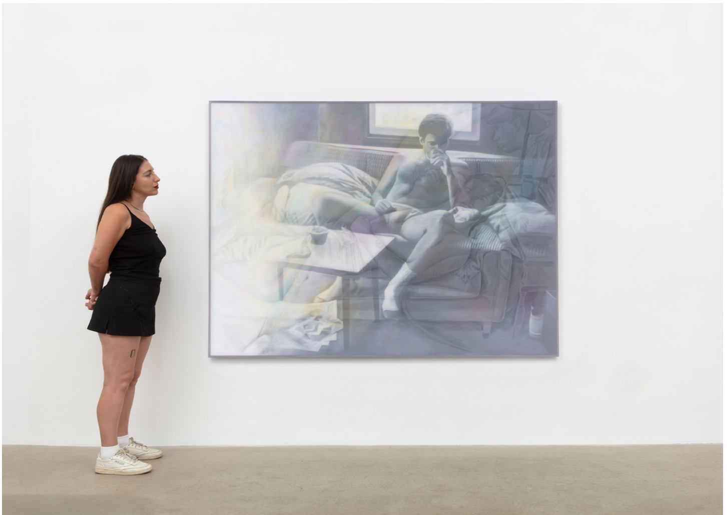
Matt Lifson Morning (whiffs hanging in the air) , 2023 Wax pastel, polyester and oil on canvas in wood frame 61 x 79 in. (154.9 x 200.7 cm)