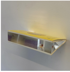
Jacob Kassay Title Pending , 2013 Glass, library book Dimensions Variable (JK001)