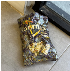
Trisha Baga Untitled, 2016 Glazed ceramic 9 1/2 x 6 1/2 x 3 in (24 x 16 x 8 cm) (TB001)