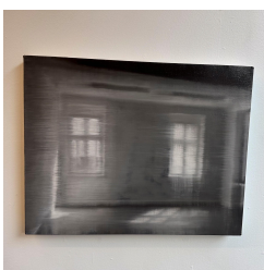
Adam Gordon Untitled , 2023 Oil on canvas 11 x 14 in (27.9 x 35.6 cm) (AG002)