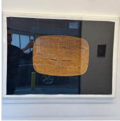
Tony Conrad Yellow TV , 1973 Citron Yello Daylight Fluorescent Naz-Dar Screen Process Ink, Naz-Dar No. 5594, and Scrink Transparent Base, Craftint No. 493 applied over Super White Process Color, Art-Brite No. 700, on Saturated Felt 28 x 38 2/5 x 2 in (71.1 x 97.5 x 5.1 cm) (TC001)