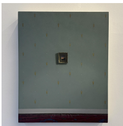
Quentin James McCaffrey Landscape , 2024 Oil on canvas over wood panel 13.5 x 11 x 1.5 in (34.3 x 27.9 x 3.8 cm) (QJM001)