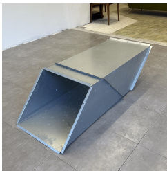
Charlotte Posenenske Series D Vierkantrohre [Square Tubes] (Shape VI Angular Piece) , 1967 Galvanized sheet steel 18 1/8 x 18 1/8 in (46 x 46 cm) (opening) 30 3/4 x 18 1/8 x 18 1/8 in (78 x 46 x 46 cm) (overall) (CP001)