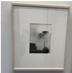
Lousie Lawler Position (verb) , 1982/2020 Gelatin silver print 7 x 5 in (17.8 x 12.7 cm) 15 1/8 x 13 in (38.4 x 33 cm) (framed) (LL003)