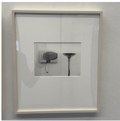
Lousie Lawler Position (noun) , 1982/2020 Gelatin silver print 5 x 7 in (12.7 x 17.8 cm) 15 1/8 x 13 in (38.4 x 33 cm) (framed) (LL004)