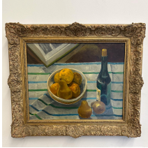
Luigi Lucioni Still Life Of Fruit , 1933 Oil on panel 22 1/2 x 26 1/2 in (57.15 x 67.3 cm) (LL001)