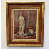
Luigi Lucioni Greek Motif , 1969 Oil on Canvas 15 x 12 1/4 in (38 x 31 cm) (LL002)