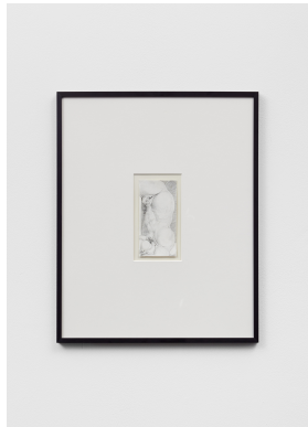
Sibylle Ruppert La Langue , 1970 Lithograph 52 x 45 x 3 cm (20 1/2 x 17 3/4 x 1 1/8 in)