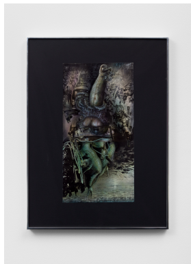
Sibylle Ruppert Escargot / Cortège , 1978 Collage with Crayon 71.5 x 53 x 3.5 cm (28 1/8 x 20 7/8 x 1 3/8 in)