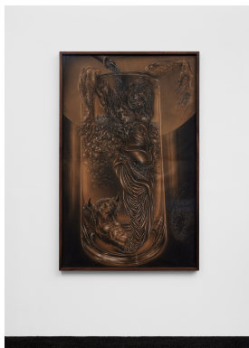
Sibylle Ruppert J'ecrasai le Ver luisant , 1979 Charcoal on paper 170 x 108.5 x 4 cm (66 7/8 x 42 3/4 x 1 5/8 in)