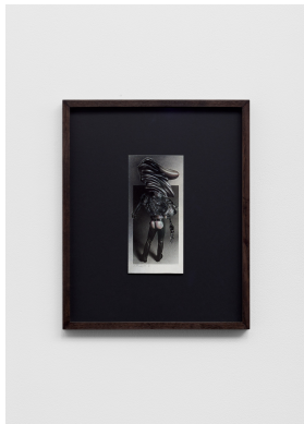
Sibylle Ruppert Pour l'Anniversaire de B.A. , 1978 Collage with airbrush 38 x 31 x 3 cm (15 x 12 1/4 x 1 1/8 in)