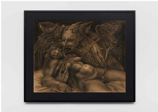
Sibylle Ruppert Ma Soeur mon Epouse , 1975 Charcoal on paper 103 x 125 x 4 cm (40 1/2 x 49 1/4 x 1 5/8 in)