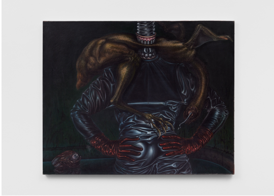
Sibylle Ruppert Le Sacrifice , 1980 Oil and tempera on canvas 65 x 81 x 2 cm (25 5/8 x 31 7/8 x 3/4 in)