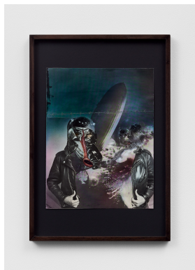
Sibylle Ruppert Le sign / zeppelin , 1978 Collage 54 x 37 x 2.5 cm (21 1/4 x 14 5/8 x 1 in)