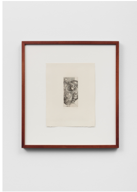
Sibylle Ruppert A Sade , 1972 Etching 55 x 50 x 3 cm (21 5/8 x 19 3/4 x 1 1/8 in)