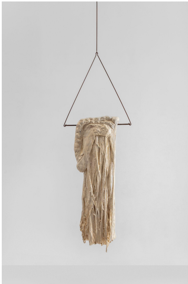
Paloma Bosquê, Fóssil , 2022, wood and dental stone, 251 x 53 x 14 cm. Courtesy of the artist and Mendes Wood DM São Paulo, Brussels, New York..