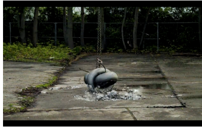
Berlin Depression 2016 Video 1 min Edition of 5