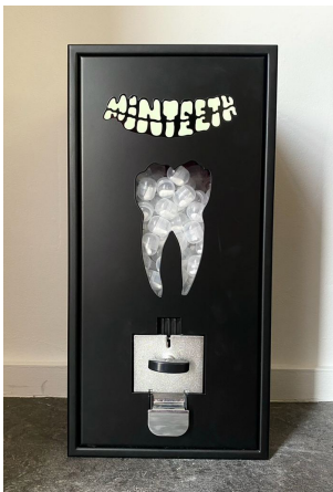
Minteeth 2022 Vendor 56,5 x 28 x 21 cm