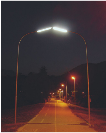
Elektrosex 2005 Street lamps, electric components 700 x 520 x 25 cm