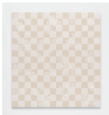
Hanna Hur Sun viii , 2023 color pencil, flashe and pigment on canvas over panel 60 x 56 inches