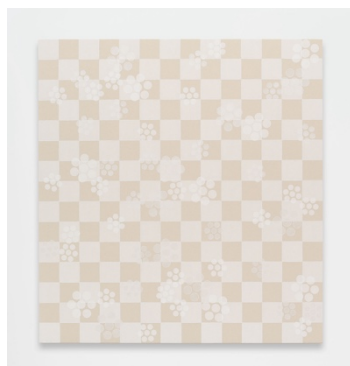
Hanna Hur Sun vii , 2023 color pencil, flashe and pigment on canvas over panel 60 x 56 inches