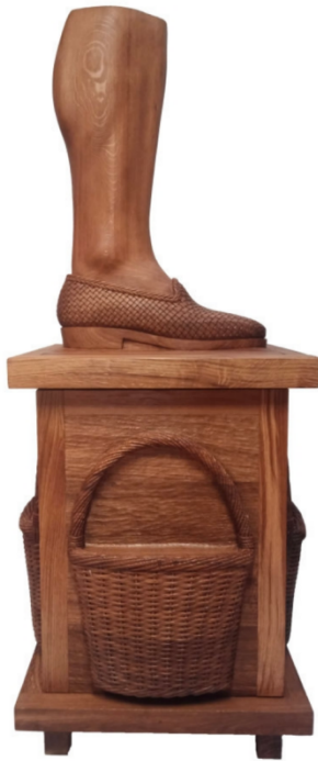
Daniel Dewar & Grégory Gicquel Oak cabinet with woven loafer shoe and leg , 2024 Oak wood 155 x 65 x 56 cm

丹尼尔·杜瓦 & 格雷戈里·吉奎尔 带编织乐福鞋和腿的橡木柜，2024 橡木 155 x 65 x 56 cm