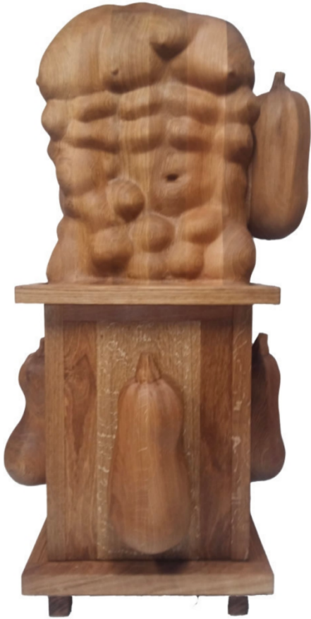
Daniel Dewar & Grégory Gicquel Oak cabinet with courgettes and body fragments , 2024 Oak wood 155 x 89 x 70 cm

丹尼尔·杜瓦 & 格雷戈里·吉奎尔 带西葫芦和躯干的橡木柜，2024 橡木 155 x 89 x 70 cm