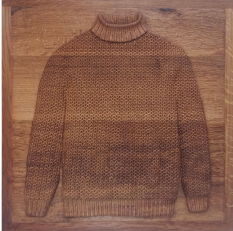
Daniel Dewar & Grégory Gicquel Oak relief with garter stitch pull-over, 2024 Oak wood 115 x 115 x 9 cm

丹尼尔·杜瓦 & 格雷戈里·吉奎尔 带罗纹针织衫的橡木浮雕，2024 橡木 115x 115 x 9 cm