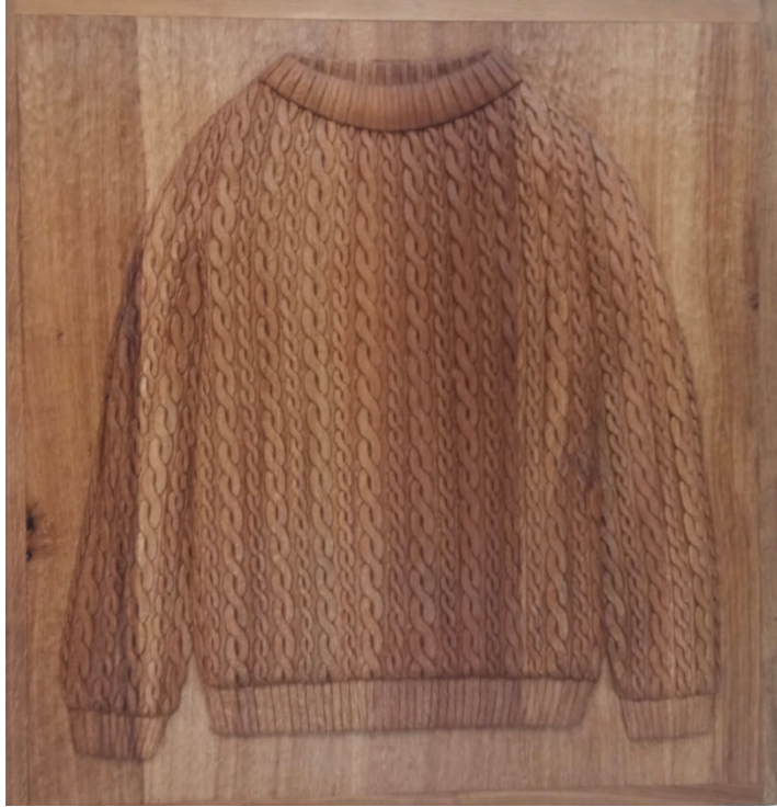
Daniel Dewar & Grégory Gicquel Oak relief with cable stitch pull-over , 2024 Oak wood 117 x 112 x 9 cm

丹尼尔·杜瓦 & 格雷戈里·吉奎尔 带绞花针织衫的橡木浮雕，2024 橡木 117 x 112 x 9 cm