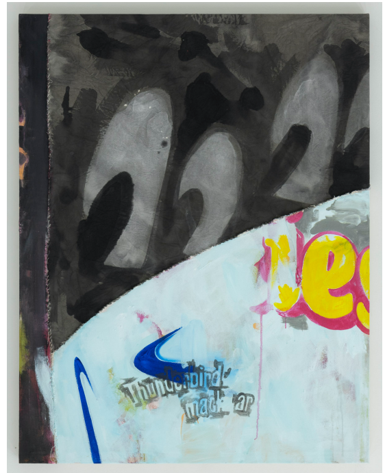
KINJO "untitled" 2023, Acrylic, aerosol, oil pastel on canvas, 117 x 91 x 4cm

Born and currently based in Tokyo, Japan. With family roots in Okinawa, the artist explores Japanese-American cultural intersections through paintings, sculptures, and performances. Symbols such as eyes glowing in darkness, cereal packages, and snakes undergo a process of repeated creation and erasure, blurring their outlines into a charmingly ambiguous semblance akin to the artist's own portrait, transforming into a "personal presence." This act serves as a quasi-self-portrait for KINJO, delving into the depths of his own roots.