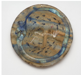
Chioma Ebinama, Daughters of the dawn , 2024 Watercolor, sumi ink, casein, gouache and coffee on handmade paper 21 5/8 x 21 5/8 inches (55 x 55 cm) (CEB0003)