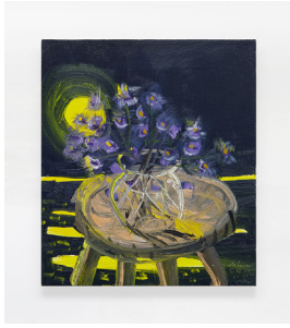
Ann Craven, Purple Weeds (For the Moon, 8-30-23, 10:30 PM, Cushing) , 2023, 2023 Oil on canvas 14 x 12 inches (35.6 x 30.5 cm) (ACR0212)