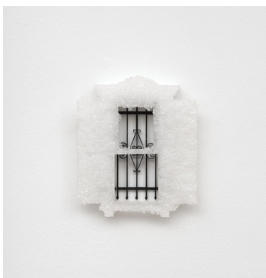
Sula Bermúdez-Silverman, Beneath, Below, Behind , 2024 Salt, epoxy resin, and wood 6 ¼ x 5 ½ x 1 ¼ inches (15.9 x 14 x 3.2 cm) (SSI0002)