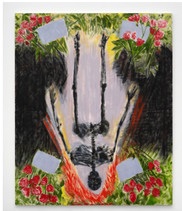
Sydney Acosta, Beneath the Mattress , 2023 Oil on canvas 88 x 72 inches (223.5 x 182.9 cm) (SAC0001)