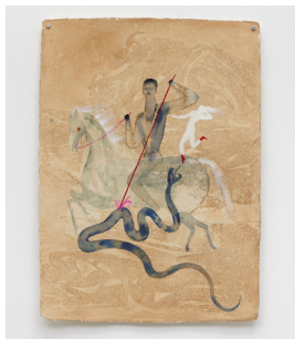
Chioma Ebinama, Saint George , 2023 Watercolour, gouache, sumi ink, and coffee on handmade cotton rag paper 31 1/2 x 21 5/8 inches (80 x 55 cm) (CEB0001)