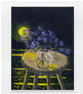
Ann Craven, Purple Weeds (For the Moon, 8-30-23, 10 PM, Cushing) , 2023, 2023 Oil on canvas 24 x 18 inches (61 x 45.7 cm) (ACR0211)