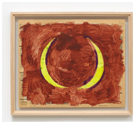
Paul Thek, Untitled (Two Crescent Moons) , 1983 Acrylic and gesso on newspaper 23 x 27 inches (58.4 x 68.6 cm) (PTH0014)