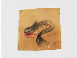
Chioma Ebinama, Sister 03 , 2023 Watercolour and coffee on handmade cotton rag paper 5 7/8 x 5 1/2 inches (15 x 14 cm) (CEB0002)

Sydney Acosta, Sula Bermúdez-Silverman, Ann Craven, Chioma Ebinama, Hanna Hur, Paulina Peavy, Paul Thek Lavinia (March 30 - May 4, 2024)