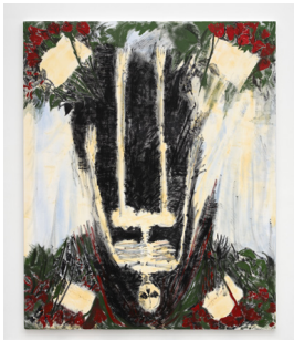
Sydney Acosta, Ascension , 2023 Oil on canvas 88 x 72 inches (223.5 x 182.9 cm) (SAC0002)