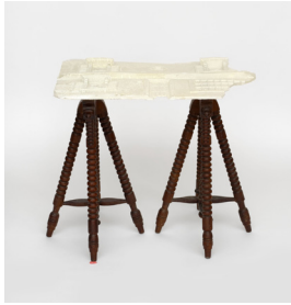
Sula Bermúdez-Silverman, Decadence , 2024 Wood casket stands, chewed gum, insect-eaten isomalt sugar, and shellac 18 ½ x 27 ¾ x 22 ½ inches (47 x 70.5 x 57.1 cm) (SSI0003)