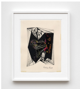
Paulina Peavy, Untitled , c. 1960s, early 1970s Ink, marker on paper 19 x 15 ¾ inches (48.3 x 40 cm) (PPE0003)