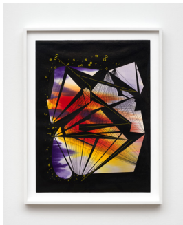
Paulina Peavy, Untitled , 1984 Ink, Letraset, polymer film on paper 27 ¾ x 21 ¾ inches (70.5 x 55.2 cm) (PPE0001)