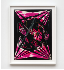
Paulina Peavy, Untitled , 1984 Ink, polymer film on paper 28 ¼ x 22 ¼ inches (71.8 x 56.5 cm) (PPE0002)