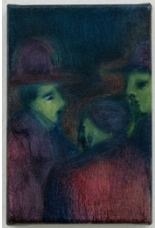
Photo: Oliver Roura Courtesy the artist and Meyer Riegger, Berlin/Karlsruhe/Basel

Painter, Berlin, 2024 ? gouache and ink on paper 30 x 10,5 cm