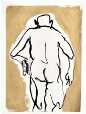
Photo: Oliver Roura Courtesy the artist and Meyer Riegger, Berlin/Karlsruhe/Basel

Who's the Captain...Blanket, 2024 ink and oil pastel on paper 21,5 x 15,5 cm