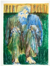
Courtesy the artist and Meyer Riegger, Berlin/Karlsruhe/Basel

After Depardon's Picture, 2024 gouache and ink on paper 21 x 15 cm