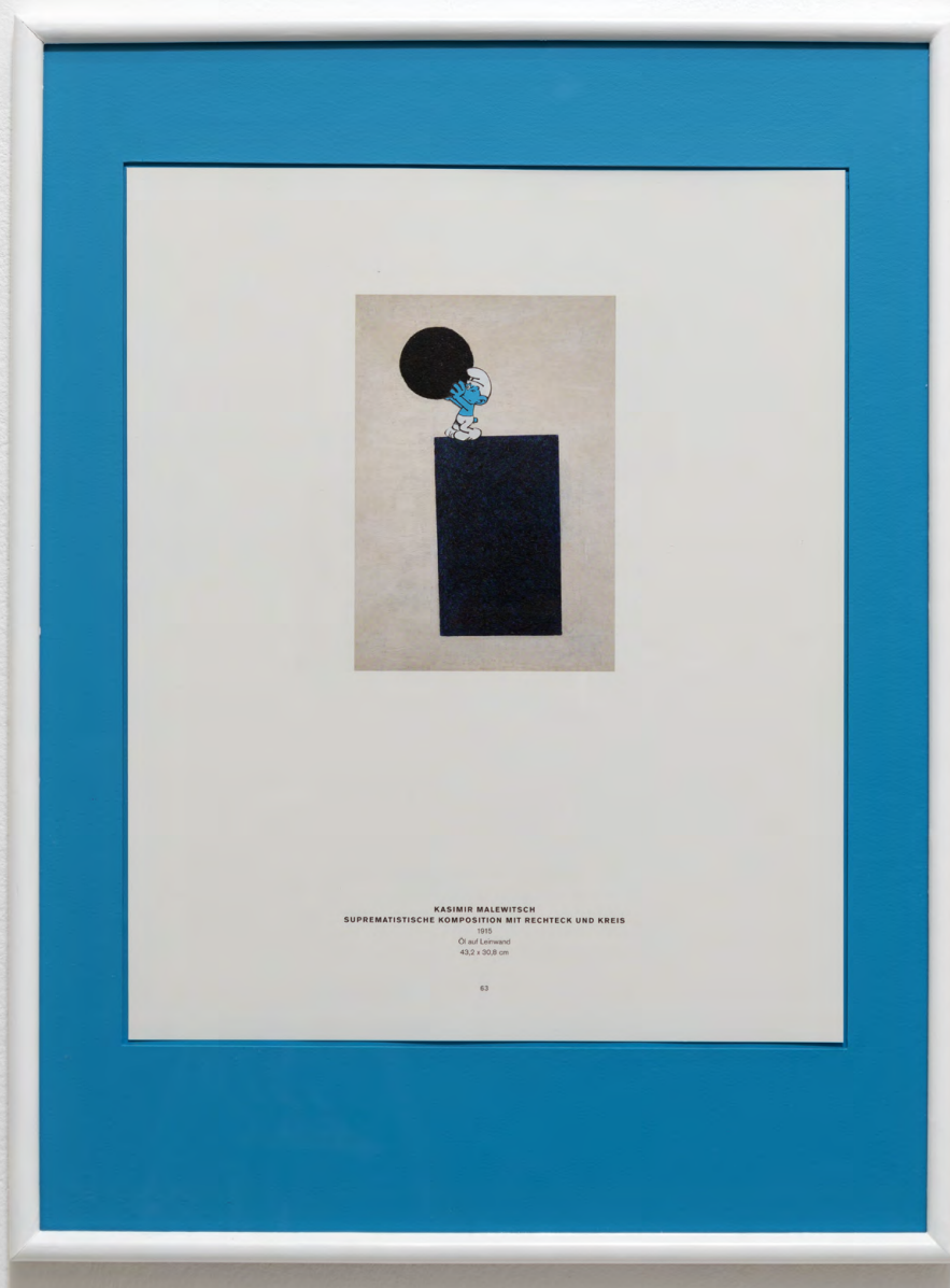
Hank Schmidt in der Beek Collage Nr.966 (Kasimir Malewitsch / Schlumpf), 2022 Collage 41,5 x 31,5 cm (framed)