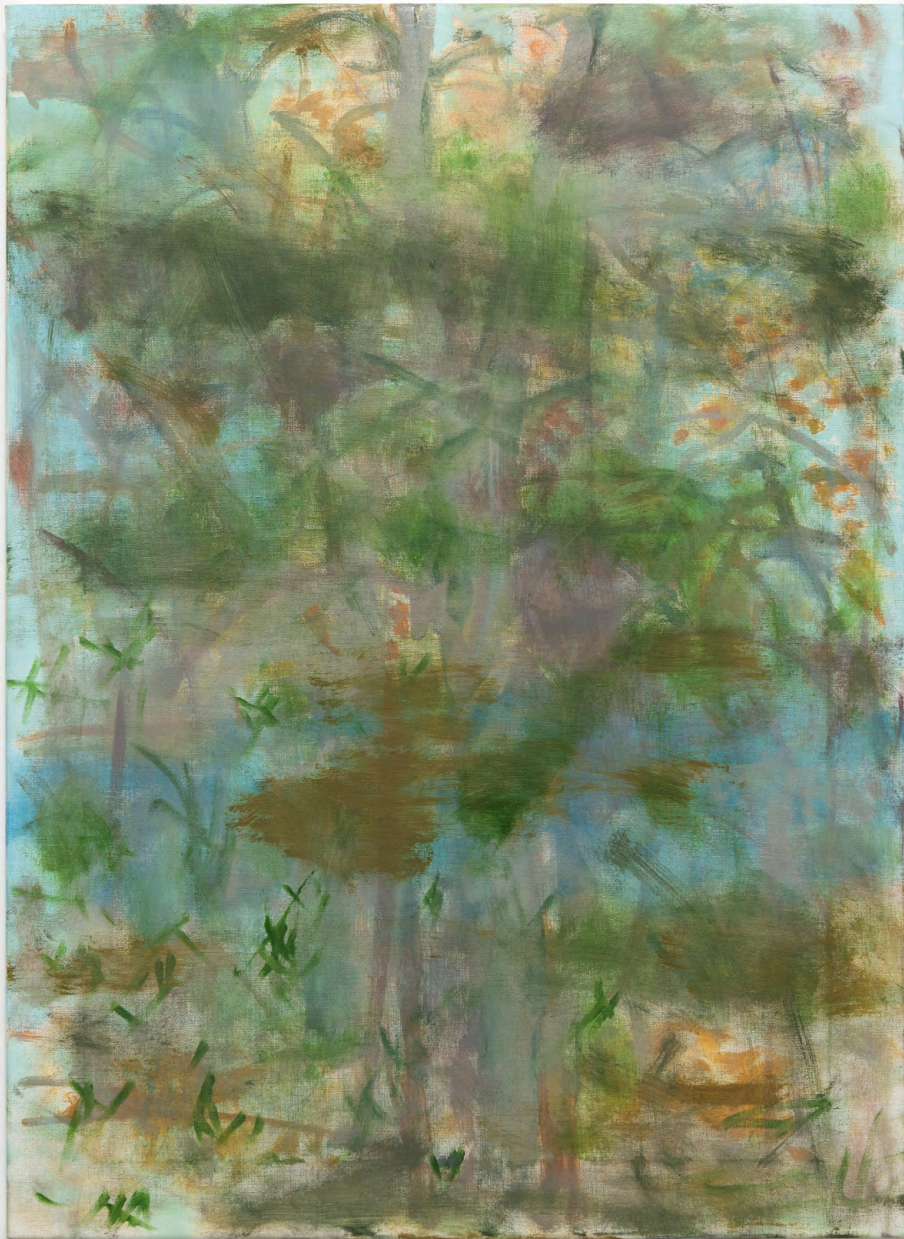
Trevor Shimizu Fall-Winter 2024 (Hudson River) , 2024 Oil on linen 76 x 56,5 cm