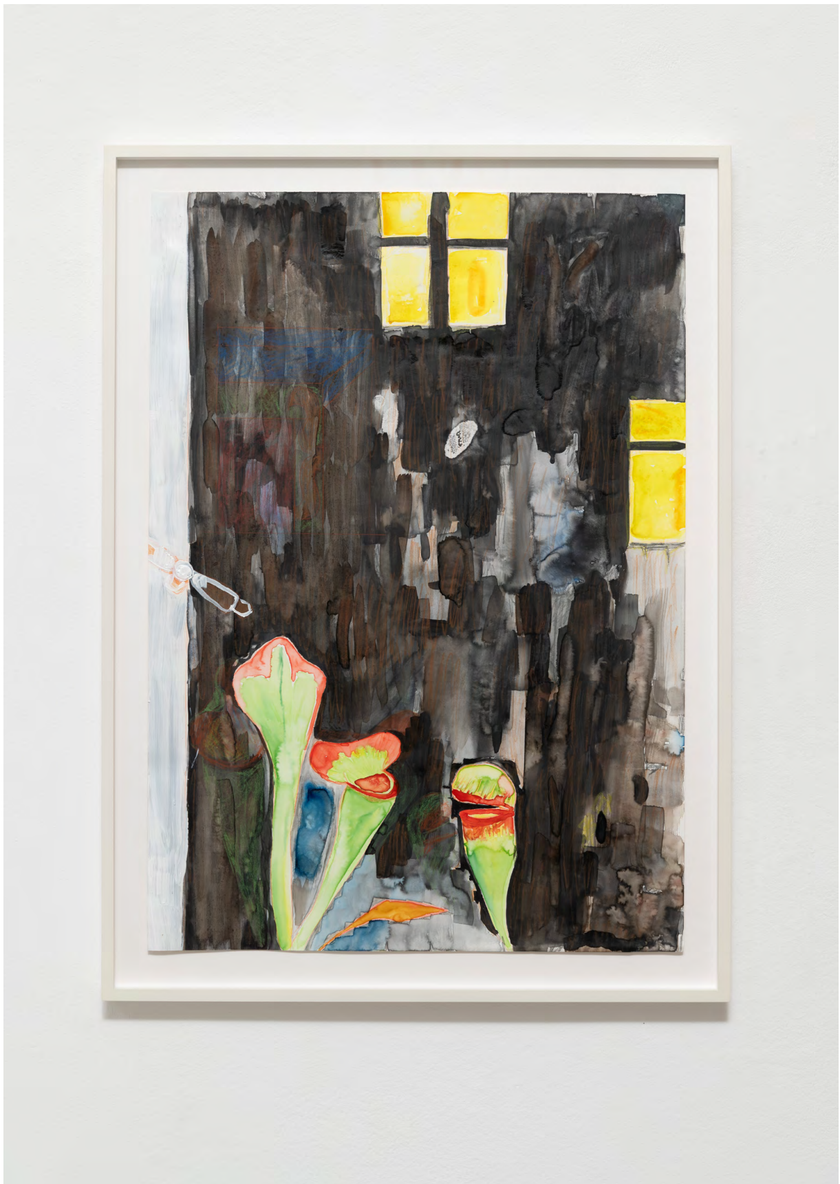
Johanna Klingler Untitled (from the series "working on a particular condition") , 2021 Acrylic paint, watercolor, colored pencil & grease on stone paper 58 x 41,5 cm, 66,5 x 49 cm (framed)