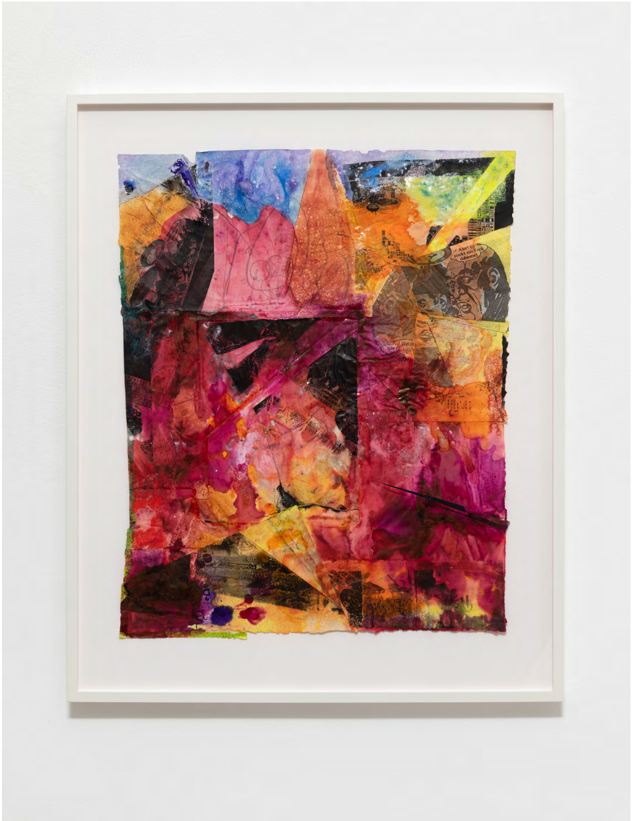
Kristina Schmidt/Justin Lieberman Foundation of an intellectual configuration , 2024 Laser Print, Pigment, Watercolor, Glue, Tape on Paper 58 x 47 cm, 71,5 x 58,5 cm (framed)