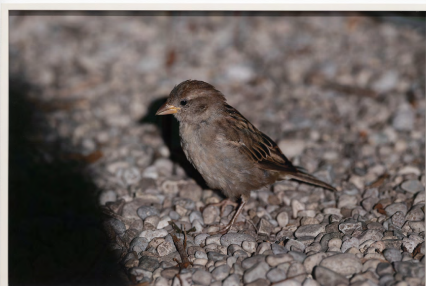
Frank Stürmer Untitled (Ambach) , 2023/24 Pigment Print 37,9 x 56,8 cm, 39,5 x 58 cm (framed) Edition 1/3