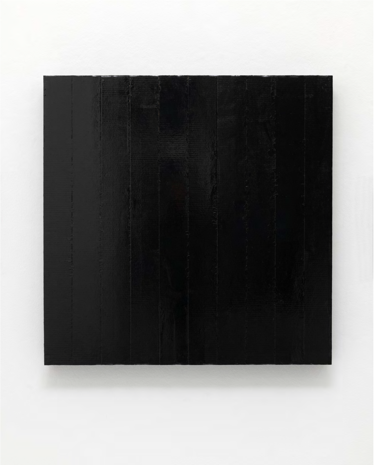
Heimo Zobernig Untitled , 2021 Synthetic resin varnish, cardboard 100 x 100 x 10 cm