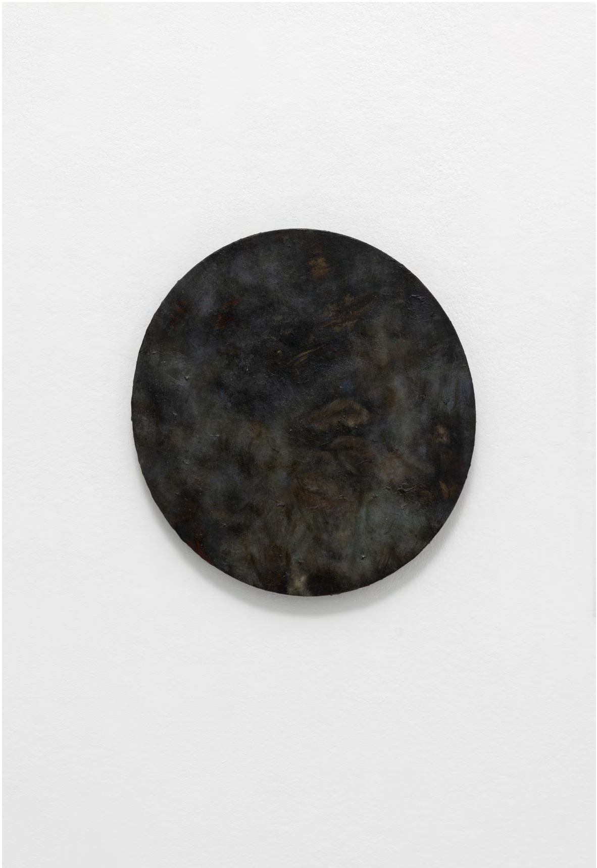
Jinn Bronwen Lee Goat Song (Tragos & Oide) , 2024 Oil on canvas 31 x 33,5 cm