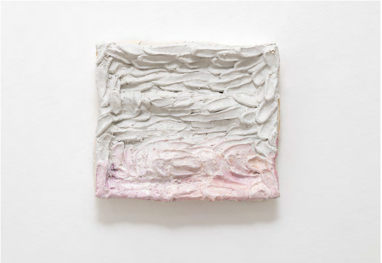
Emanuel Wadé Untitled , 2023 Wire and oil paint on canvas 52 x 37 x 17 cm