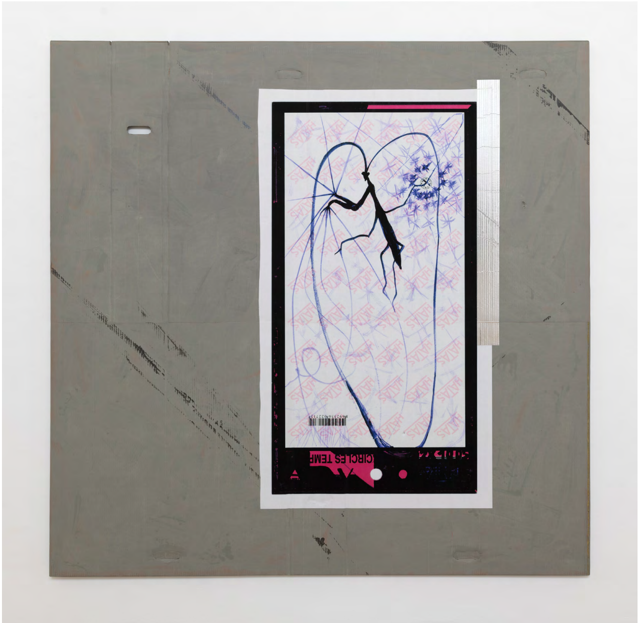
Aribert von Ostrowski CIRCLES TEMP , 2008 Wax pigment print on paper, aluminum foil and synthetic resin paint on corrugated cardboard on stretcher frame 201,5 x 201,5 x 3 cm