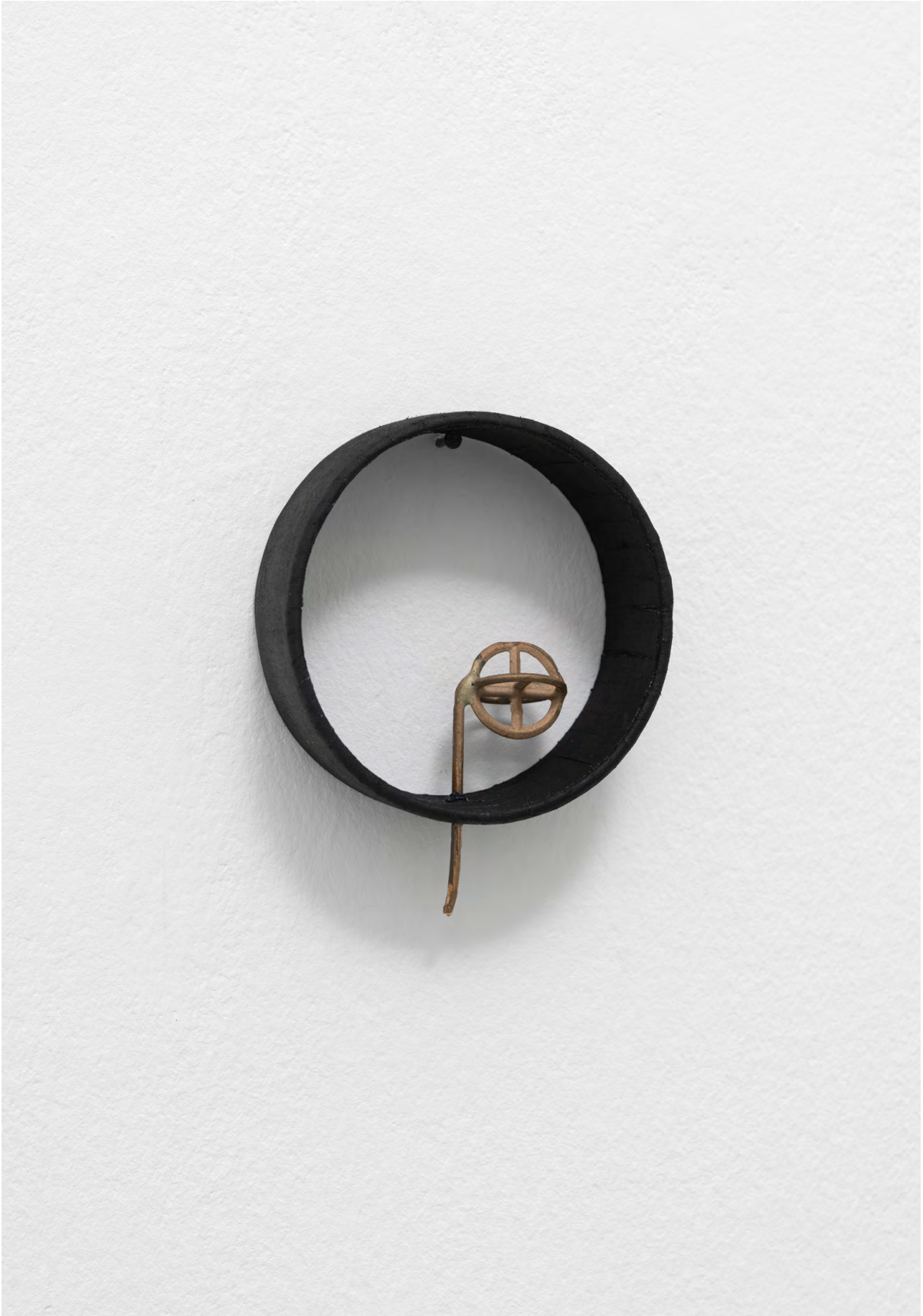
Franka Kaßner Abgeschirmte Umweltsuche , 2024 Bronze, cardboard, adhesive tape, acrylic, pigment 15 x 12 x 5 cm