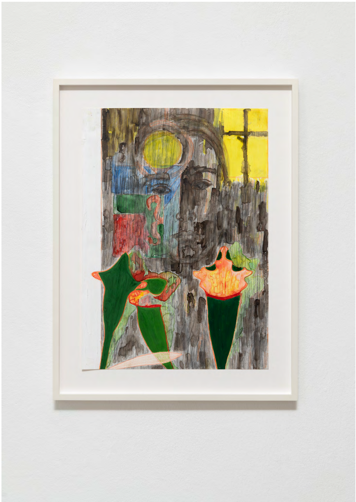
Johanna Klingler Untitled (From the series "working on a particular condition"), 2021 Gesso, watercolor & colored pencil on stone paper 42 x 29 cm, 51,7 x 38,2 cm (framed)