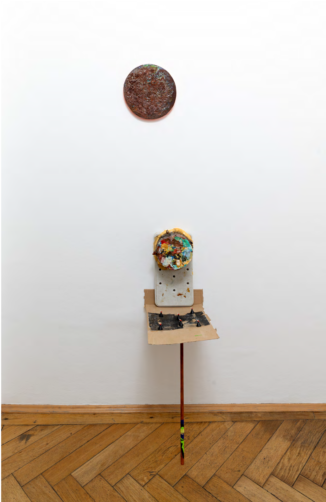
Kristina Schmidt/Justin Lieberman The perverse charme of tedious obligation , 2024 Mixed Media 190 x 45 x 46 cm