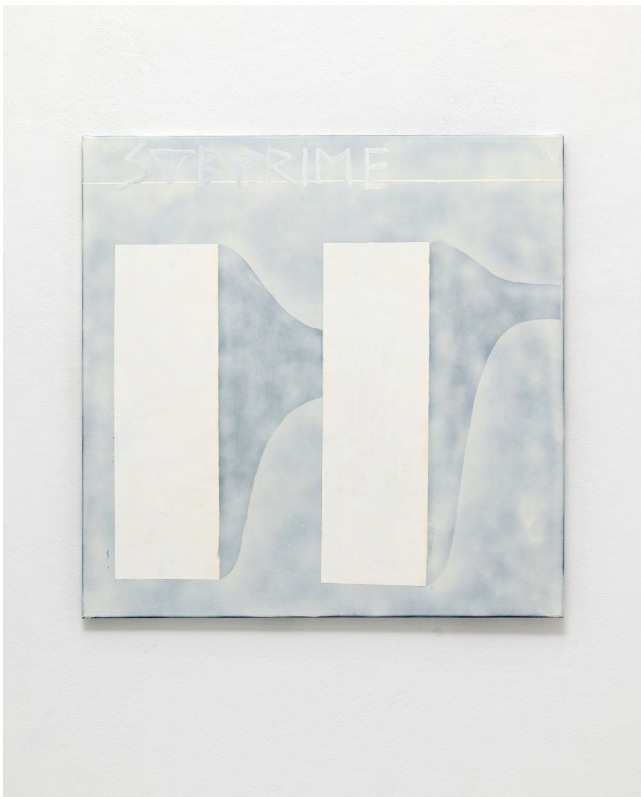
Andy Hope 1930 Subprime I , 2016 Spray paint/oil on canvas 80 x 80 cm