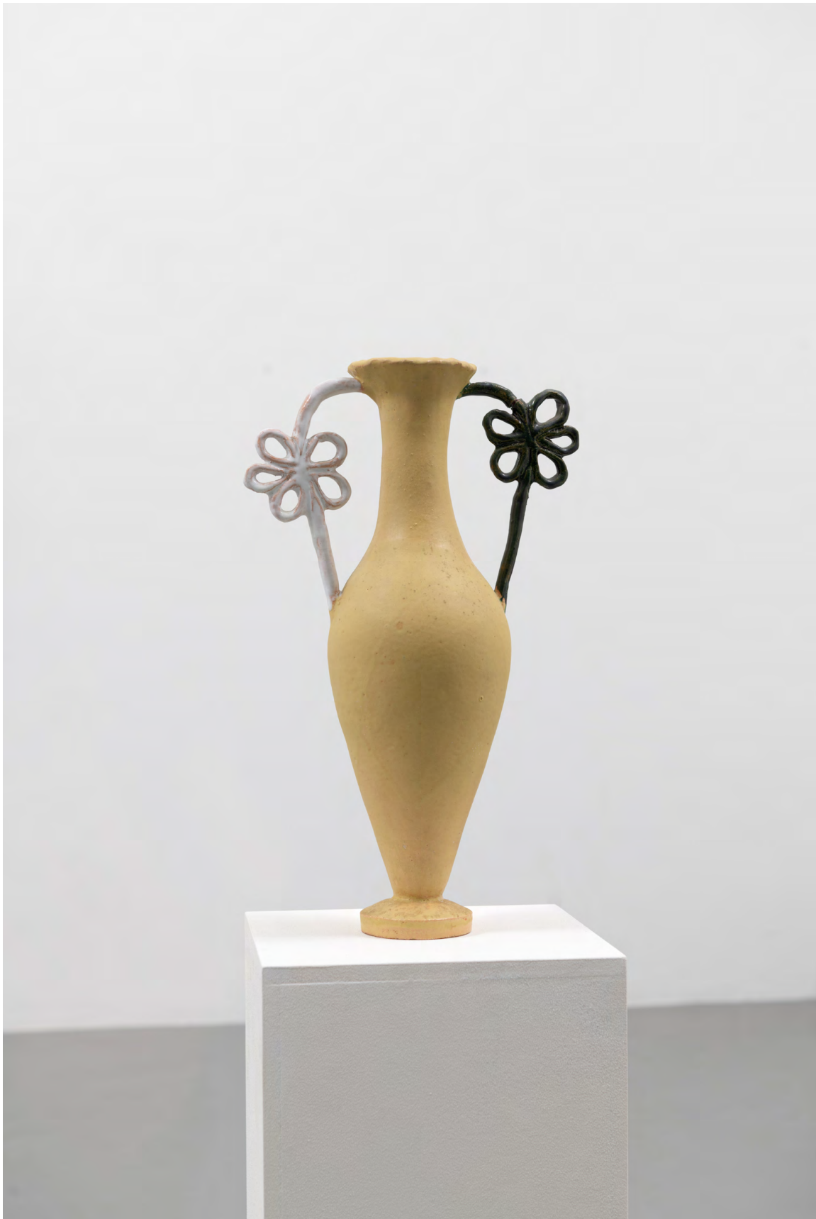
Anne Rößner Amphore mit Blumenhenkel , 1996 Glazed ceramics 40,5 x 24,5 x 13 cm