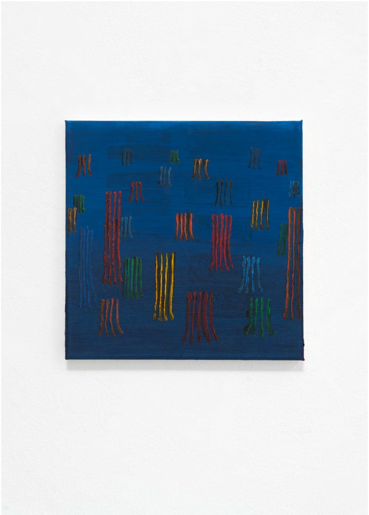
Joseph Zehrer Untitled , 2024 Acrylic on canvas 30 x 30 cm