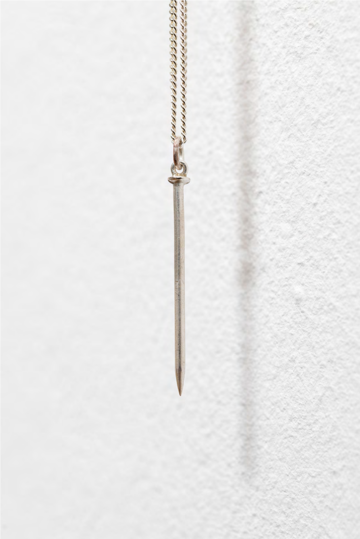
Untitled, 2024, detail