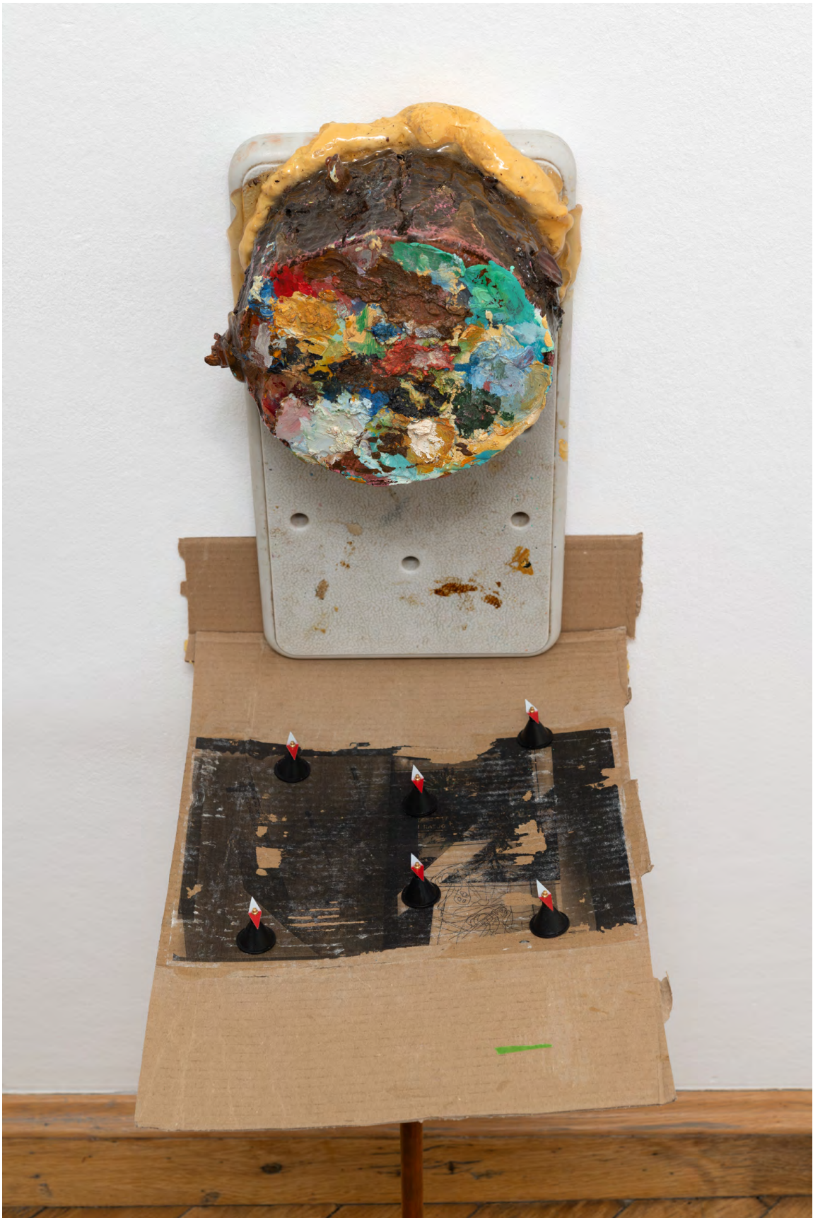
The perverse charme of tedious obligation, 2024, detail