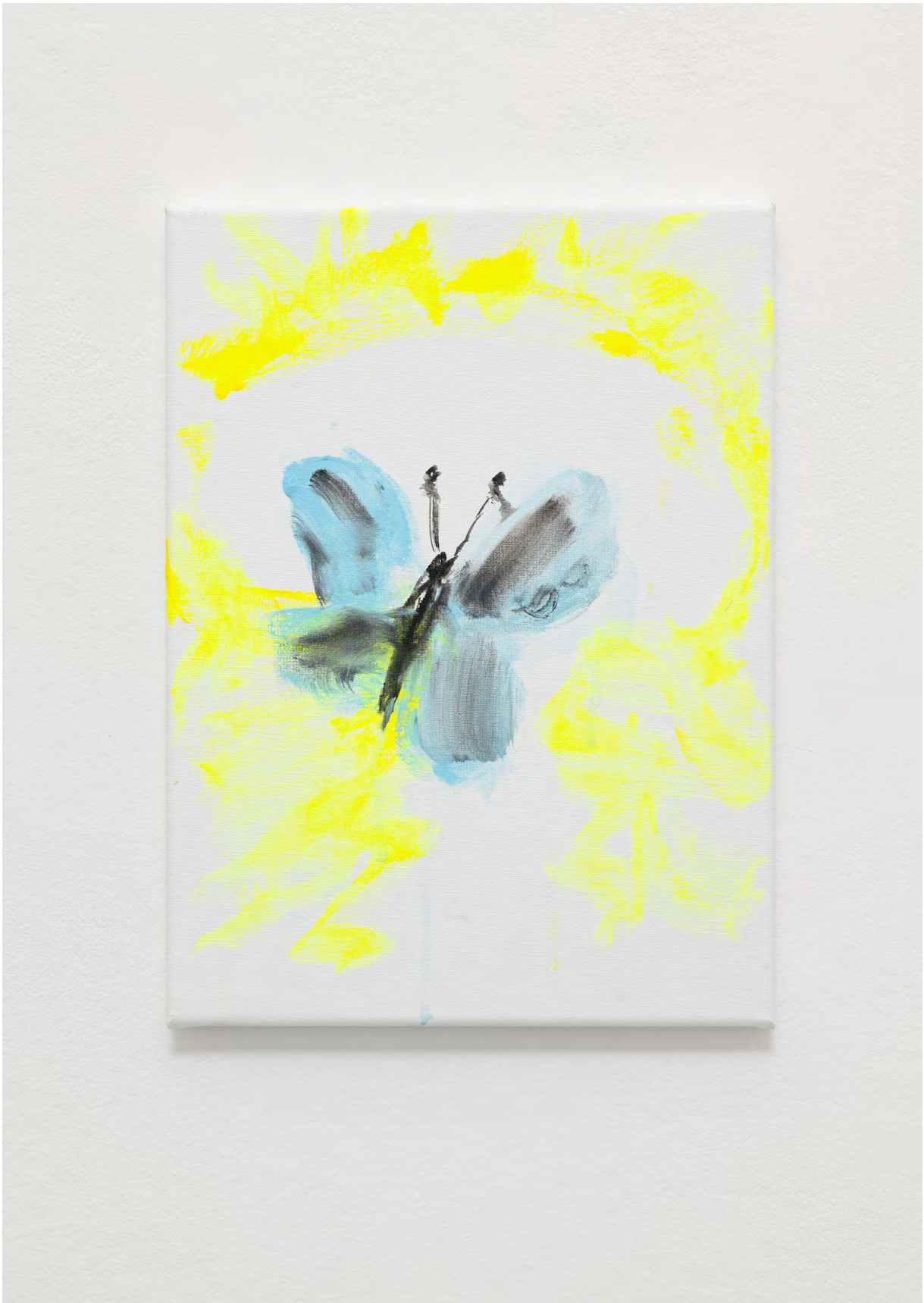
Hans-Jörg Mayer ATOMIC #15 , 2023 Acrylic on canvas 40 x 30 cm