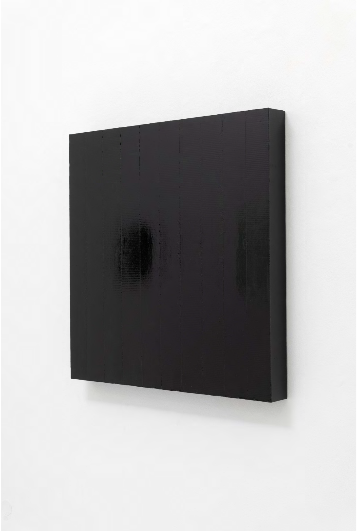
Untitled, 2021, detail