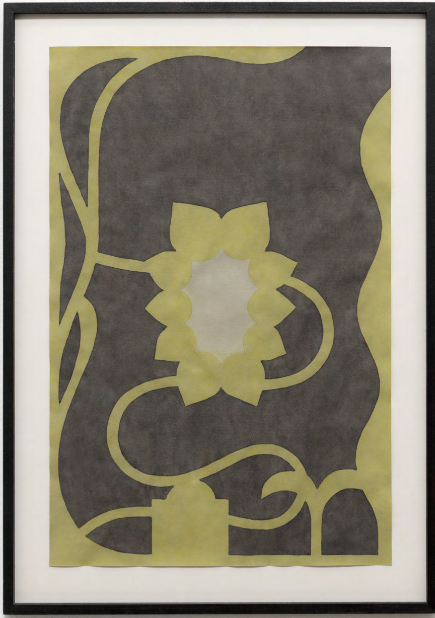
Berthold Reiß Wüste , 2024 Watercolor on paper 31 x 47 cm, 55,2 x 39,3 cm (framed)