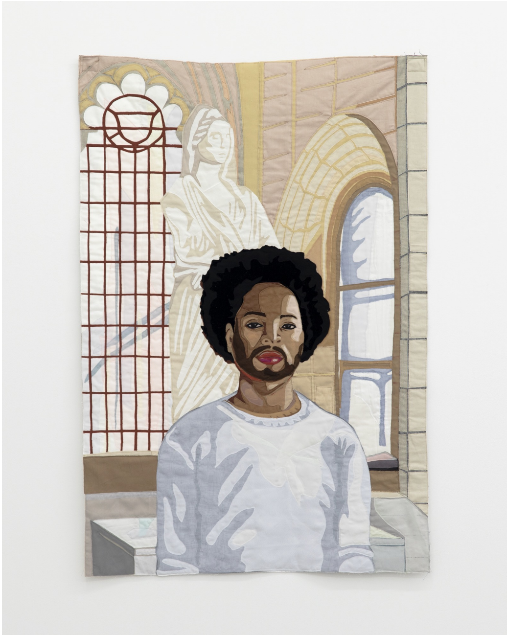
Hangama Amiri Portrait of Kern Samuel at Yale Art Gallery, 2024 Muslin, cotton, chiffon, silk, linen, and velvet 52 x 34.5 in (132.1 x 87.6 cm) H.A0073