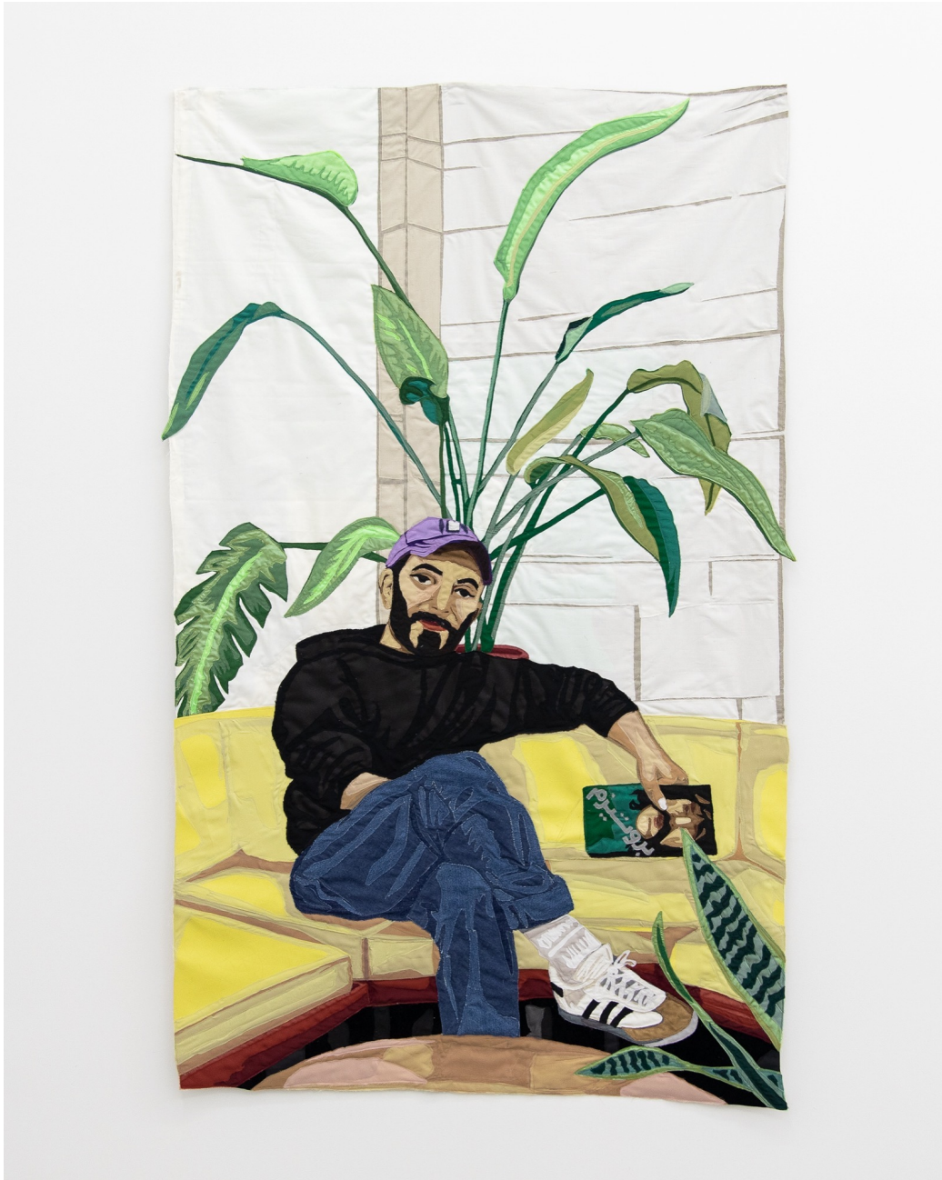
Hangama Amiri Muheb Esmat, 2024 Muslin, cotton, linen, chiffon, denim, silk, velvet, leather, suede, and ikat-print on chiffon 73.5 x 44.5 in (186.7 x 113 cm) H.A0070