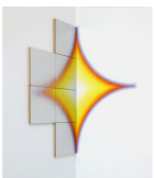
Lisa Beck Flare , 2012 Acrylic paint on wall, mylar on panels 48 1/2 x 50 3/4 inches 123.2 x 128.9 cm (EDG8022)