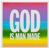
John Giorno GOD IS MANMADE , 2016 Acrylic on canvas 56 x 56 inches 142.2 x 142.2 cm (EDG7962)