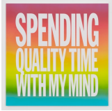
John Giorno SPENDING QUALITY TIME WITH MY MIND , 2016 Acrylic on canvas 56 x 56 inches 142.2 x 142.2 cm (EDG7960)