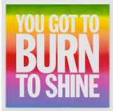
John Giorno YOU GOT TO BURN TO SHINE , 2016 Acrylic on canvas 56 x 56 inches 142.2 x 142.2 cm (EDG7961)