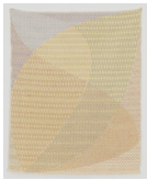
Mark Barrow YMCK14 , 2015 Textile by Sarah Parke Acrylic on Hand-Loomed Fabric 50 1/2 x 40 1/2 inches 128.3 x 102.9 cm (EDG7547)