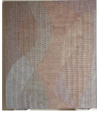
Mark Barrow YMC8 , 2015 Textile by Sarah Parke Acrylic on Hand-Loomed Linen 48 x 41 inches 121.9 x 104.1 cm (EDG7679)