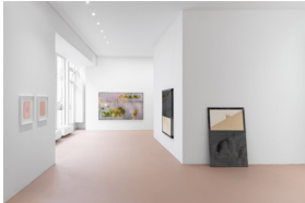
Installation view symbiotic beings , 2024

Courtesy of max goelitz Copyright of the artist Photo: Dirk Tacke