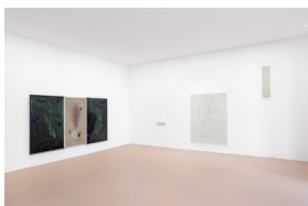
Installation view symbiotic beings , 2024

Courtesy of max goelitz Copyright of the artists Photo: Dirk Tacke