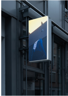
Justin Urbach FIBER NERVE , 2024 Lightbox display, 35mm format, C-print Dimensions variable

Please note the following photo credits and courtesies: