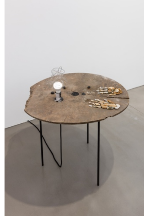
Anne Hardy Energy Locator , 2023–24 found materials, stones, welded steel, light, custom- designed computer system for light source that responds to Marfa meteorological data 99 × 81 cm © Anne Hardy, courtesy Maureen Paley, London Photo: Angus Mill