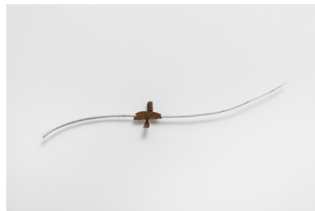
Anne Hardy Lure (wand) , 2023–24 found materials, rusted metal, cast and polished pewter 15 × 70 × 15 cm – 5 7/8 × 27 1/2 × 5 7/8 in © Anne Hardy, courtesy Maureen Paley, London Photo: Angus Mill