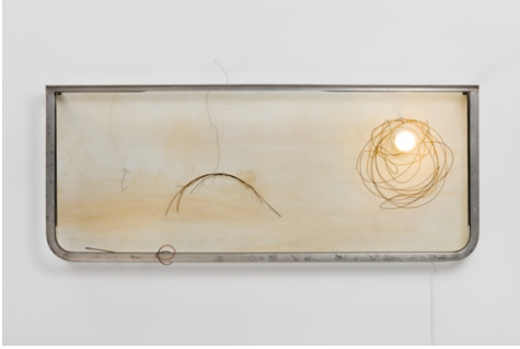
Anne Hardy Solar Tank , 2023–24 found materials, aluminium, glass, paint, rusted wire, rust, light, steel, copper 60 × 140 × 18 cm © Anne Hardy, courtesy Maureen Paley, London Photo: Angus Mill