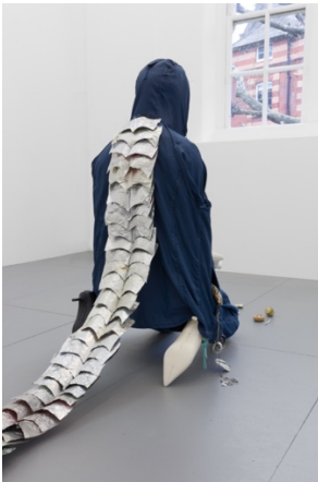
Being (Interloper) , detail, 2022–24 artist's clothes, tin cans crushed by trucks outside the studio, welded steel, cast pewter, cast jesmonite, jewellery, earth, wood, wire 115 × 55 × 360 cm © Anne Hardy