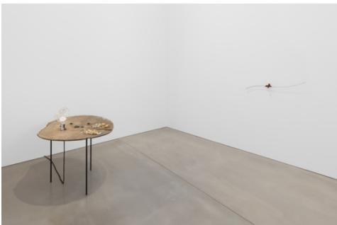
Anne Hardy Survival Spell exhibition view: Maureen Paley, London, 2024