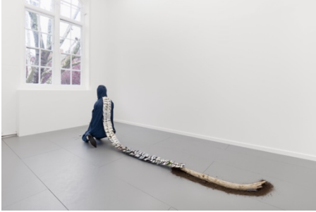
Being (Interloper) , 2022–24 artist's clothes, tin cans crushed by trucks outside the studio, welded steel, cast pewter, cast jesmonite, jewellery, earth, wood, wire 115 × 55 × 360 cm © Anne Hardy, courtesy Maureen Paley, London Photo: Angus Mill