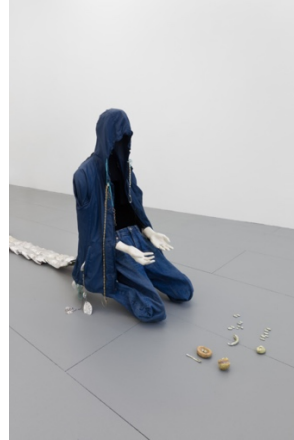
Being (Interloper) , detail, 2022–24 artist's clothes, tin cans crushed by trucks outside the studio, welded steel, cast pewter, cast jesmonite, jewellery, earth, wood, wire 115 × 55 × 360 cm © Anne Hardy, courtesy Maureen Paley, London Photo: Angus Mill