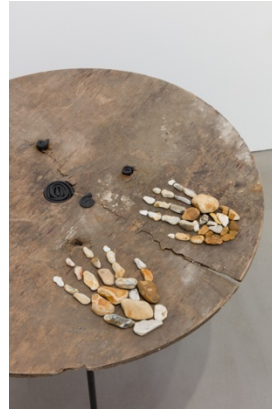
Anne Hardy Energy Locator , detail, 2023–24 found materials, stones, welded steel, light, custom- designed computer system for light source that responds to Marfa meteorological data 99 × 81 cm