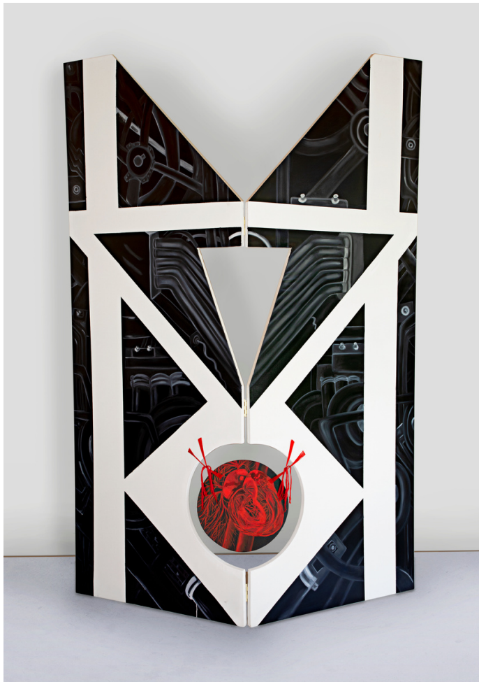
1. Frieda Toranzo Jaeger, A code that copies itself , 2020.