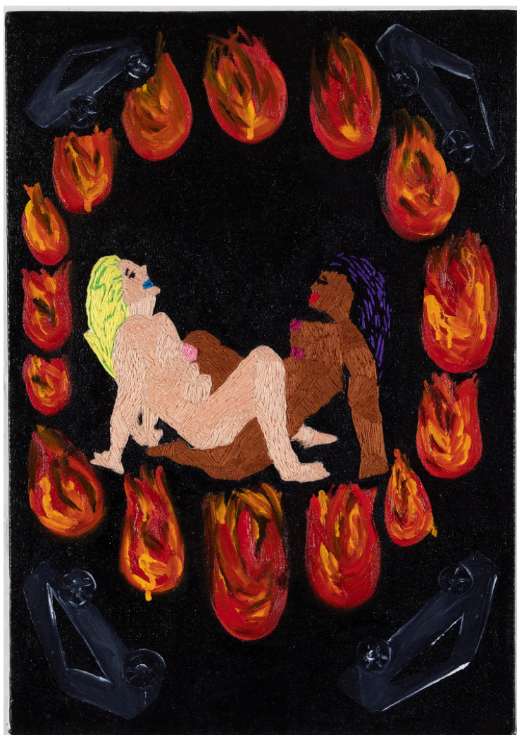
3. Frieda Toranzo Jaeger, The Beginning of the End , 2020.