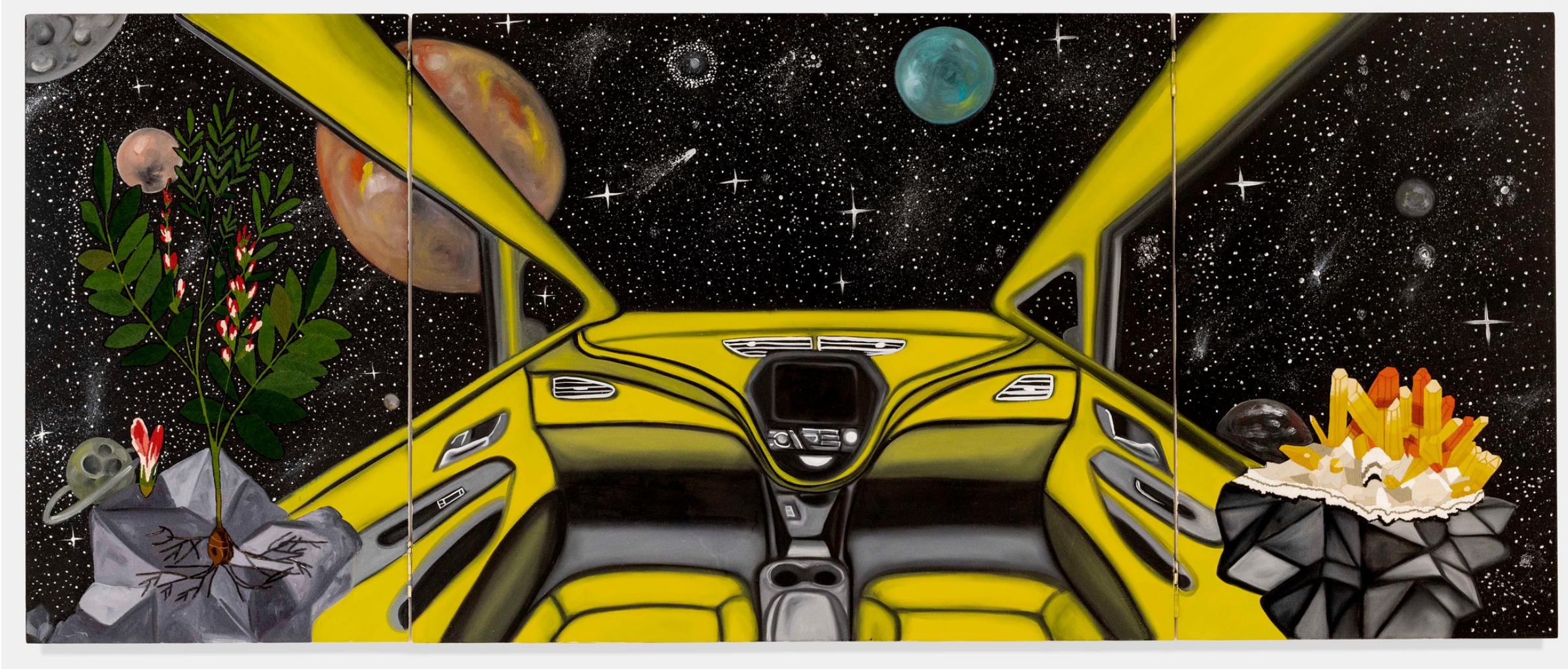
7. Frieda Toranzo Jaeger, If the future is full of death, the past is the only alternative source of inspiration to the traditions and memories of a zombified world , 2023.