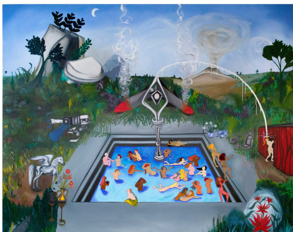
5. Frieda Toranzo Jaeger, End of Capitalism, the Fountain , 2022.