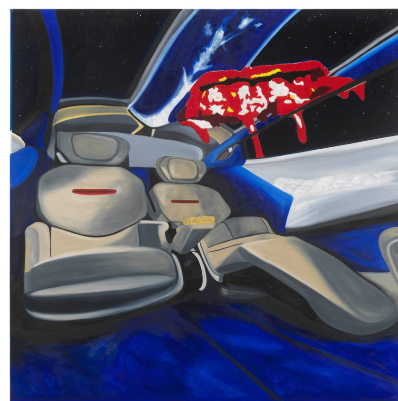
6. Frieda Toranzo Jaeger, Die Wunden sind tiefer im Rolls-Royce , 2019. Private collection.