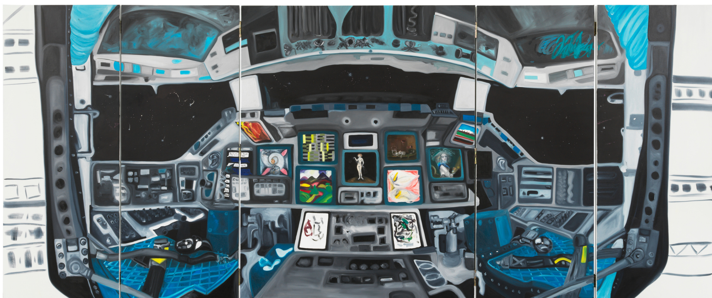
9. Frieda Toranzo Jaeger, Untitled , 2019. Courtesy of Collection Luxoom, Berlin.