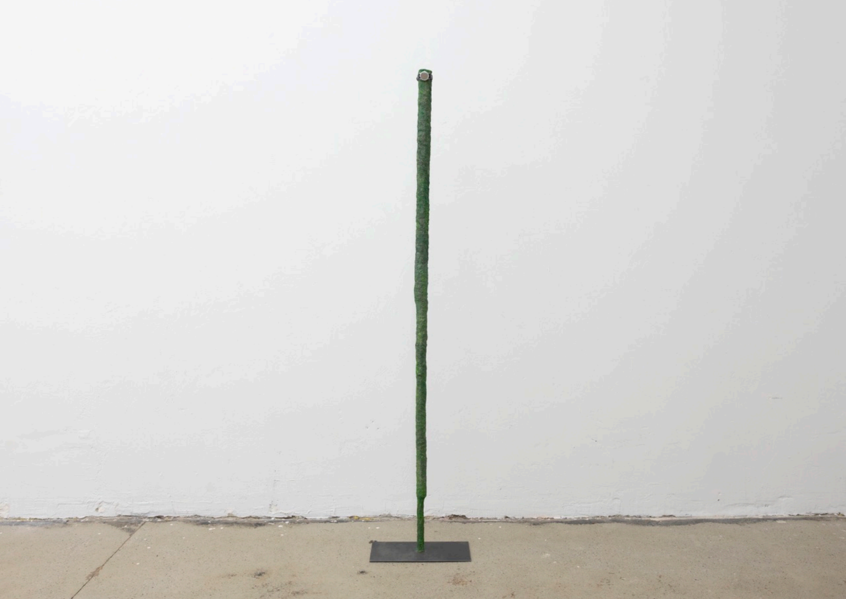
Interrupted Plans, 2024 Wood, steel, cellulose, acrylic paint, watch, soil, glue 176 x 36 x 16 cm