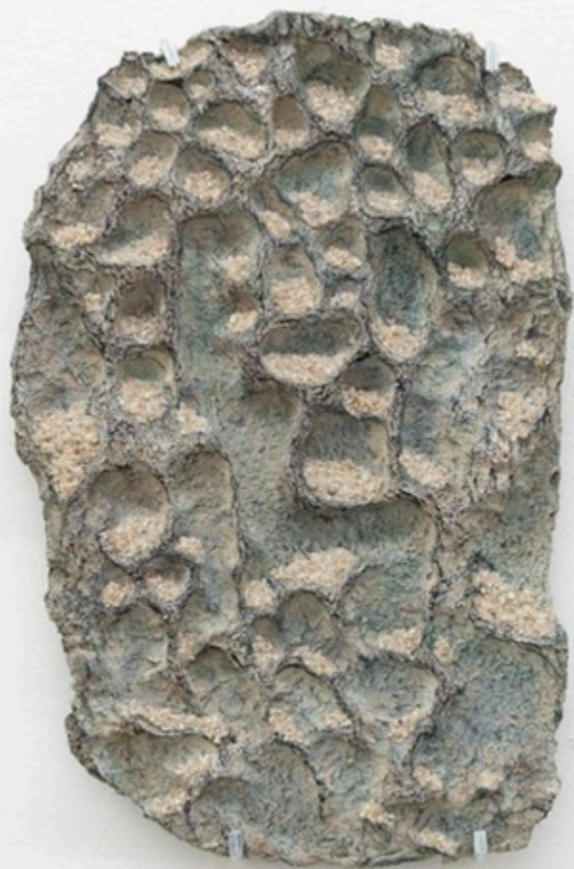
Collection of Small Affairs, 2024 Epoxy cement, pigment, acrylic paint, sand, glue 40 x 27 x 4 cm