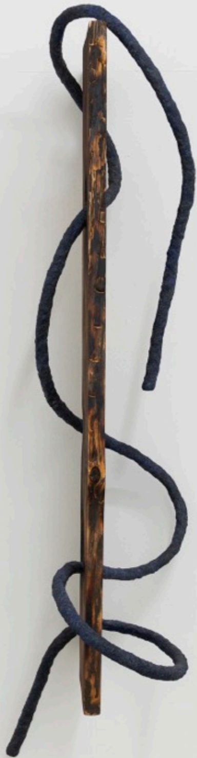
All The Walks Have Lead Me to the Place Where I Stand, 2024 Burned wood, cellulose, acrylic paint, polyethylene, steel, lacquer 153 x 55 x 34 cm