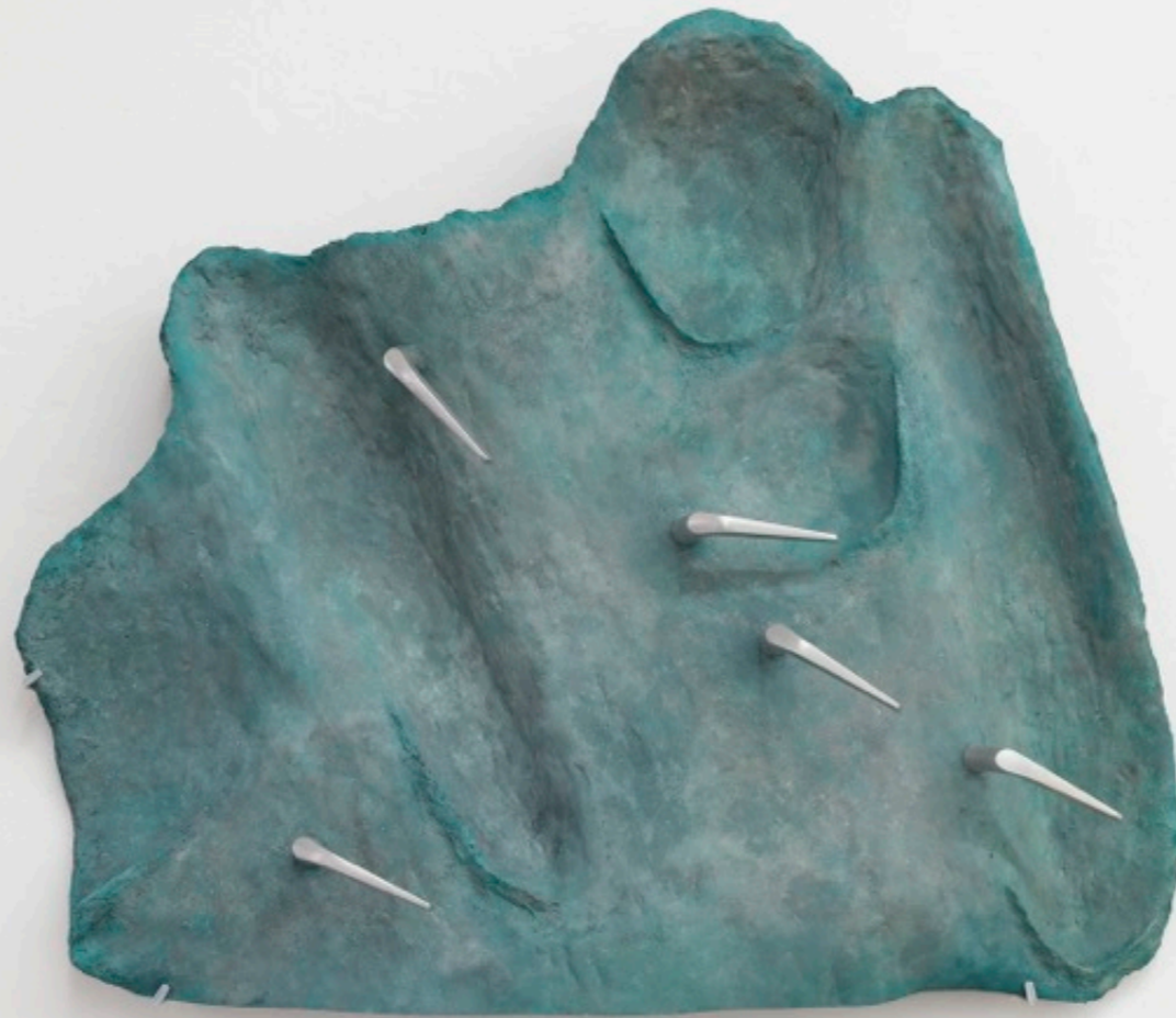
Places I've Been to Are Now Inside Me, 2024 Aluminum handles, acrylic paint, resin, fiberglass, cellulose, adhesive, steel 87 x 71 x 14 cm