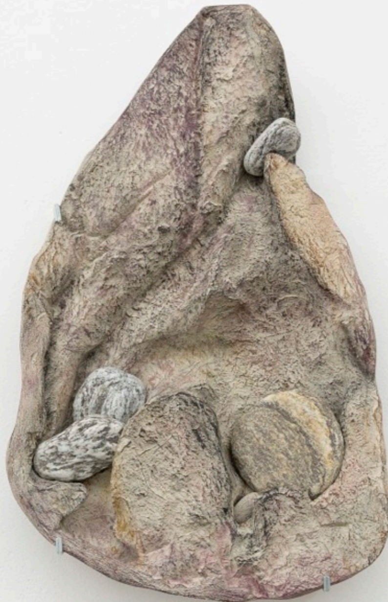
Sitting in a Stream, 2024 Epoxy cement, pigment, acrylic paint, sand, glue 58 x 38 x 8 cm