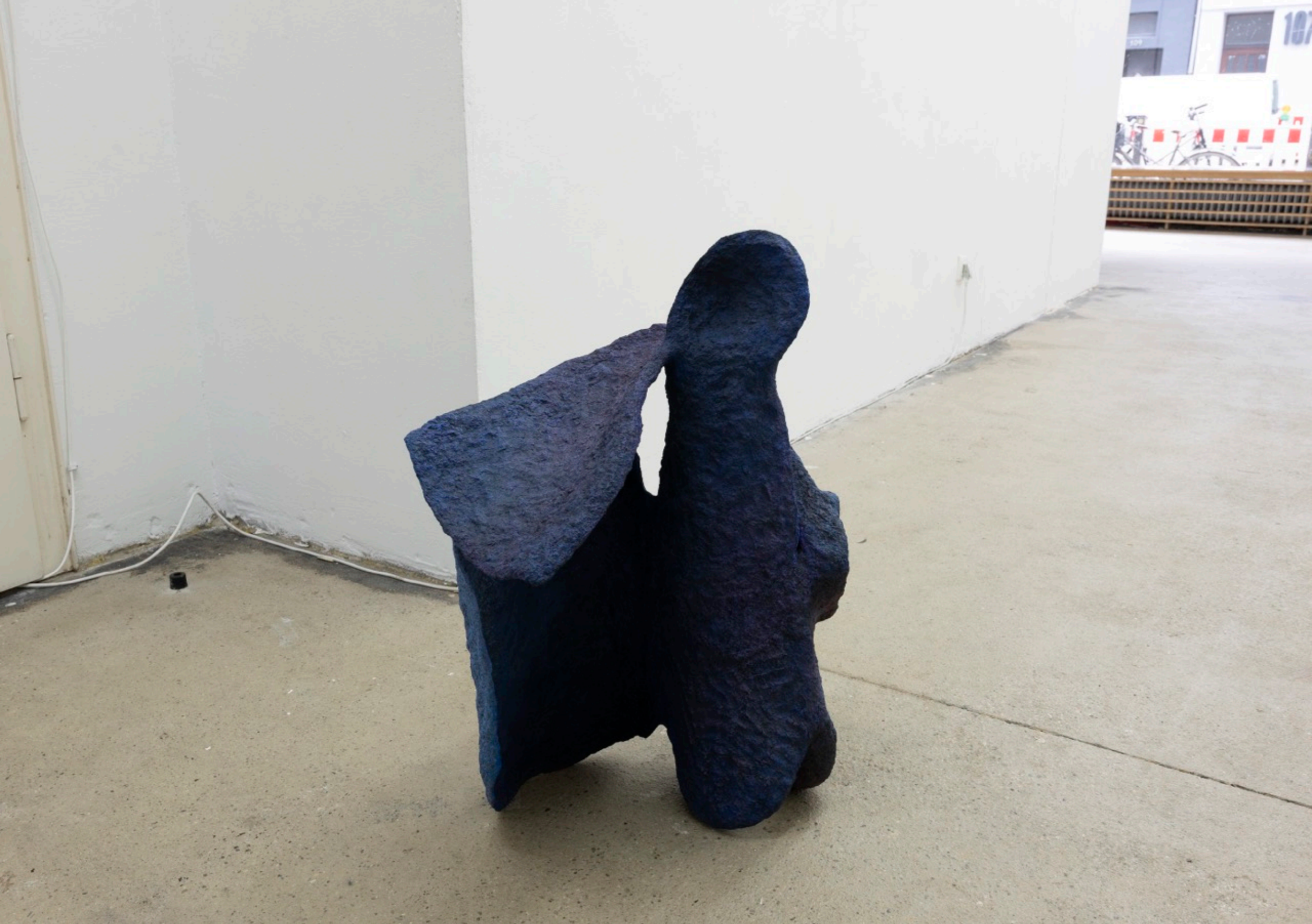
The Corner of Views, 2024 Celulose, steel, glue, acrylic paint 70 x 60 x 50 cm