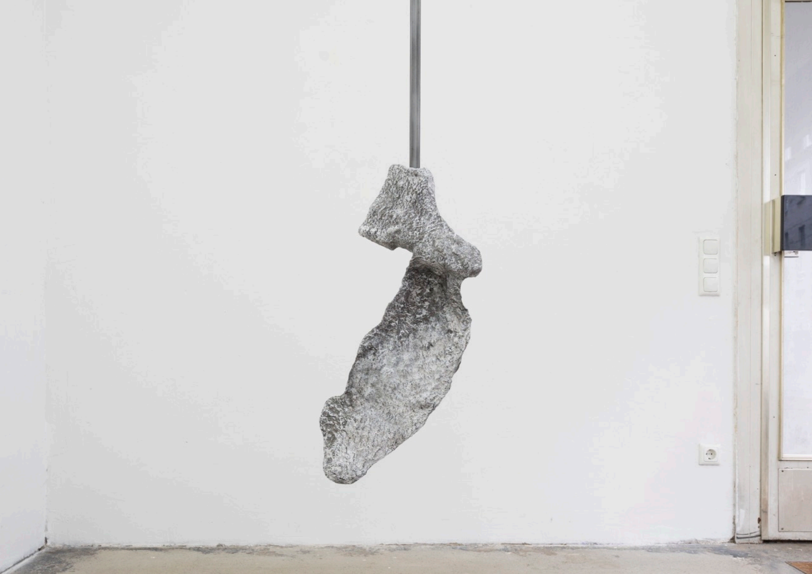
Distant Outline of a Person, 2024 Celulose, acrylic paint, glue, shoe, wood, steel 266 x 30 x 10 cm