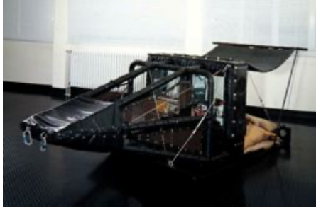
The Big Screwed Up, 1989

Wood, nylon, glass, rubber, anodized aluminum, jute, sand and journals