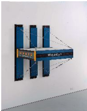
Me Portrait No. 1 (Wildcat), 1987

After the exhibition maybe transport to London