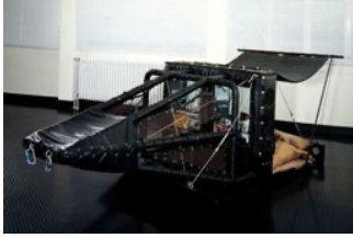
The Big Screwed Up, 1989 Wood, nylon, glass, rubber, anodized aluminum, jute, sand and journals 132 x 428 x 110 cm

Ashley Bickerton Susie April 3rd – May 12th 2013