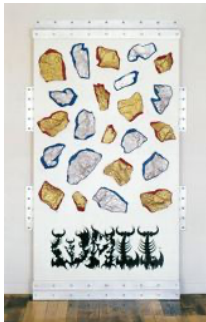
Wall Wall 7, 1986 Gold plus silver lacquer paint, acrylic, hydrocal, aluminium, Formica on wood 231 x 134,6 x 14 cm