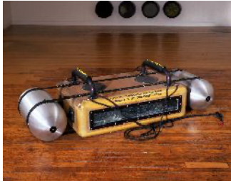
Seascape: Transporter for the Waste Product of its own Construction #1, 1989 Wood, aluminum, steel, glass, fiberglass, plastic, leather, rope