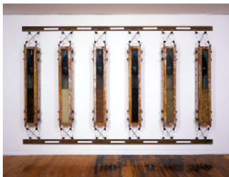
Minimalism's Evil Orthodoxy, Monoculture's Totalitarian Esthetic #2, 1990 chromed steel, wood, glass, rubber, plastic, chromed veneer, soil, rice, coffee, peanuts 243.8 x 396.2 x 31.1 cm