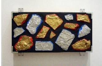
Untitled (Listening to Jujú in High Desert in Sierra, Nevada) [Wall Wall IV], 1985 Bronze paint and polymer on plaster, wood and aluminum 76.8 x 122.6 x 16.2 cm