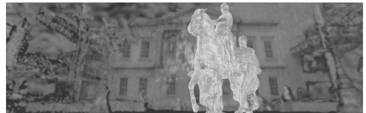
New Red Order: Culture Capture: Crimes Against Reality , 2020. 2-channel video.