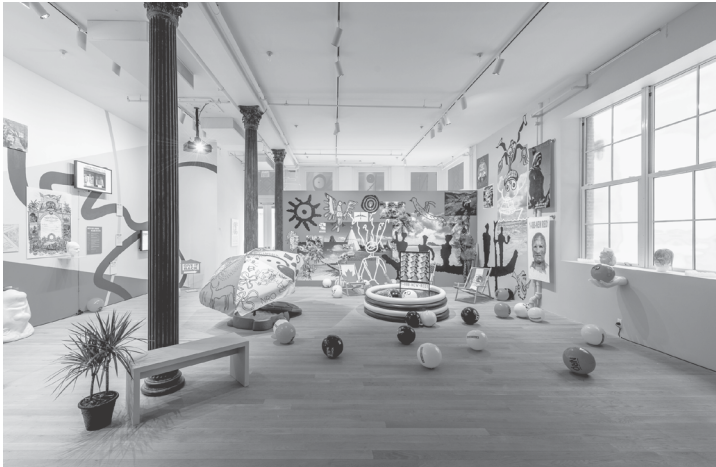
New Red Order: Feel at Home Here . Installation view at Artists Space, New York 2021.