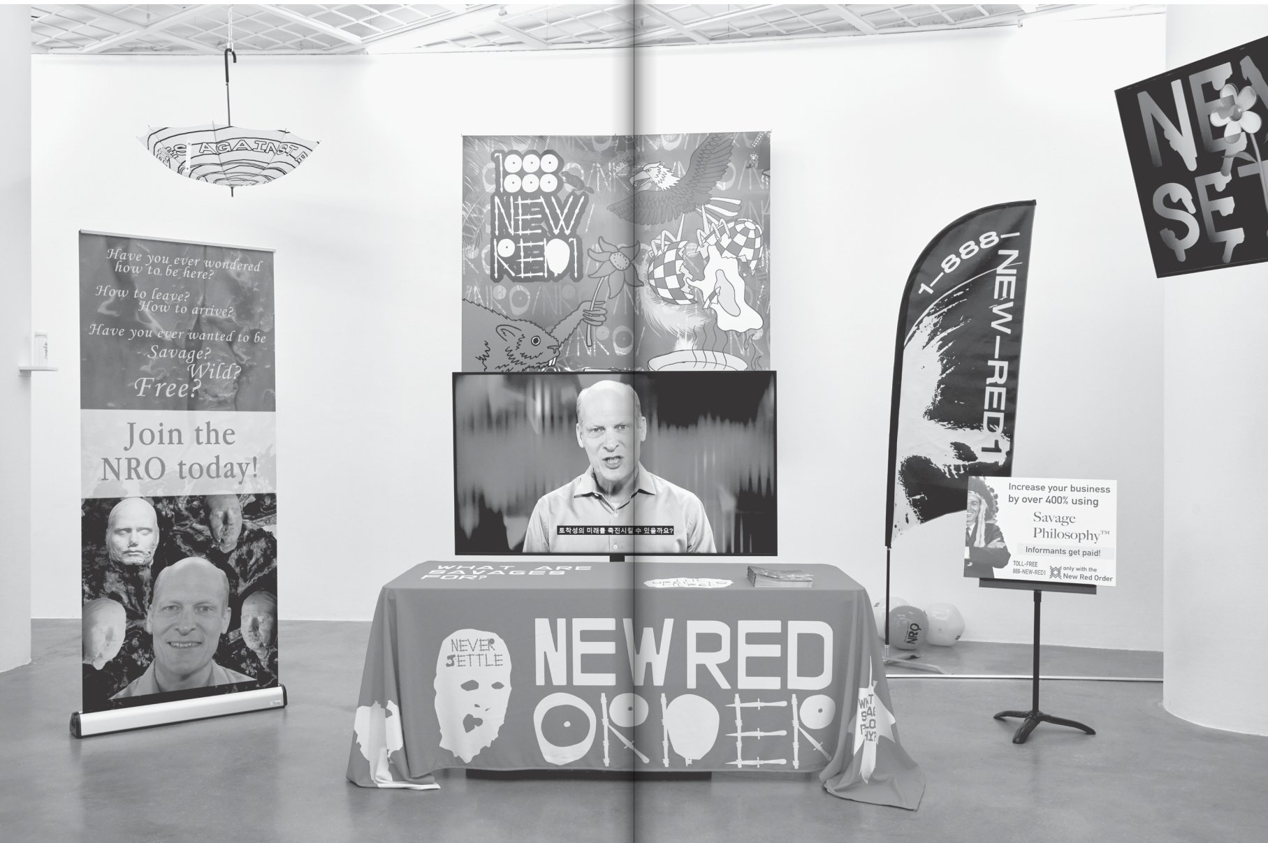
Minimalism-Maximalism-Mechanissmmm Act 3, installation view at Art Sonje Center, Seoul 2022. All rights reserved Art Sonje Center. Photo: Euirock Lee.