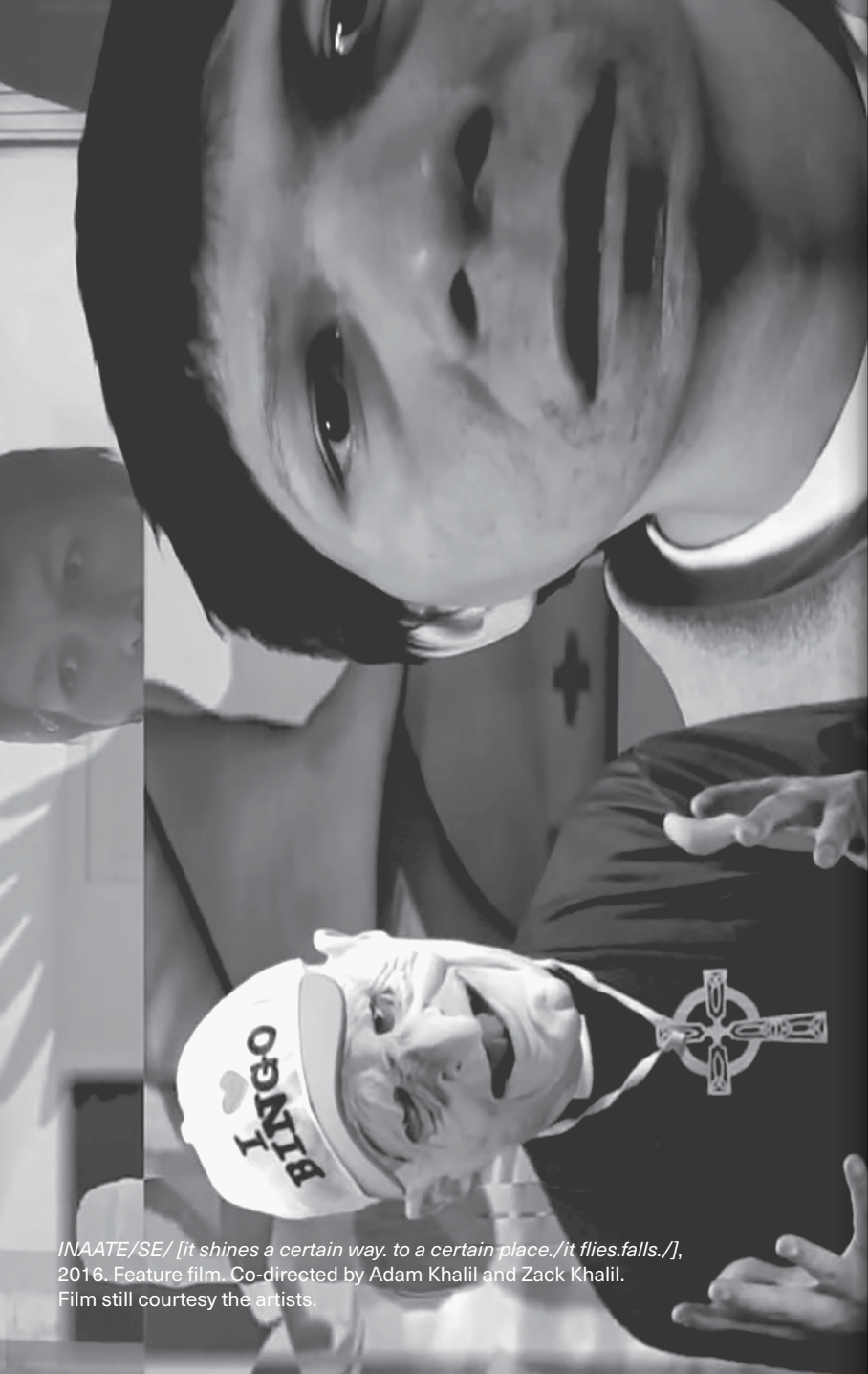
INAATE/SE/ [it shines a certain way. to a certain place./it flies.falls./] , 2016. Feature film. Co-directed by Adam Khalil and Zack Khalil.