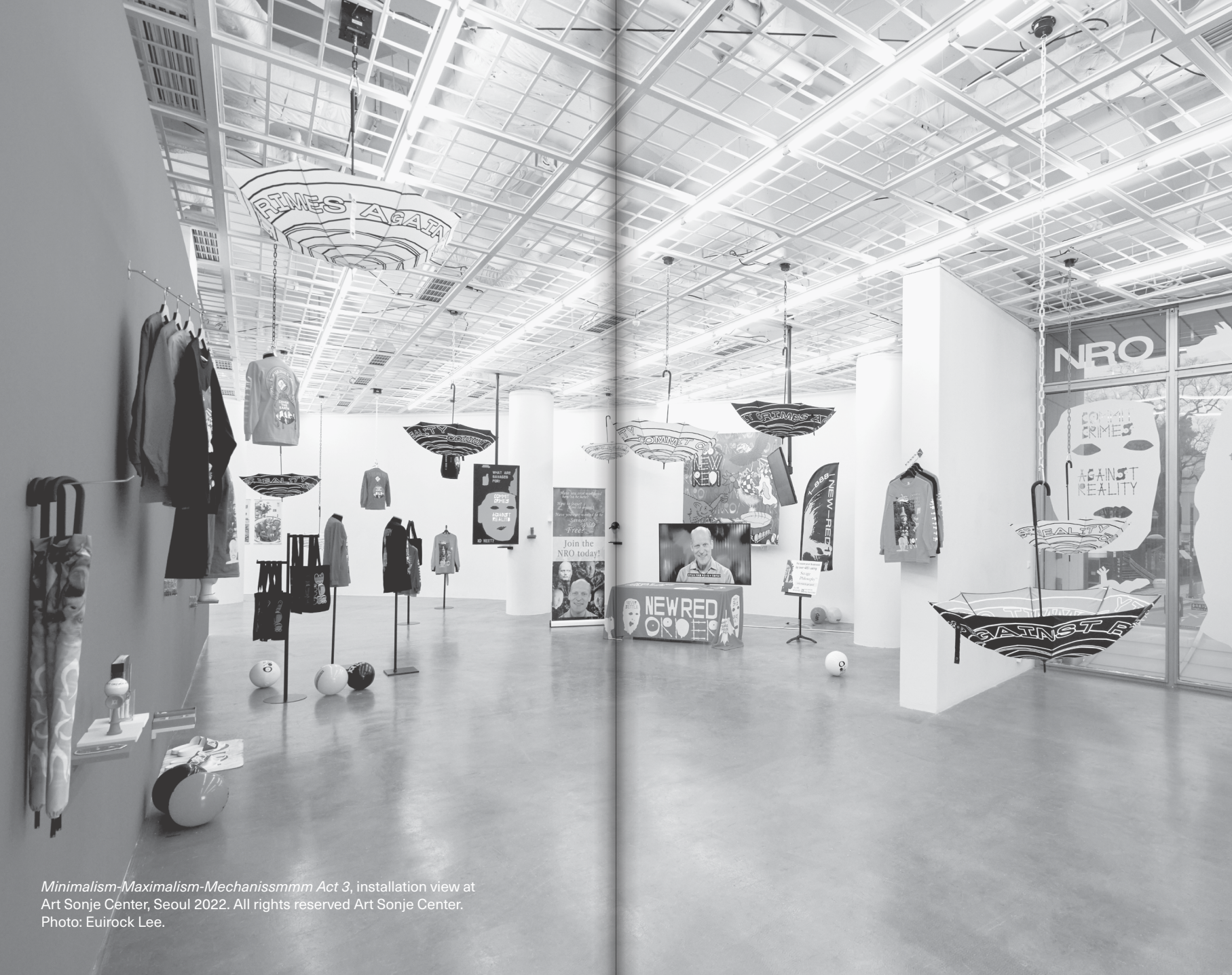
Minimalism-Maximalism-Mechanissmmm Act 3, installation view at Art Sonje Center, Seoul 2022. All rights reserved Art Sonje Center. Photo: Euirock Lee.