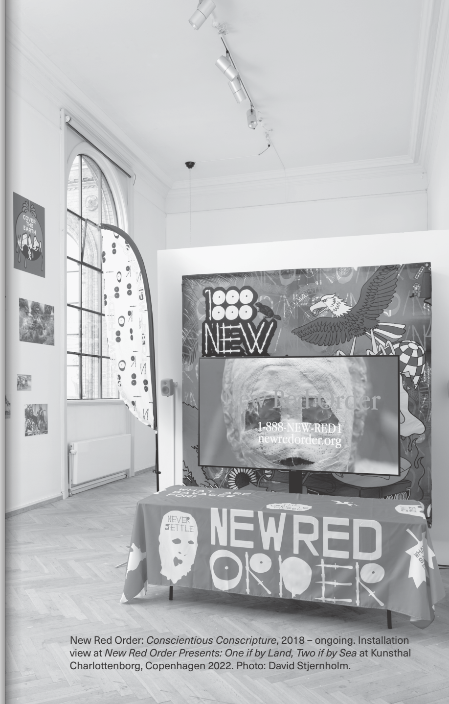
New Red Order: Conscientious Conscripture , 2018 – ongoing. Installation view at New Red Order Presents: One if by Land, Two if by Sea at Kunsthall Charlottenborg, Copenhagen 2022.