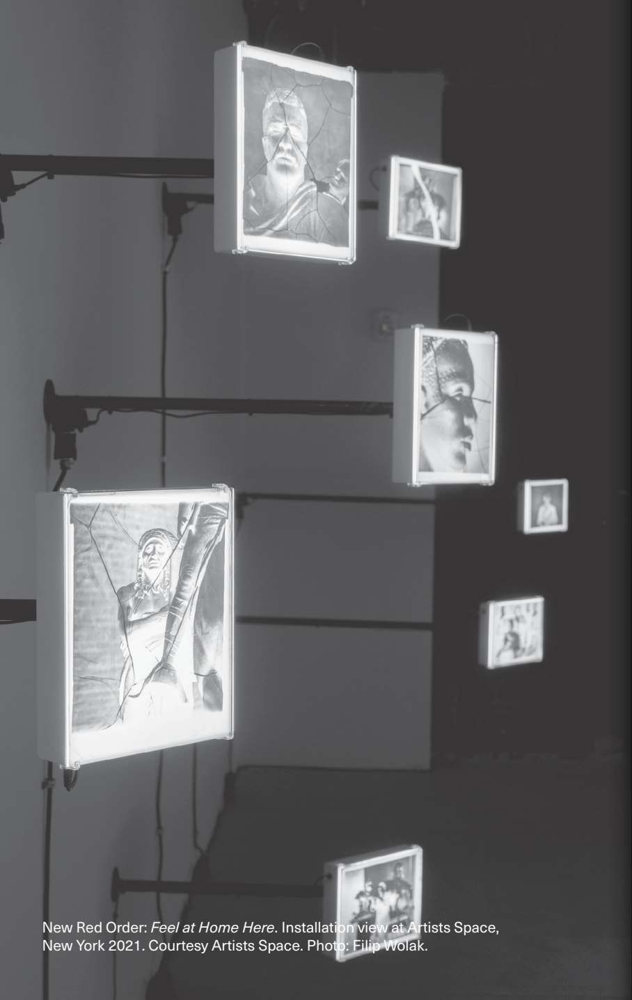
New Red Order: Feel at Home Here . Installation view at Artists Space, New York 2021.