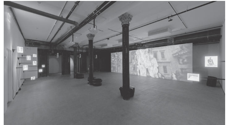
New Red Order: Feel at Home Here . Installation view at Artists Space, New York 2021.