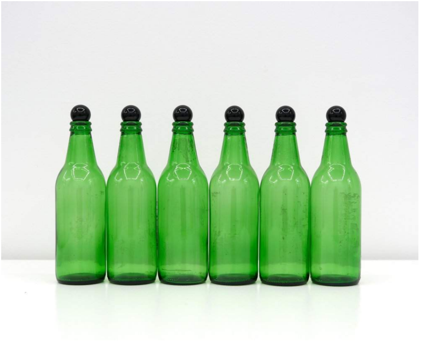
Tony Feher Untitled , 2008 Six green glass bottles, six black glass marbles 8 1/2 x 14 1/2 inches 21.6 x 36.8 cm FEH083