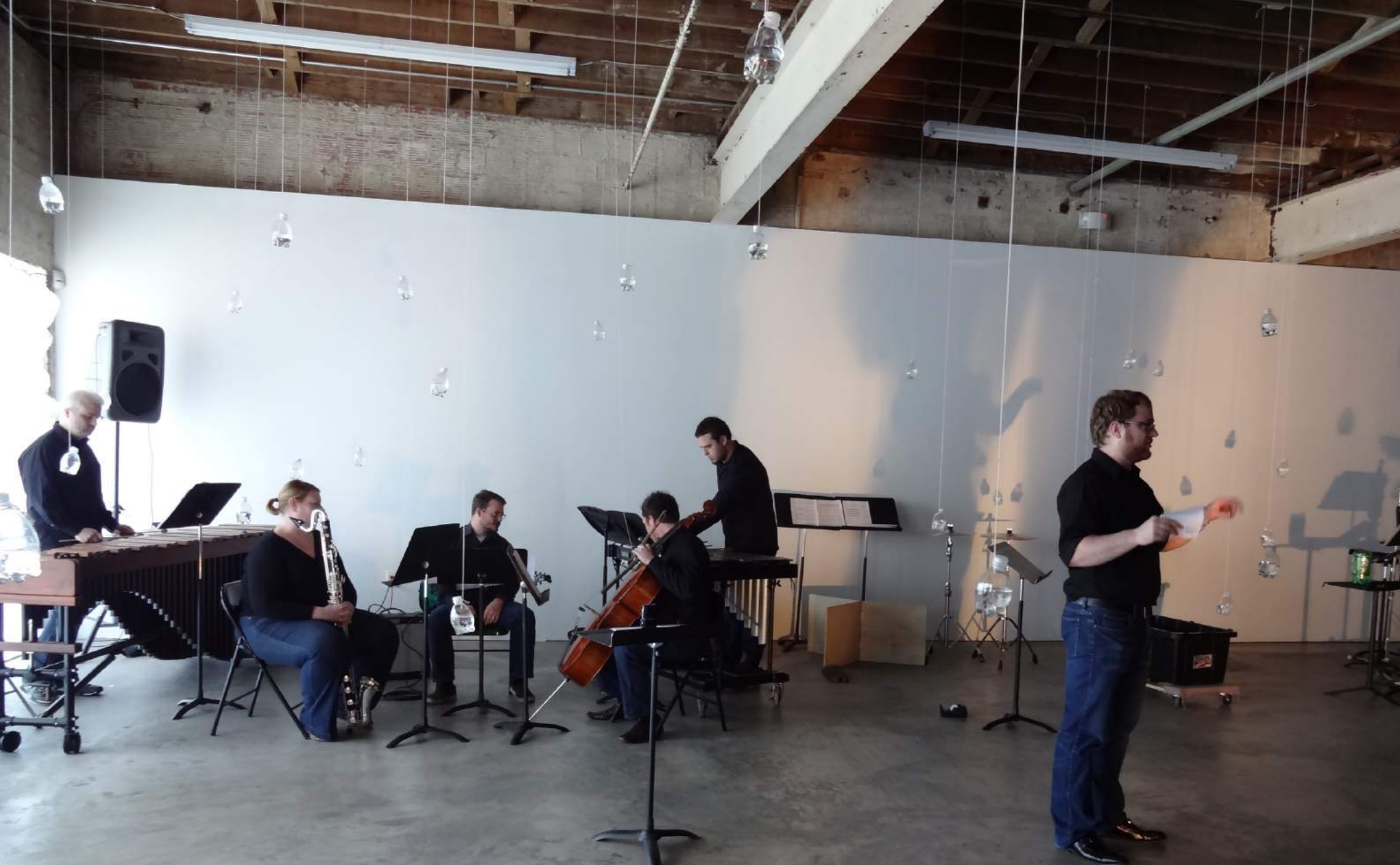
Performance of four original scores for Free Fall by musical composition students from Rice University's Shepherd School of Music and the University of Houston's Moores School of Music. 2 March 2013