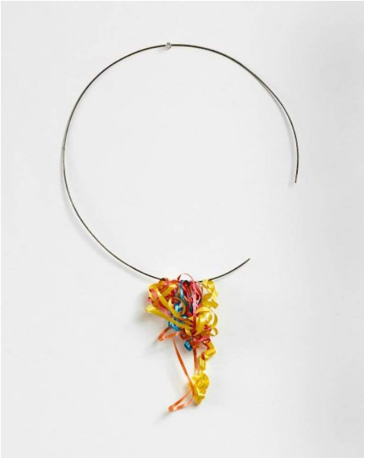
Tony Feher Untitled, 2006 Steel wire, ribbon 23 x 15 1/4 x 2 inches 58.4 x 38.7 x 5.1 cm FEH133