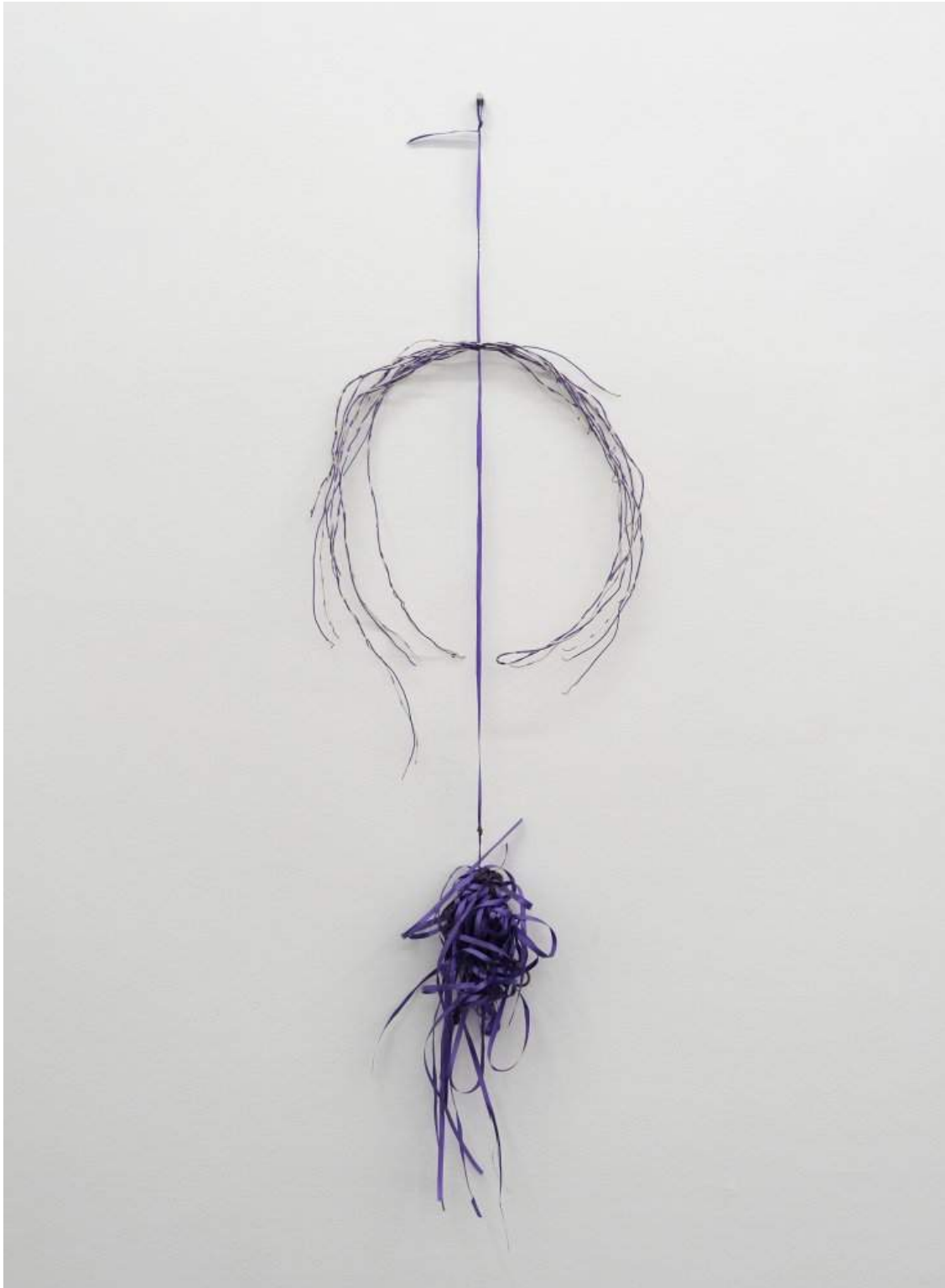
Tony Feher Castaway , 2006 Plastic-coated copper wire, synthetic ribbon 40 x 12 x 3 inches 101.6 x 30.5 x 7.6 cm FEH060