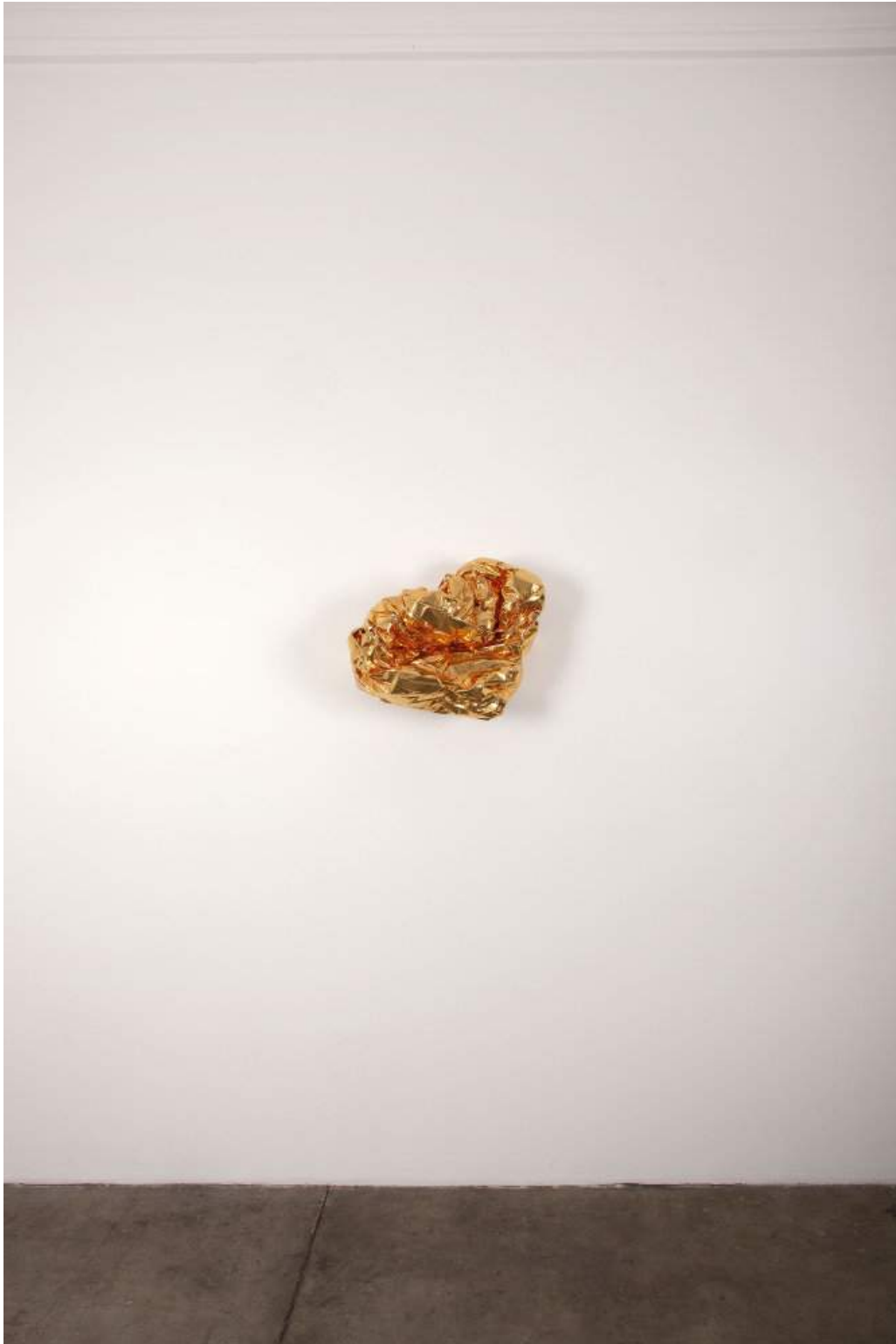
Tony Feher Skidoo , 2014 Mylar, binder clip 16 x 20 x 12 inches 40.6 x 50.8 x 30.5 cm FEH005