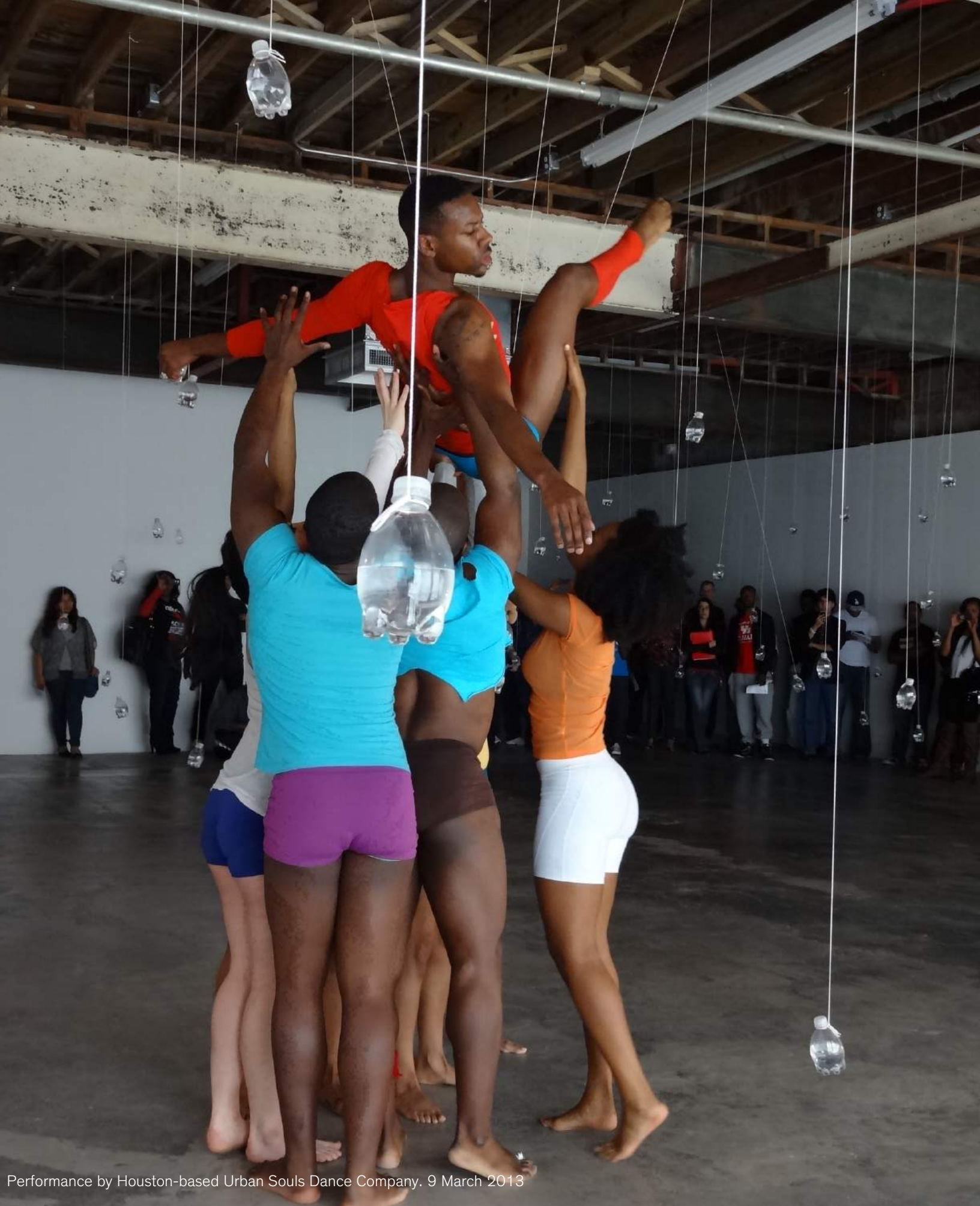
Performance by Houston-based Urban Souls Dance Company. 9 March 2013