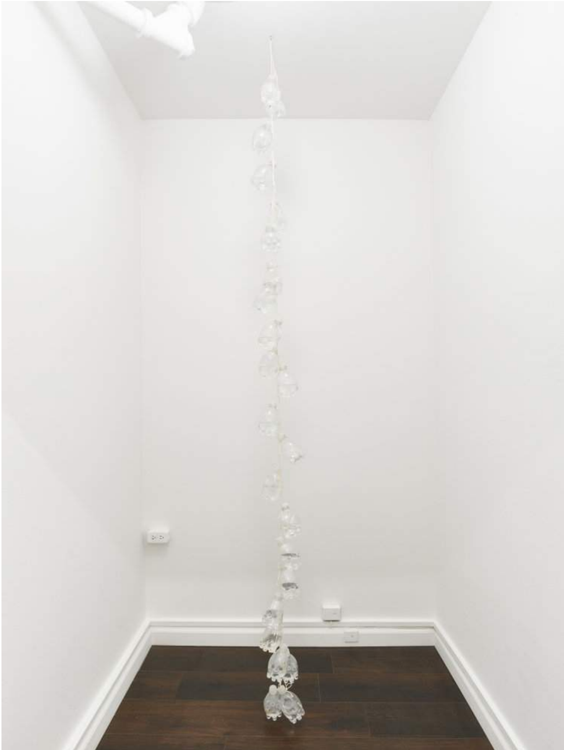
Tony Feher Free Fall , 2013 Plastic water bottles, cotton twine 103 x 8 x 8 inches 261.6 x 20.3 x 20.3 cm FEH095