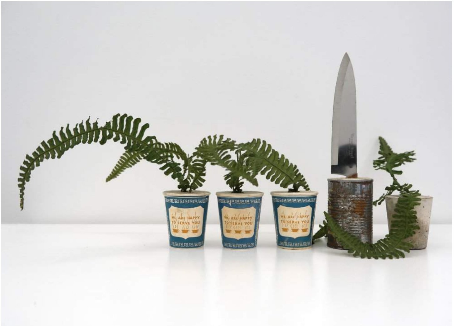
Tony Feher Untitled , circa 1998 Paper coffee cups, cement, artificial ferns, knife 13 x 16 x 2 1/2 inches 33 x 40.6 x 6.3 cm FEH086