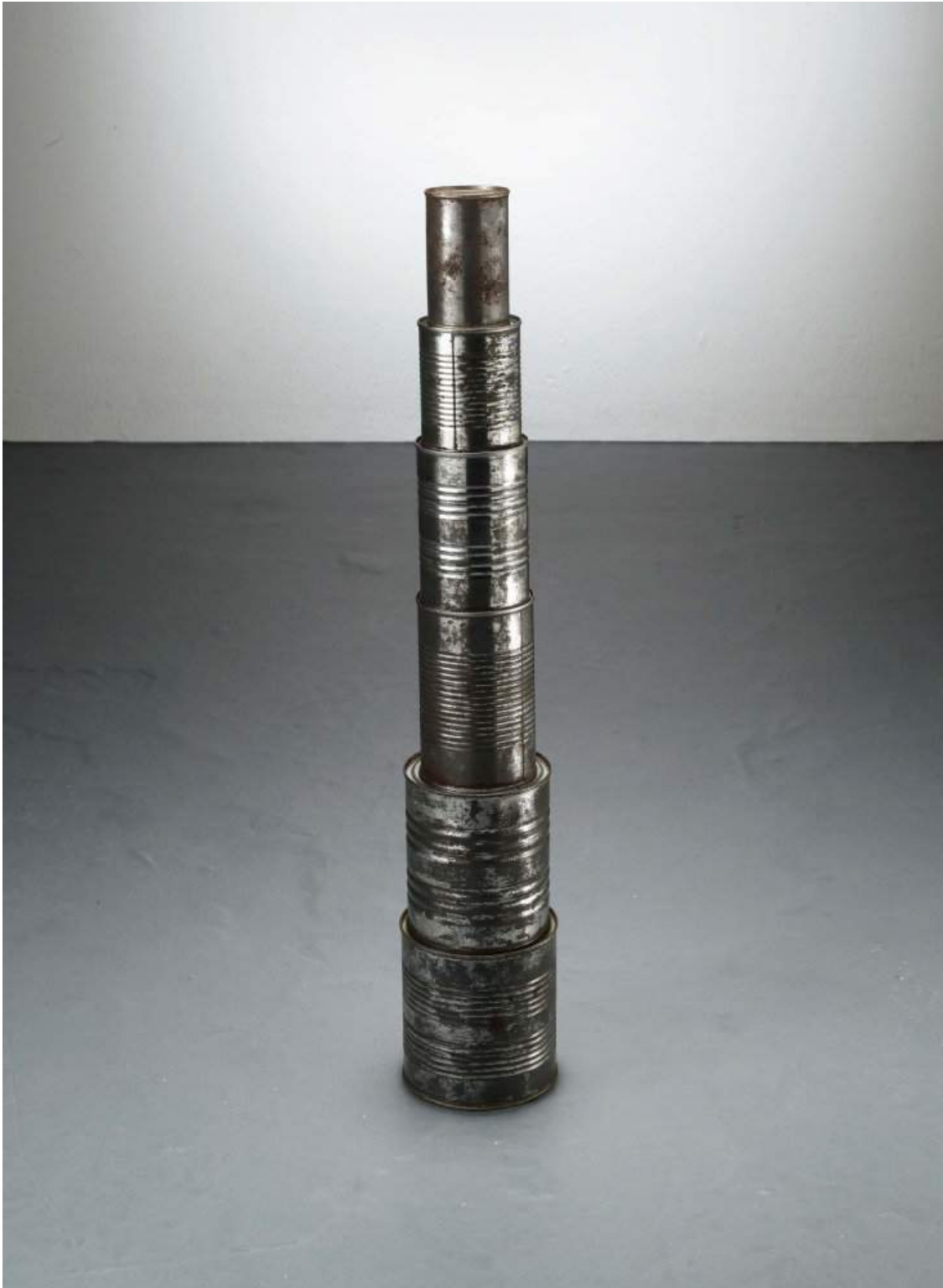
Tony Feher (Rusty) , 2007 Steel cans 24 3/4 x 4 1/2 inches 62.9 x 11.4 cm FEH030