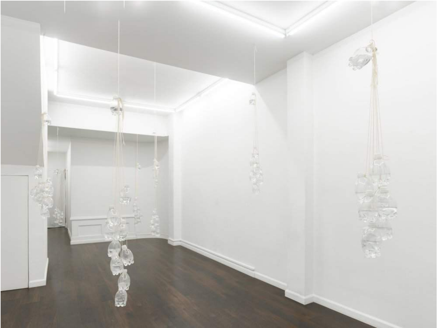
Tony Feher Free Fall , 2013 Eight clusters of plastic water bottles suspended by cotton twine Dimensions variable FEH094