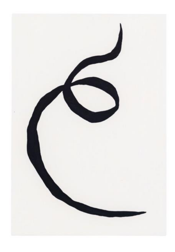
Rauch Studien, RS Knoten, 2024 ink and egg tempera on canvas 50 x 35 cm