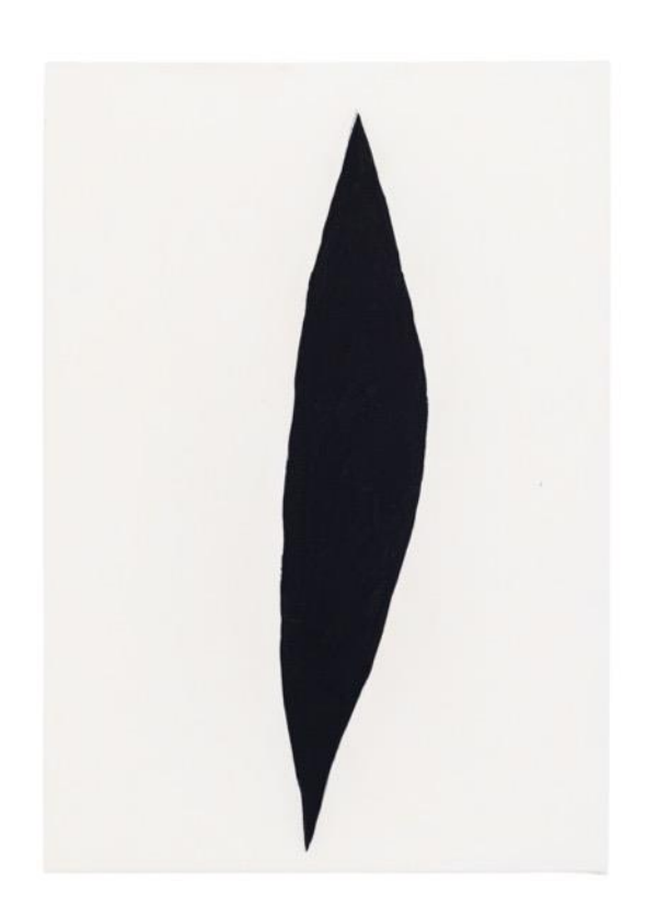
Rauch Studien, RS Madonna, 2024 ink and egg tempera on canvas 50 \times 35 \text{ cm}