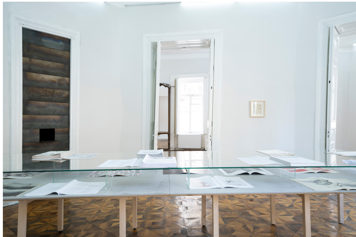
Danarti Archive and More, 2024, E.A. Shared Space, Tbilisi. Installation View.