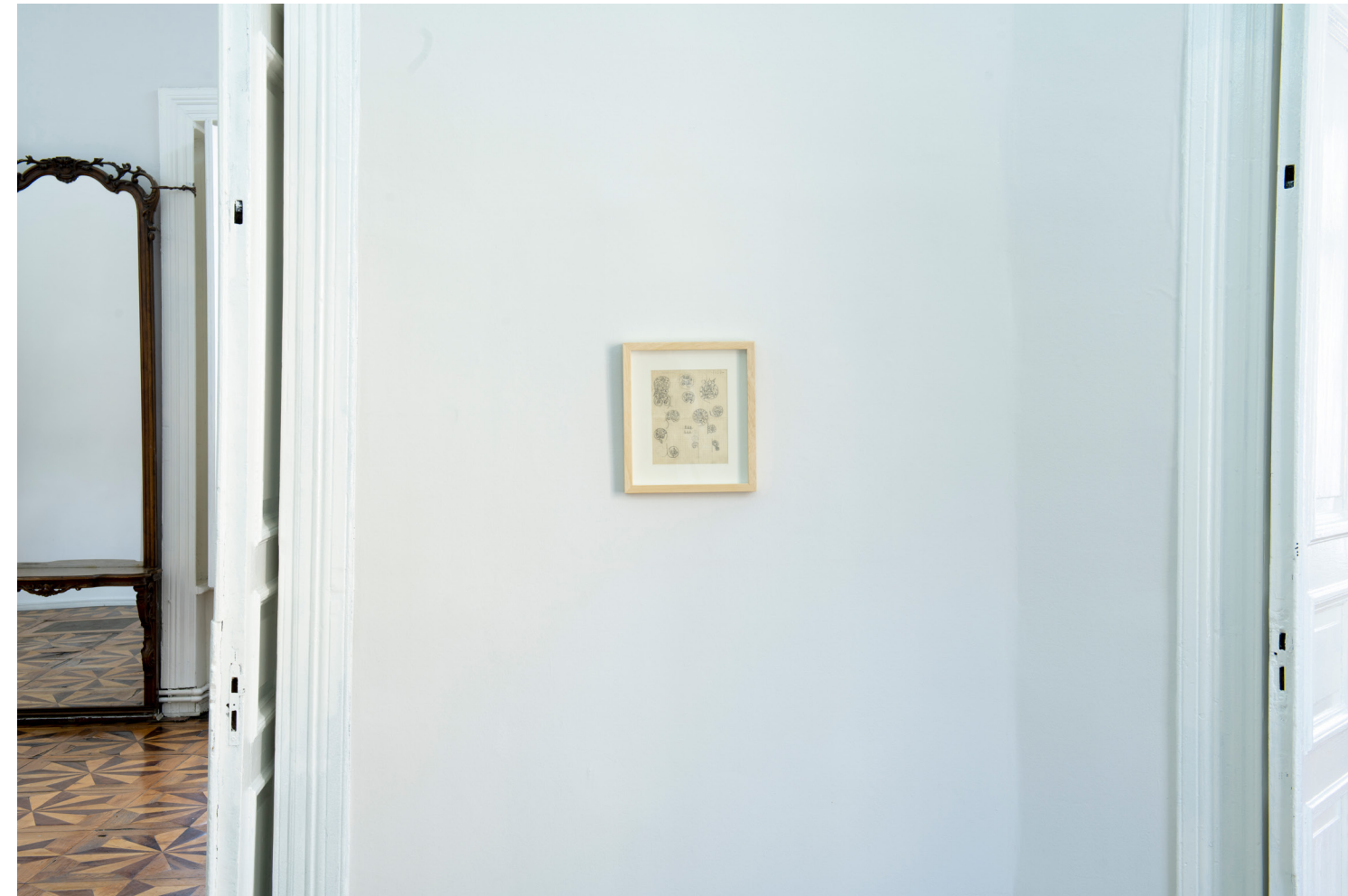
David Kakabadze, Sketch for the project Genesis of Georgian Ornament, Kakhuli Monastery, 1930's, 21 x 30 cm. Courtesy of David Kakabadze Foundation.