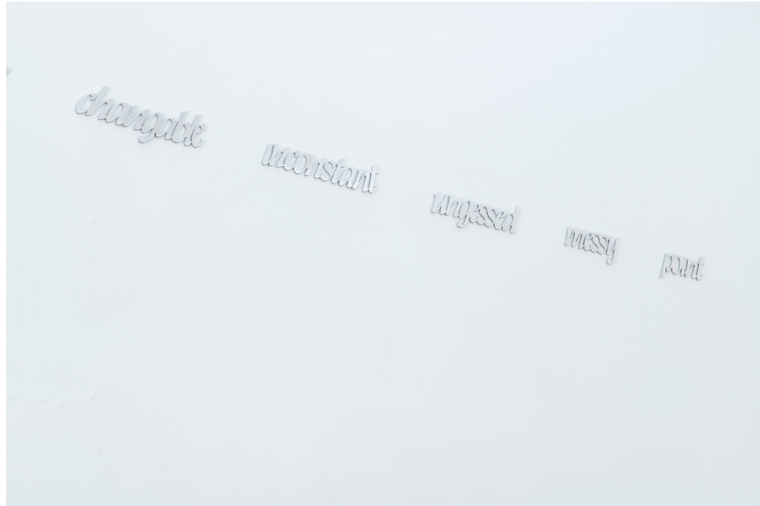
Keti Kapanadze, Feel your inner sensitive ephemeral elusive changeable unconstant unguessed messy point, 1993, aluminium, size varies; Installation Detail.