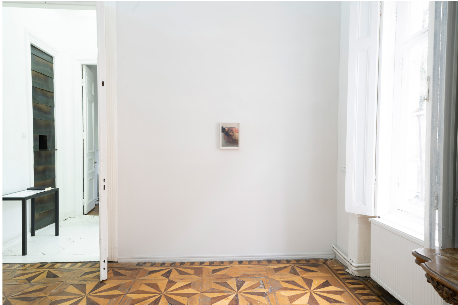
Danarti Archive and More, 2024, E.A. Shared Space, Tbilisi. Installation View.