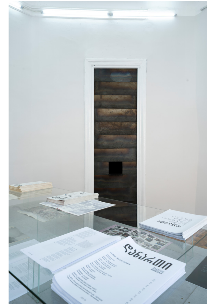
Danarti Archive and More , 2024, E.A. Shared Space, Tbilisi. Installation View.