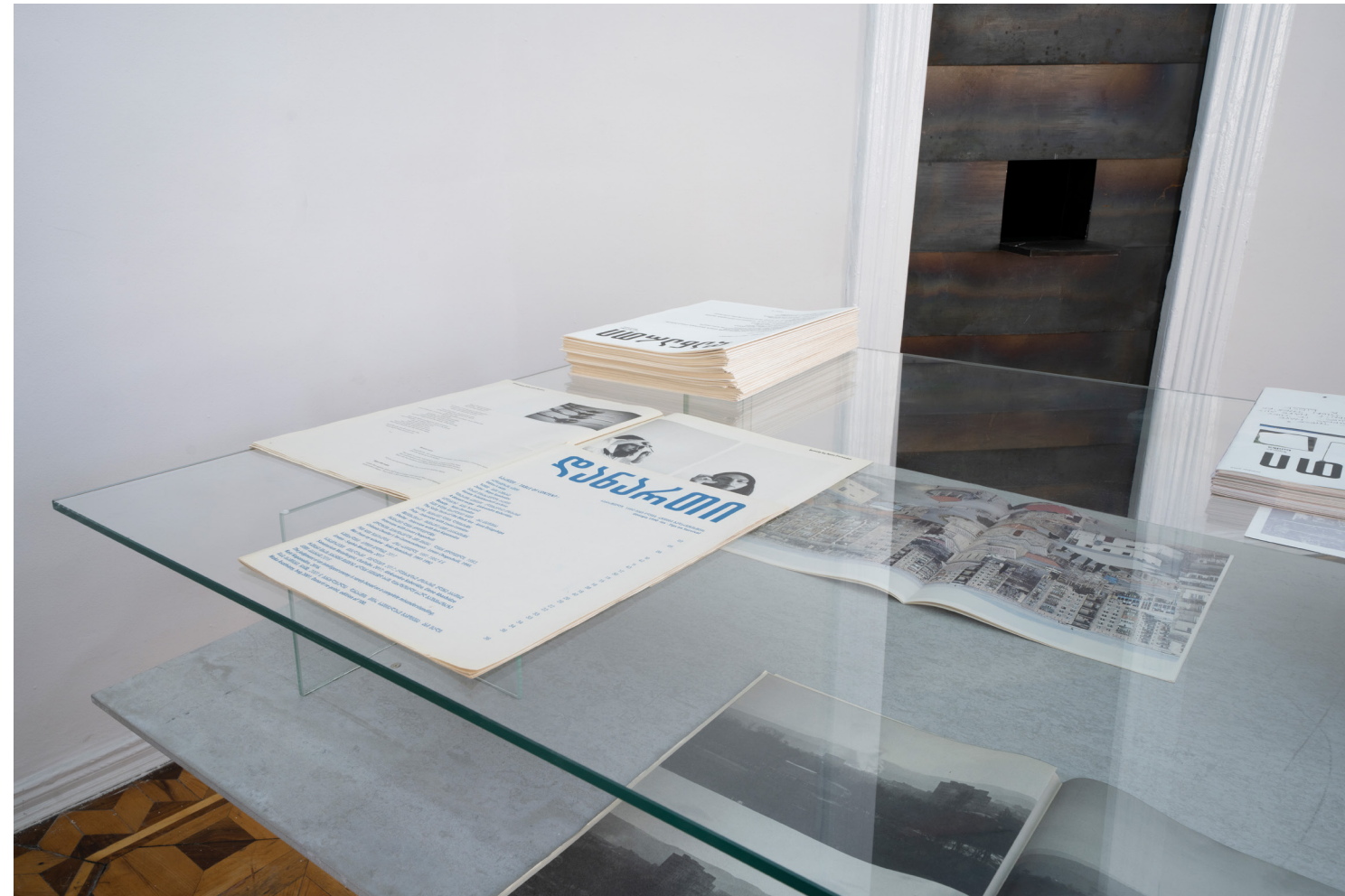
Danarti Archive and More, 2024, E.A. Shared Space, Tbilisi. Installation Detail.