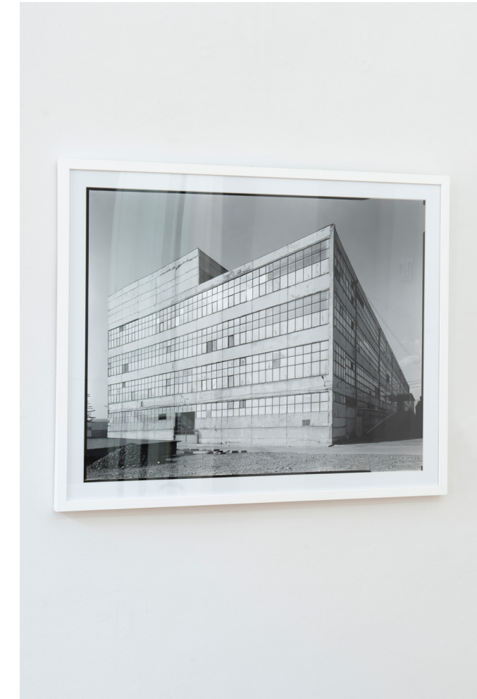
Angus Leadley Brown, Tbilabreshumi, 2021, Digital print on hahnemühle photo rag paper, passpartout, wooden frame, 71 x 87 cm.