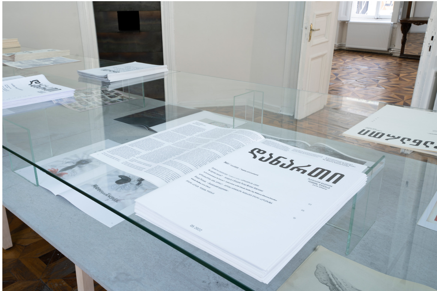
Danarti Archive and More, 2024, E.A. Shared Space, Tbilisi. Installation Detail.