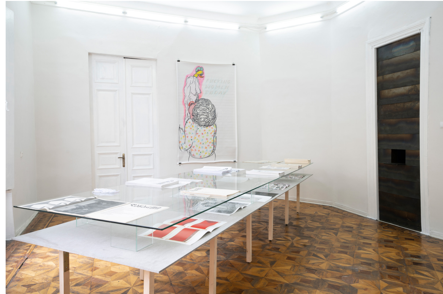
Danarti Archive and More , 2024, E.A. Shared Space, Tbilisi. Installation View.