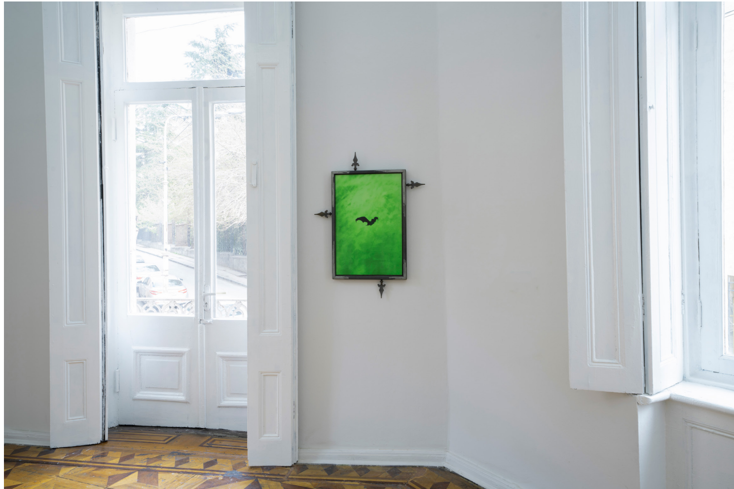
Andro Eradze, Bird of Prey , 2020, digital print, metal fence, metal spikes, 66 x 90 x 4 cm. Installation View; Courtesy of artist and SpazioA Gallery.