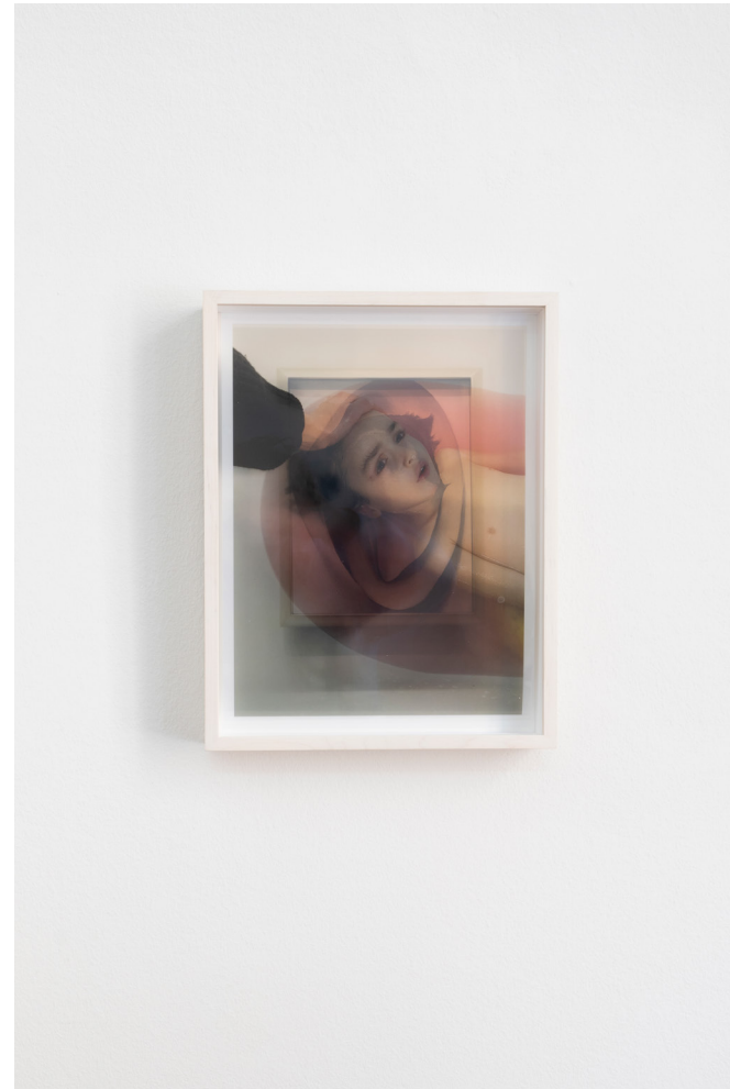
Ketuta Alexi-Meskhishvili, Okeefe's Shells My Son , 2022, Two archival pigment prints on screenfilm in a box frame, 30.6 × 22.7 cm.