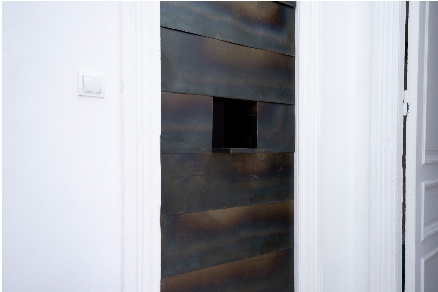
David Brodsky, Untitled (After Budka) , 2024, Tin Plate covered in hot oil, Site-specific installation, Size varies.