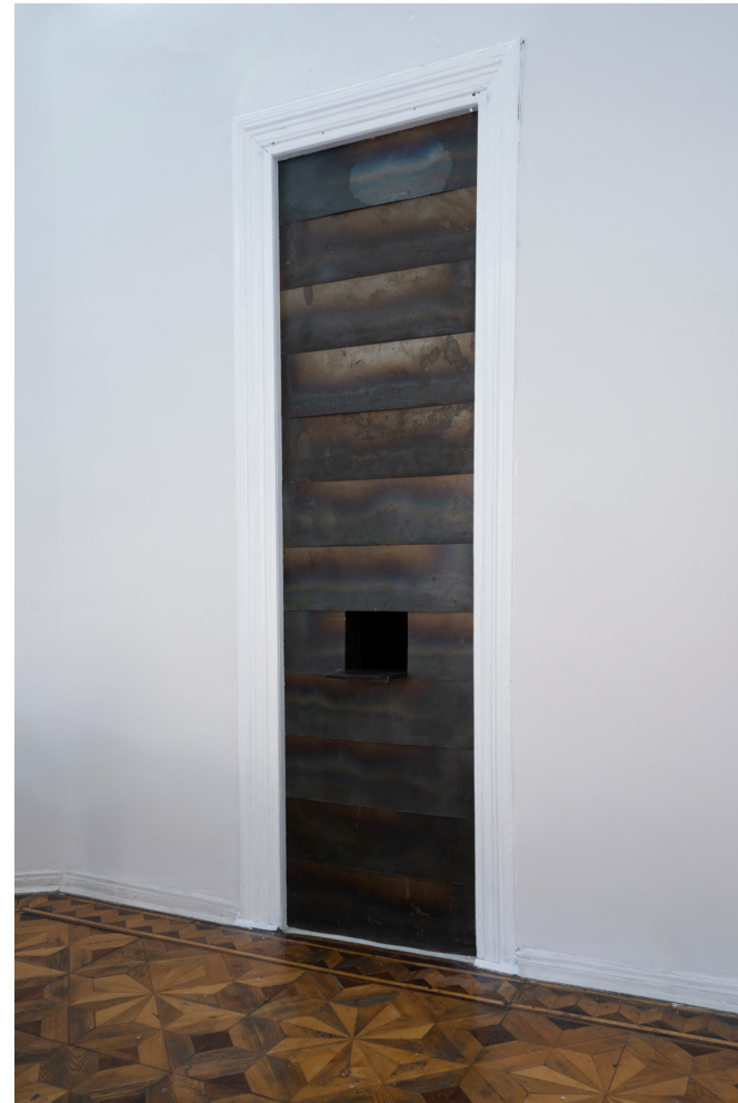
David Brodsky, Untitled (After Budka) , 2024, Tin Plate covered in hot oil, Site-specific installation, Size varies.