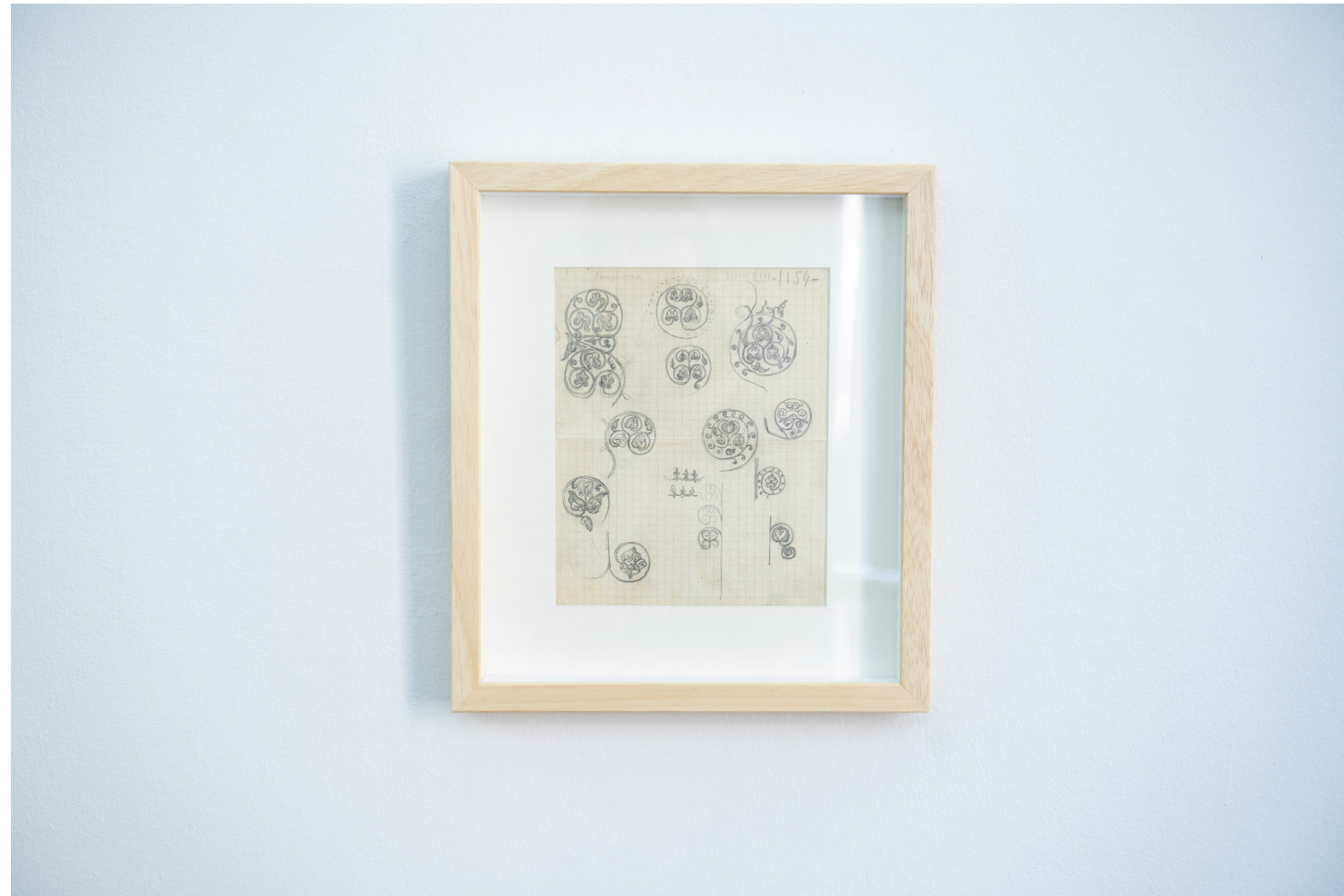
David Kakabadze, Sketch for the project Genesis of Georgian Ornament, Kakhuli Monastery, 1930's, 21 x 30 cm. Courtesy of David Kakabadze Foundation.