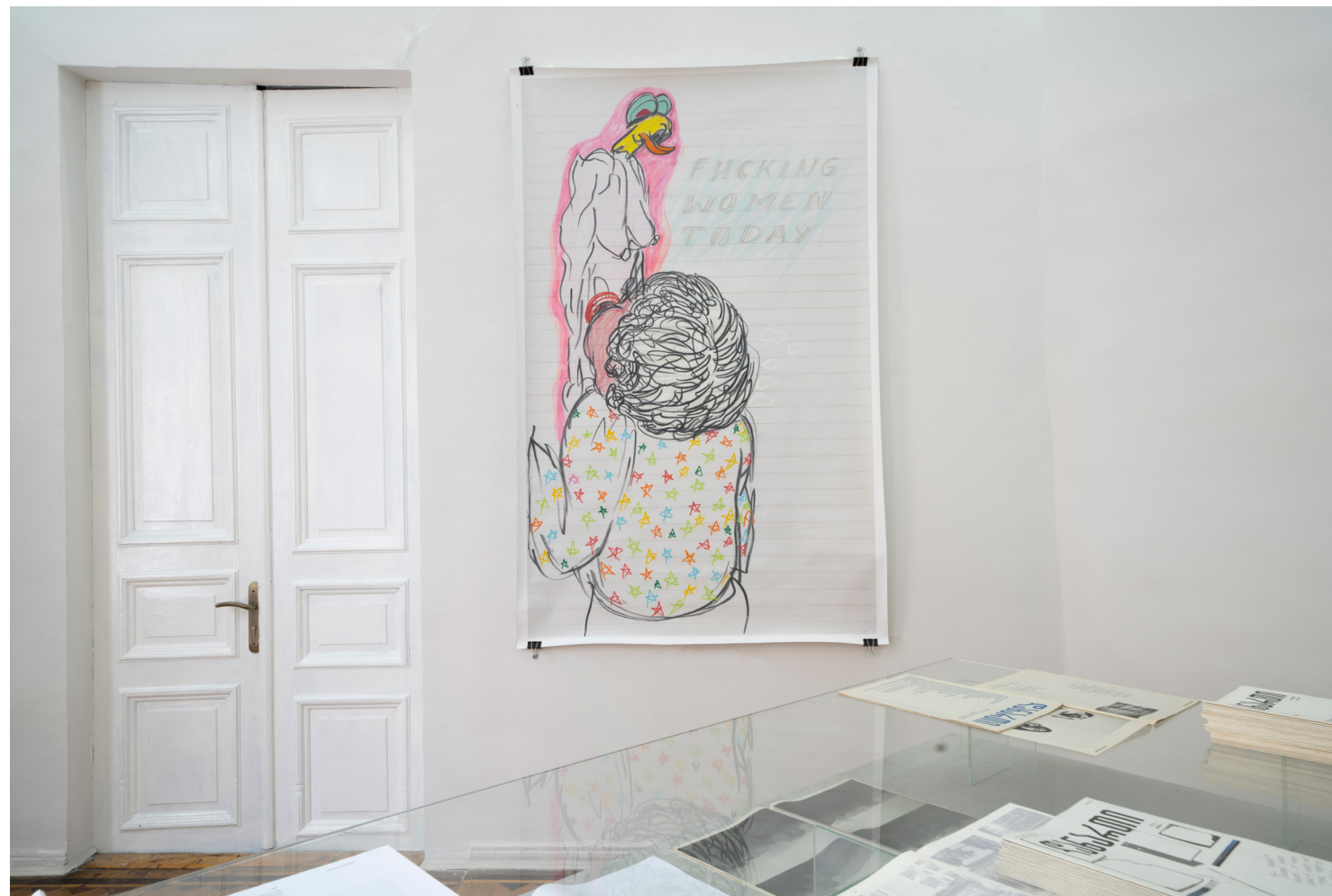
Maia Naveriani, Fucking Women Today, 2019, Inkjet Print, Acrylic, color pencil on sythetic canvas, 215 x 136 cm.