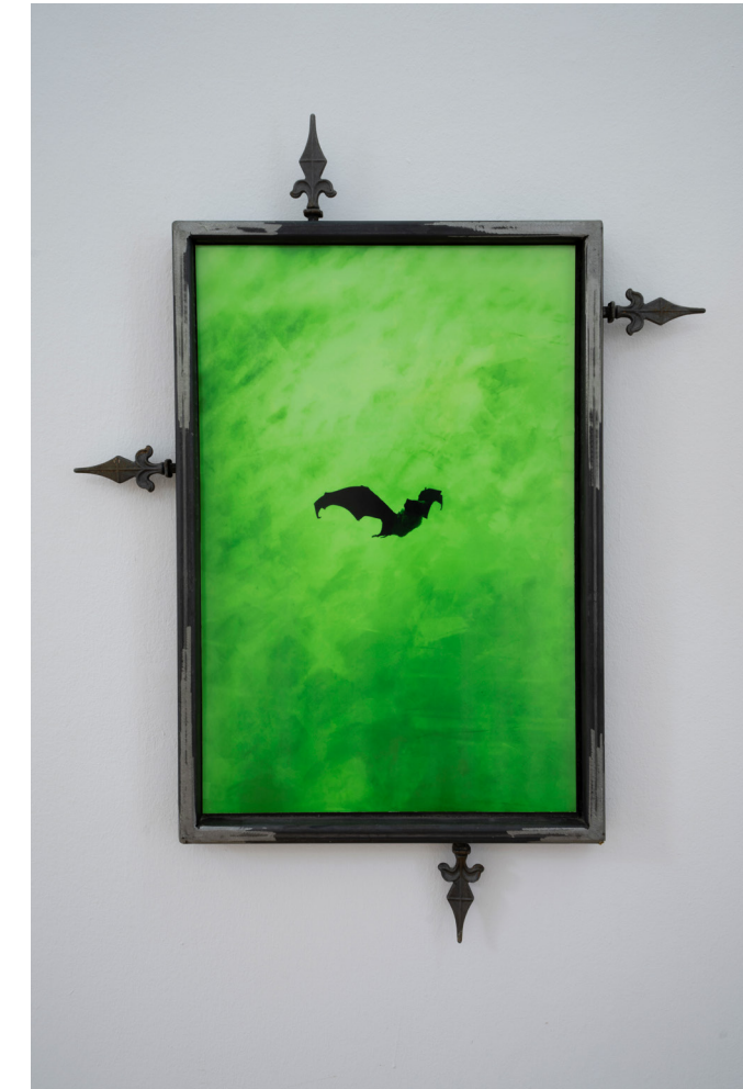
Andro Eradze, Bird of Prey , 2020, digital print, metal fence, metal spikes, 66 x 90 x 4 cm; Courtesy of artist and SpazioA Gallery.