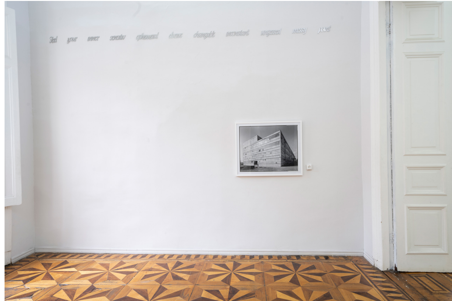
Danarti Archive and More , 2024, E.A. Shared Space, Tbilisi. Installation View.