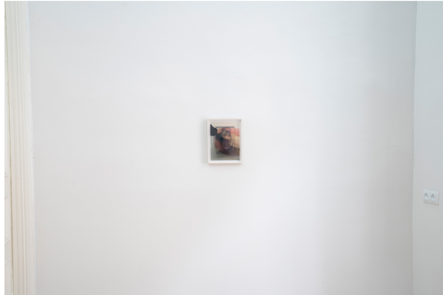
Ketuta Alexi-Meskhishvili, Okeefe's Shells My Son, 2022, Two archival pigment prints on screenfilm in a box frame, 30.6 × 22.7 cm. Courtesy the artist and LC Queisser.