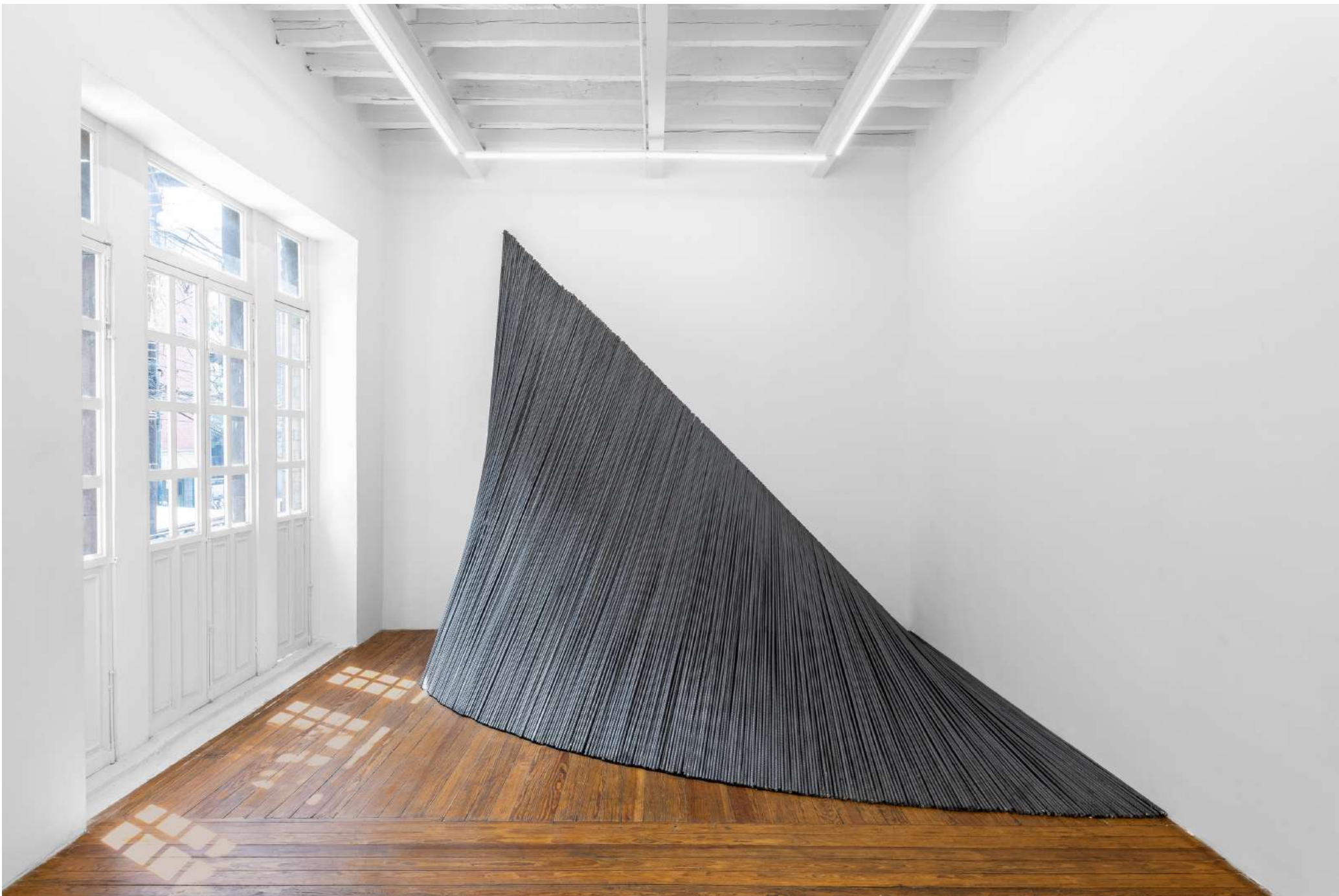
William Anastasi Conic Section , 1968, metal rods, ed. 2 of 10 + 2 A.P., dimensions variable [site specific]