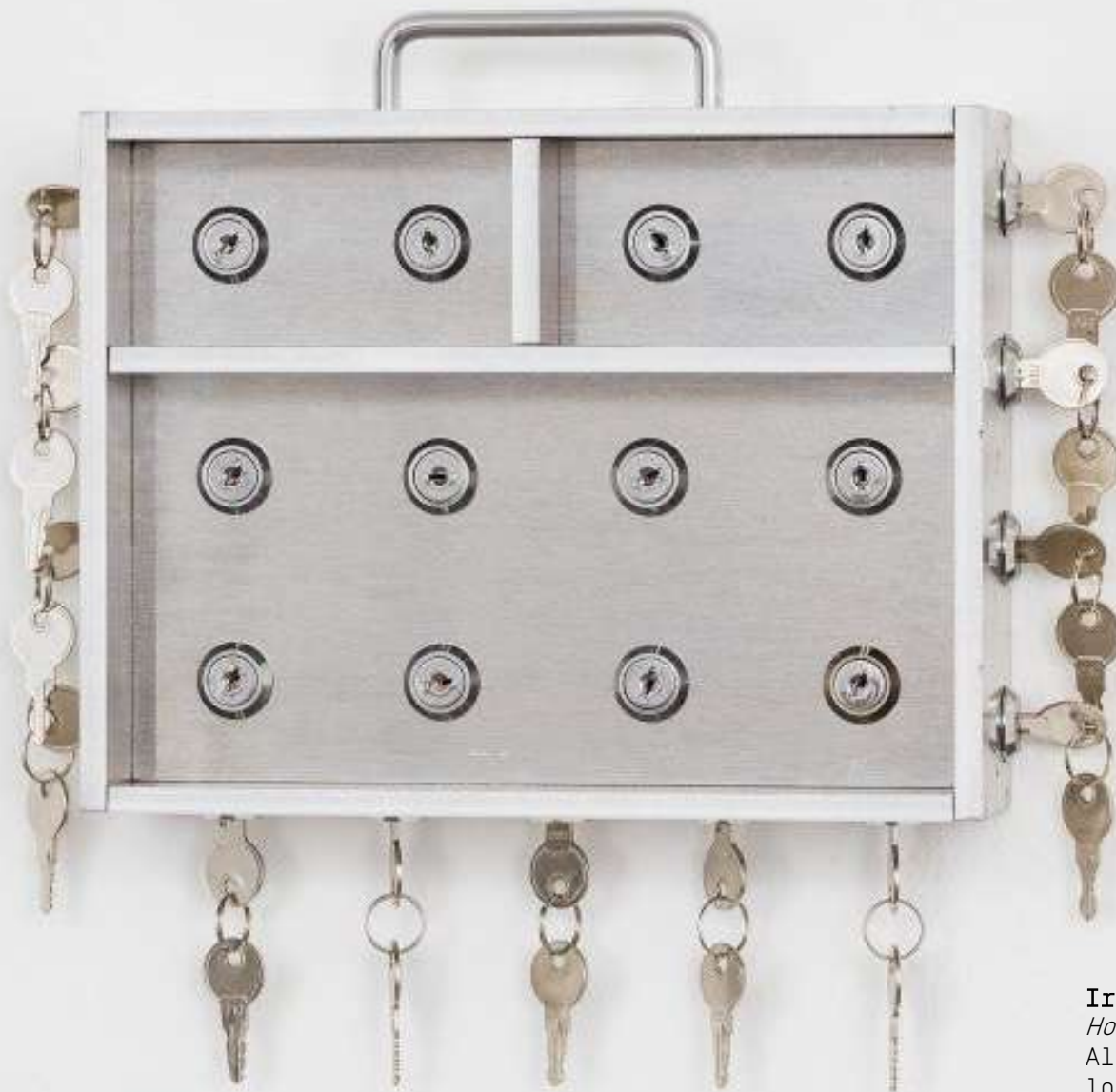
Irina Lotarevich Housing Anxiety 2 , 2021 Aluminium, stainless-steel screws, locks and keys 11 3/4 x 13 x 2 3/4 in 30 x 33 x 7 cm