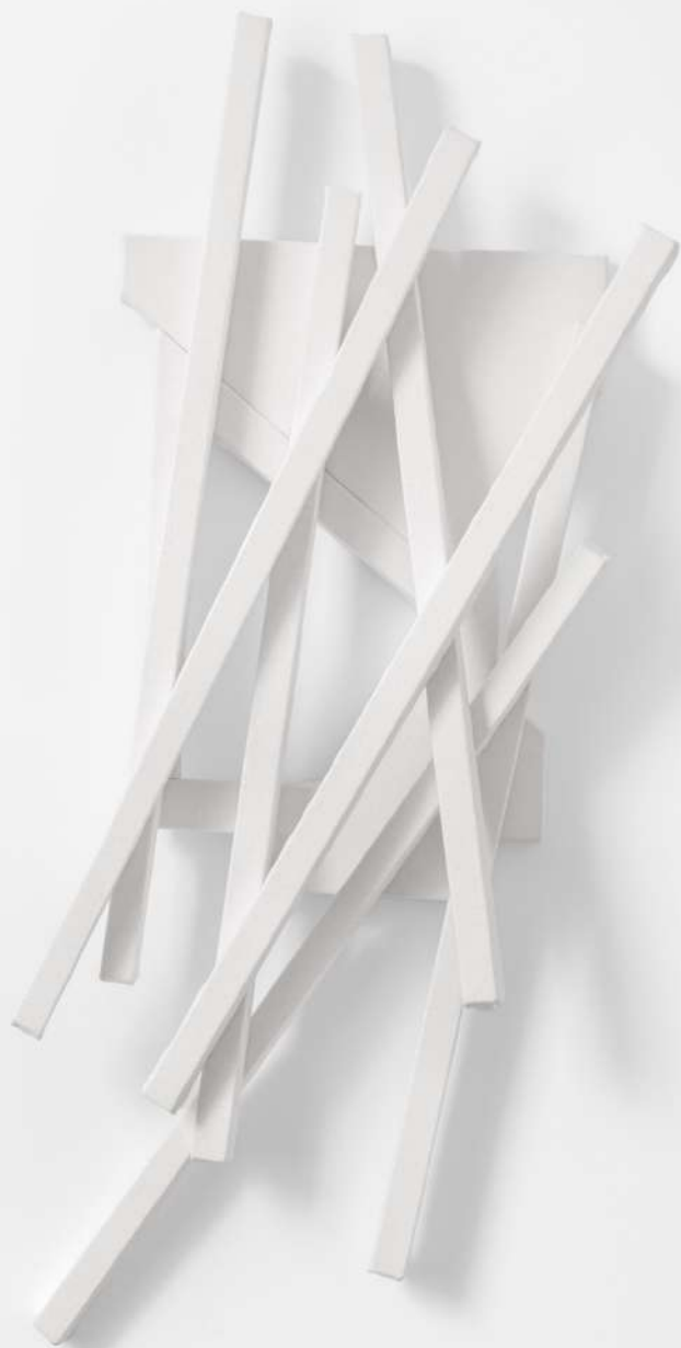
Wyatt Kahn Untitled, 2021 Linen on wood panels 50 1/2 x 20 1/2 x 6 in 128.3 x 52.1 x 15.2 cm