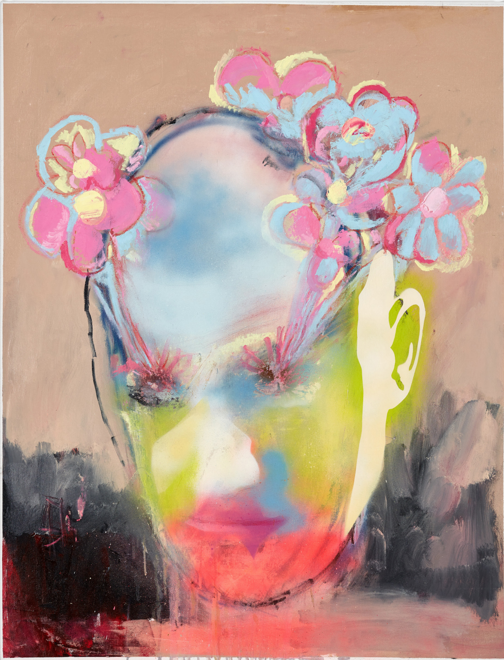
Alessandro Pessoli, Testa fiorita , 2024 colored pencils, oil, spray paint on canvas, 102 x 78,5 cm