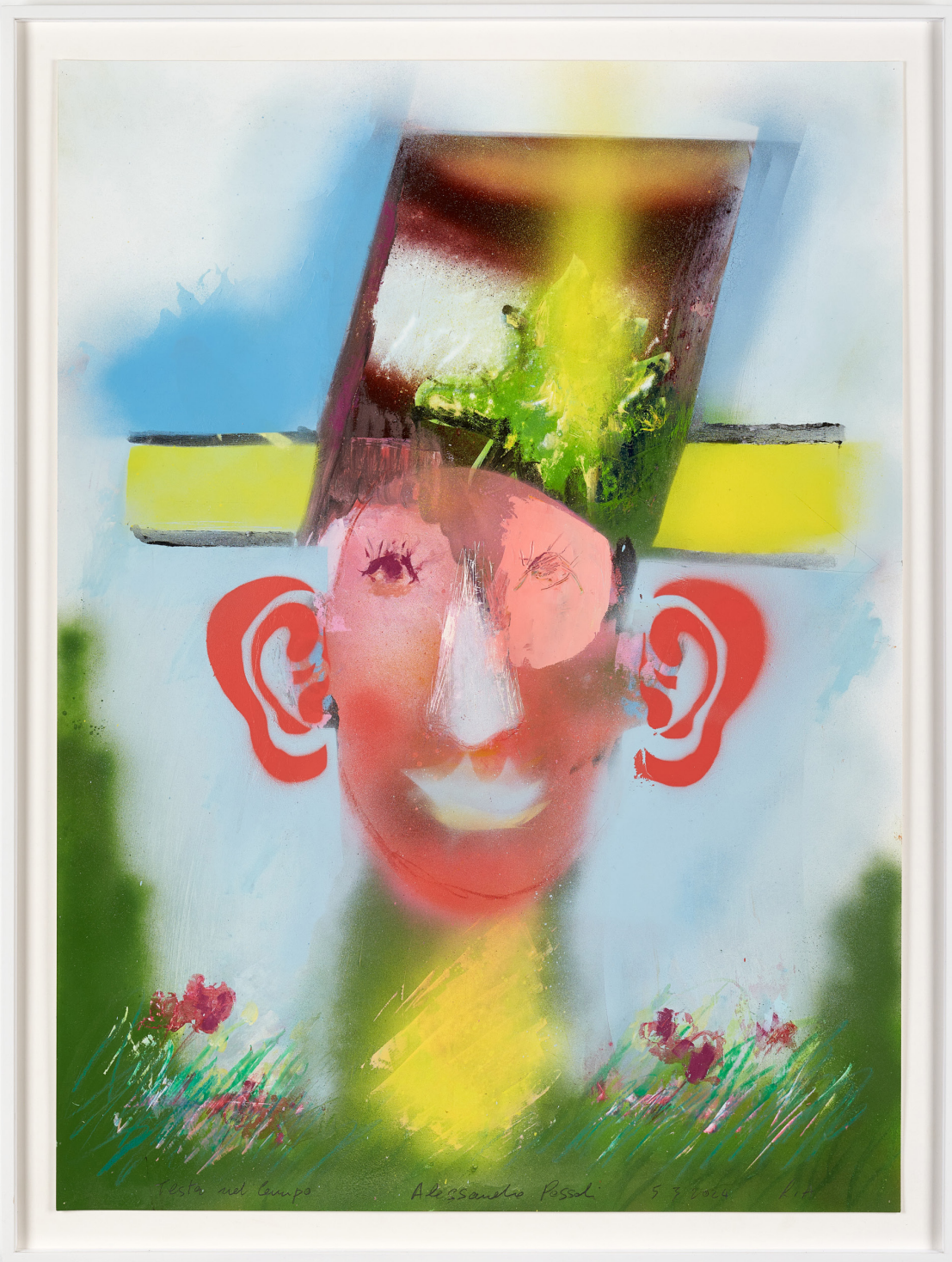
Alessandro Pessoli, Testa nel campo , 2024 colored pencils, oil pastels, oil, spray paint on paper, 76 × 56 cm