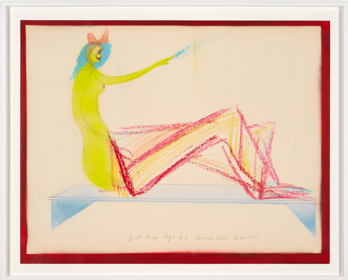
Alessandro Pessoli, Girl long legs #1 , 2023 colored pencils, oil pastels, oil, spray paint on paper, 49,5 × 63 cm