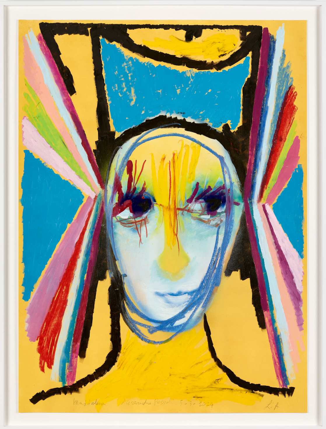
Alessandro Pessoli, Maddalena , 2024 colored pencils, oil pastels, oil, spray paint on paper, 76 x 56 cm