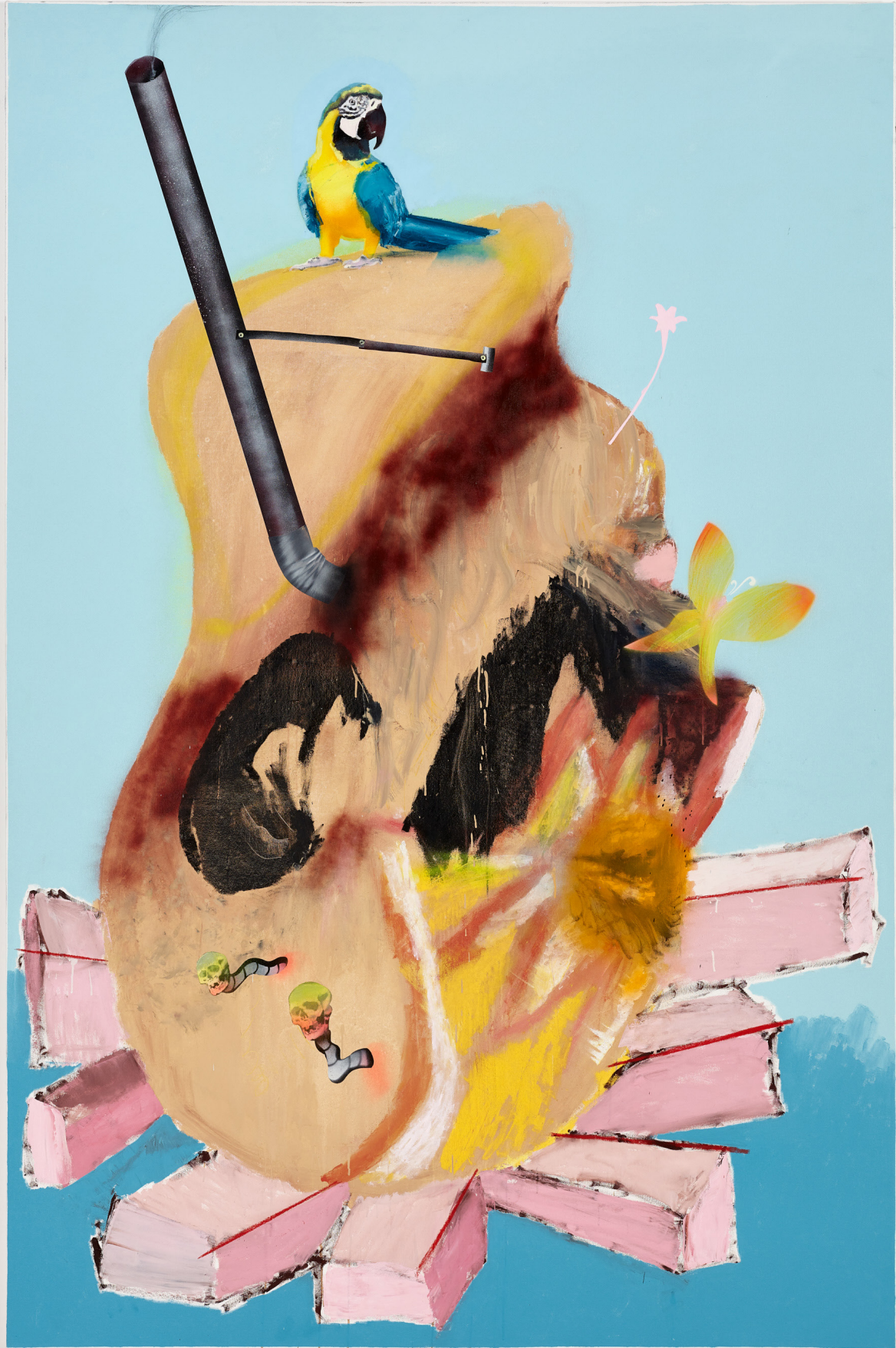
Alessandro Pessoli, My House - la mia casa #2 , 2024 colored pencils, oil, spray paint on canvas, 224 × 148 cm