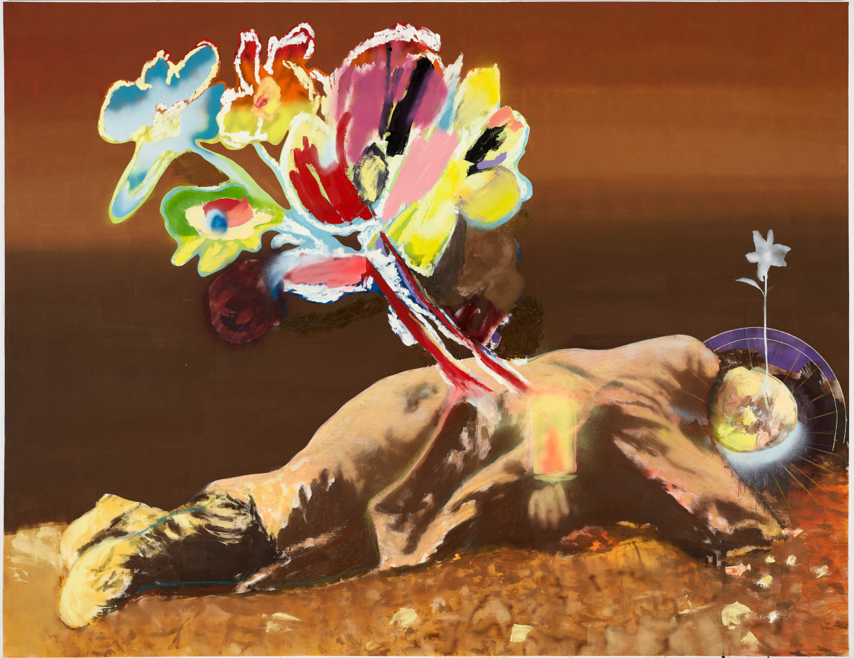
Alessandro Pessoli, Illumina la pittura (deposizione) , 2024 colored pencils, oil, spray paint on canvas, 224 × 290 cm