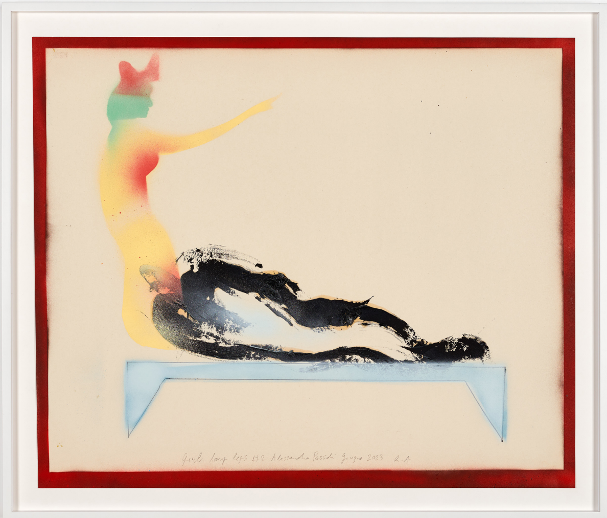
Alessandro Pessoli, Girl long legs #2 , 2023 colored pencils, oil, spray paint on paper, 44,5 × 63,5 cm