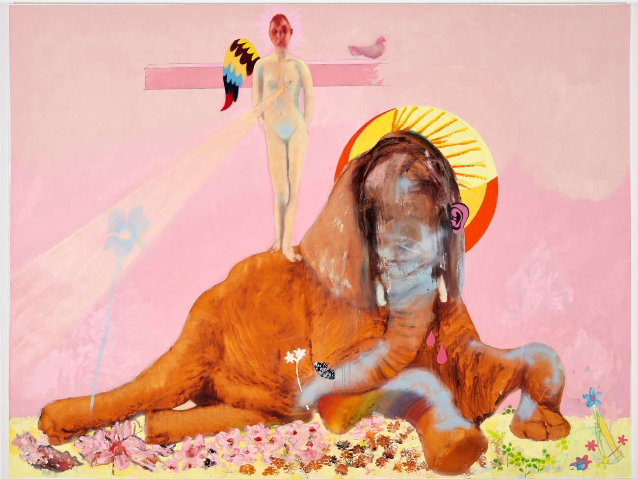
Alessandro Pessoli, Before the dark , 2024 colored pencils, oil, spray paint on canvas, 224 × 293,5 cm