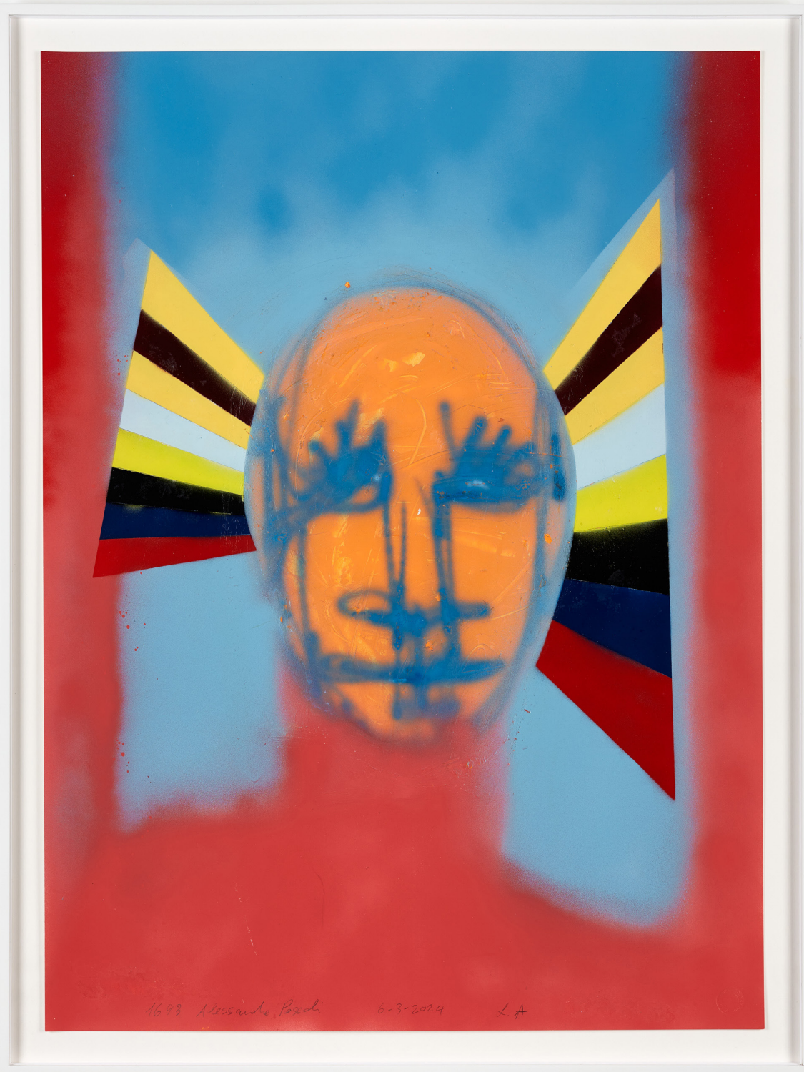
Alessandro Pessoli, 1963 , 2024 colored pencils, oil, spray paint, enamel on paper, 76 × 56 cm