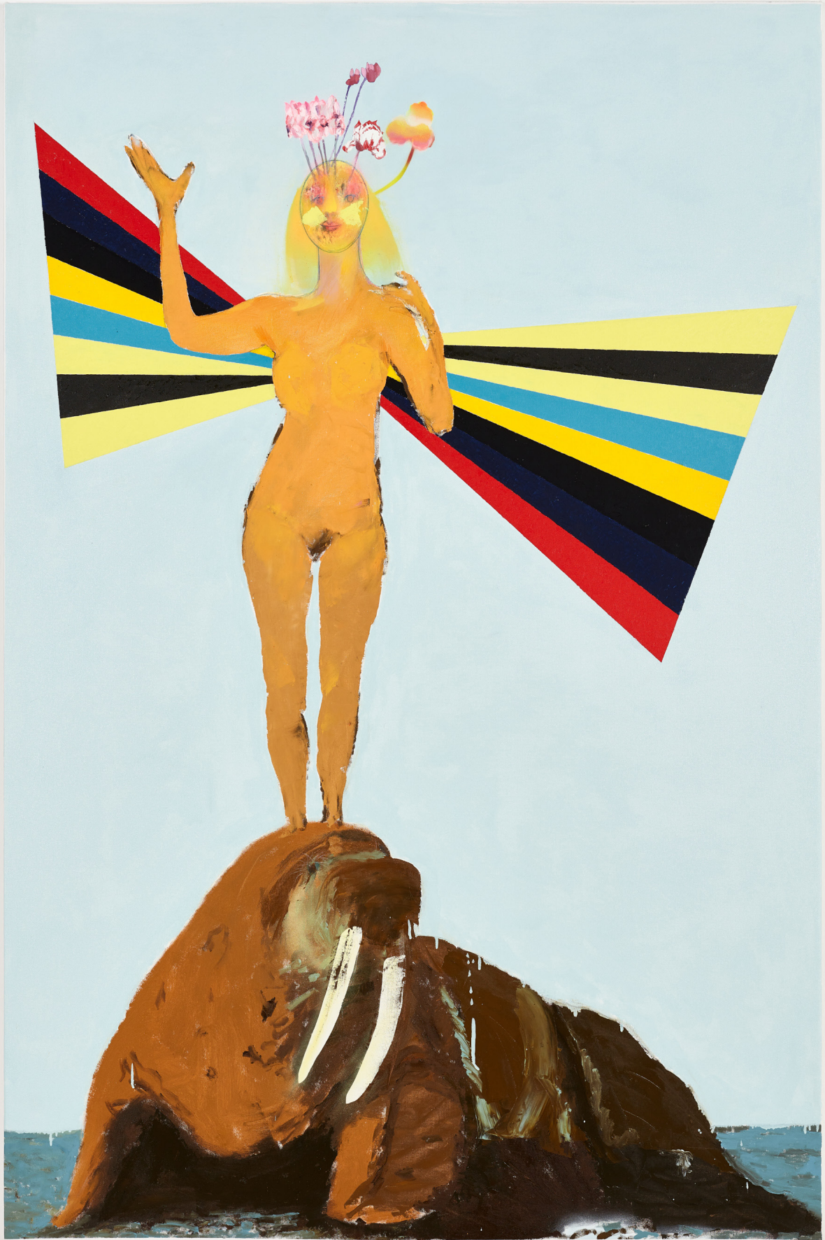
Alessandro Pessoli, Assunzione della figura , 2024 colored pencils, oil, spray paint on canvas, 224 × 148 cm