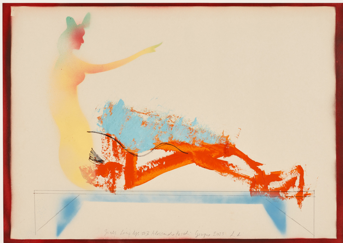
Alessandro Pessoli, Girl long legs #3 , 2023 colored pencils, oil, spray paint on paper, 44,5 × 63,5 cm