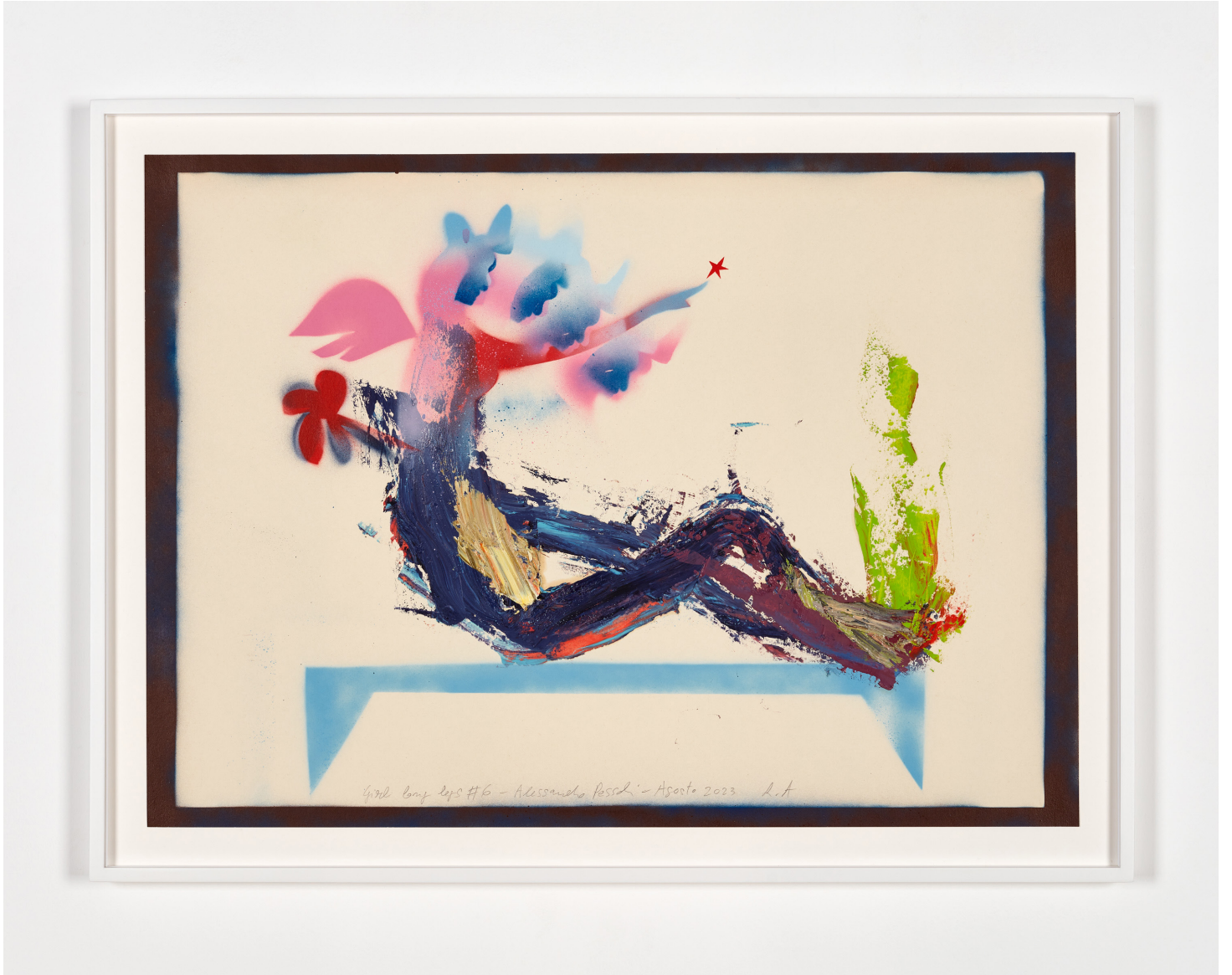
Alessandro Pessoli, Girl long legs #6 , 2023 colored pencils, oil, spray paint on paper, 44,5 × 63,5 cm