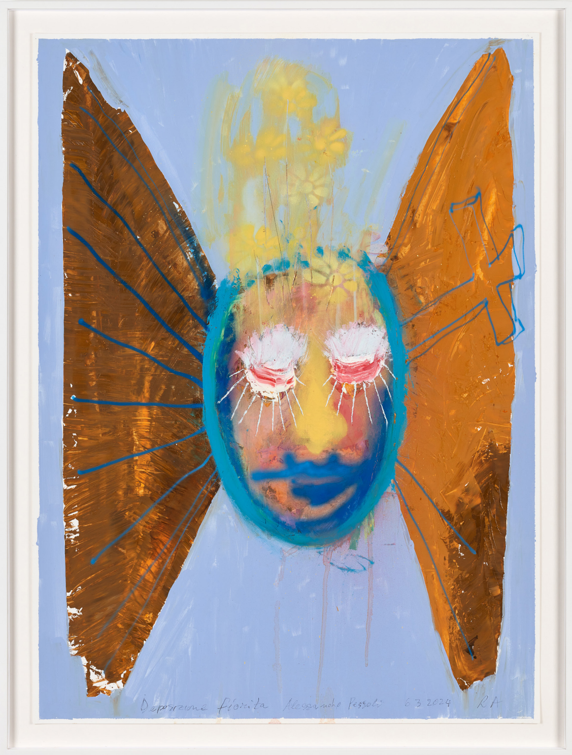
Alessandro Pessoli, Deposizione fiorita , 2024 colored pencils, oil, spray paint, enamel, acrylic on paper, 76 x 56 cm