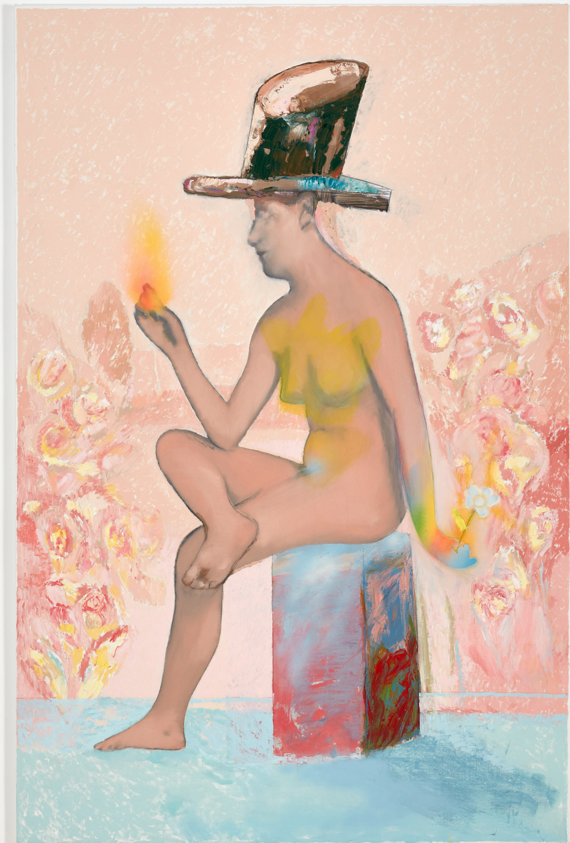
Alessandro Pessoli, Sentimento Illumina , 2024 colored pencils, oil, spray paint on canvas, 224 × 147 cm