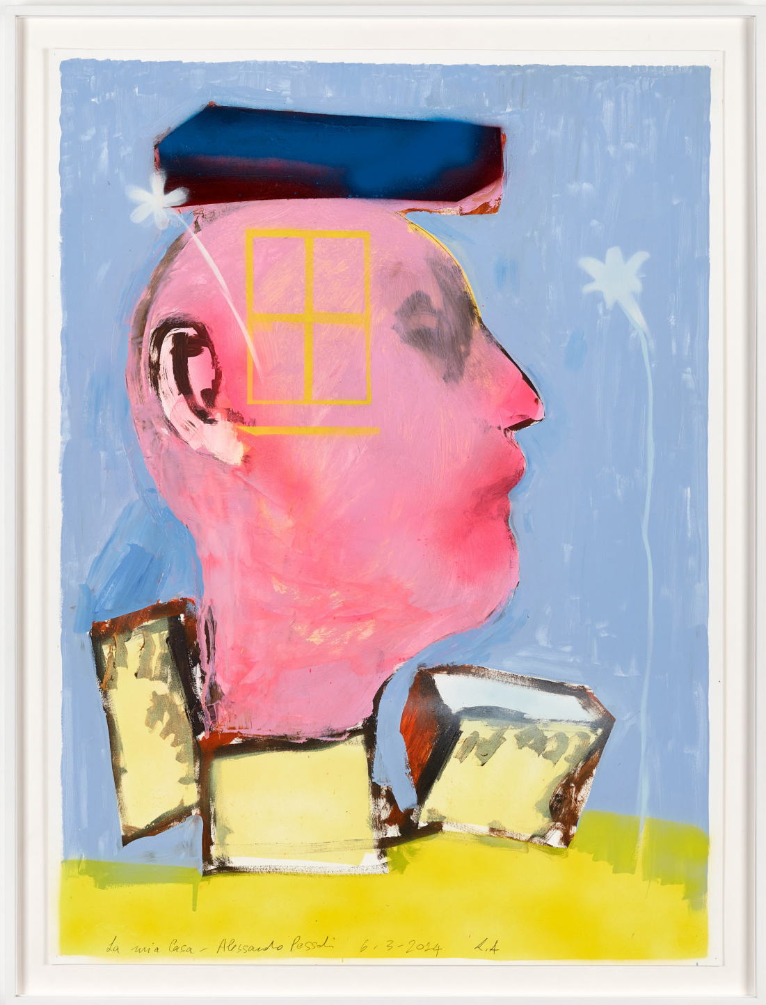
Alessandro Pessoli, La mia casa , 2024 colored pencils, oil, spray paint, enamel on paper, 76 x 56 cm