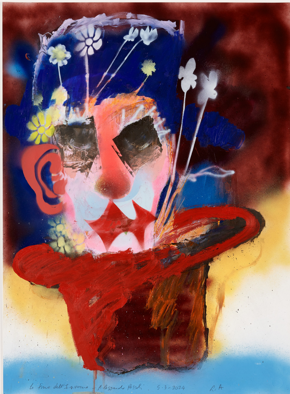
Alessandro Pessoli, La fine dell'Inverno , 2024 colored pencils, oil, spray paint on paper, 76 × 56 cm