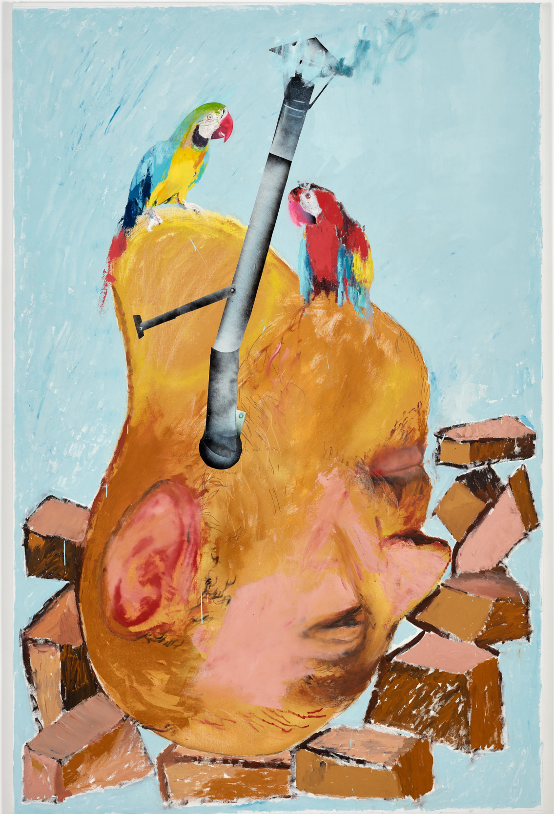
Alessandro Pessoli, My House - la mia casa #1 , 2024 colored pencils, oil, spray paint on canvas, 224 x 147 cm