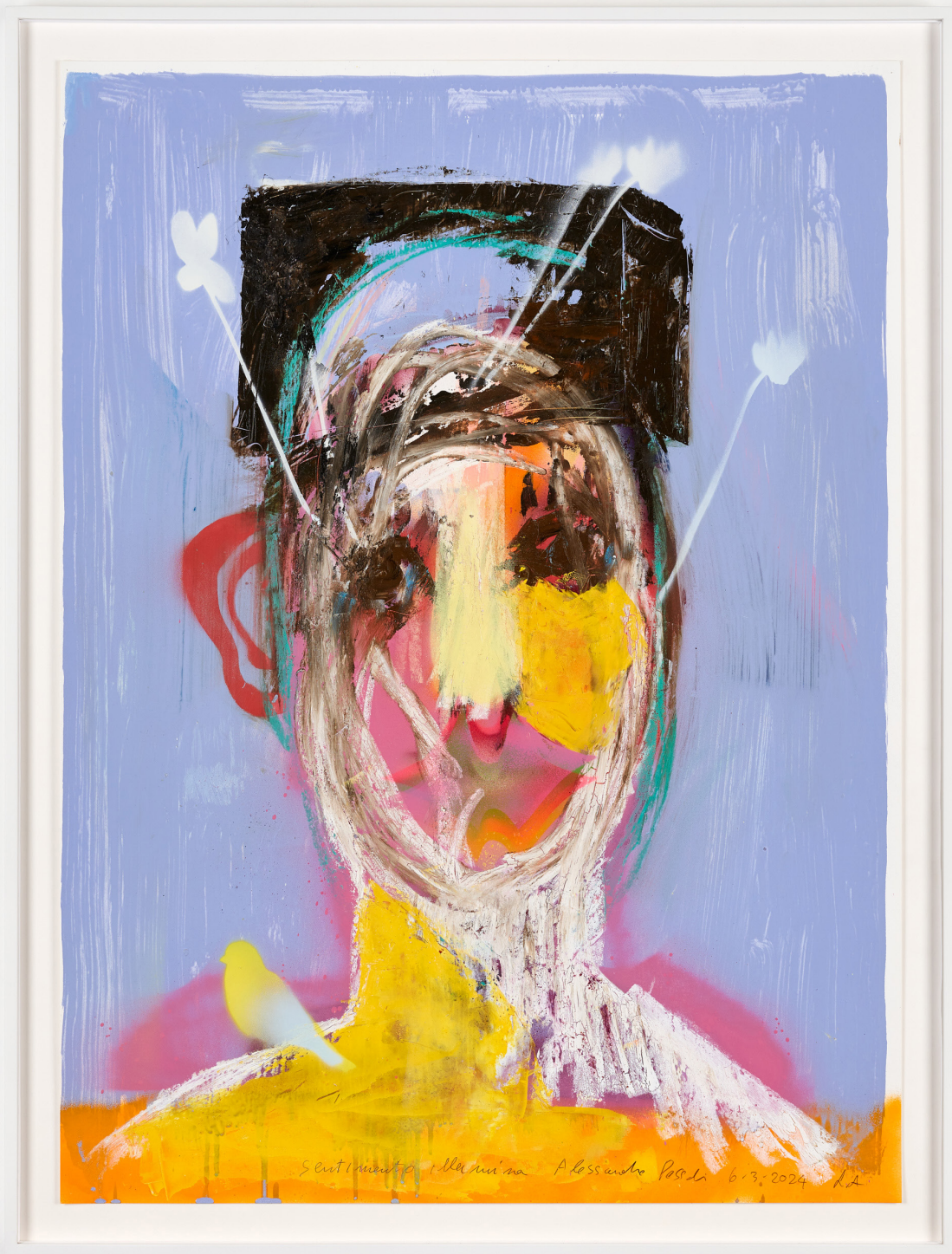
Alessandro Pessoli, Sentimento illumina , 2024 colored pencils, oil pastels, spray paint, enamel on paper, 76 x 56 cm