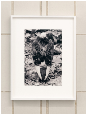
James Krone, Pigeon , 2024, archival pigment print in artists frame, 36 x 28 cm