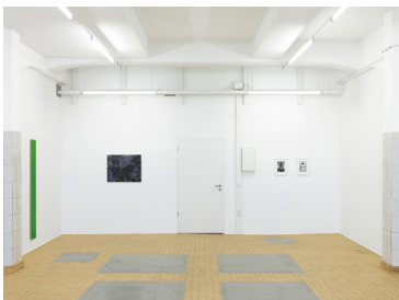
James Krone, Emergency of Pattern , 2024, exhibition view, (REPERTOIRE), Berlin/Tempelhof