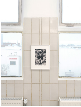
James Krone, Emergency of Pattern , 2024, exhibition view, (REPERTOIRE), Berlin/Tempelhof