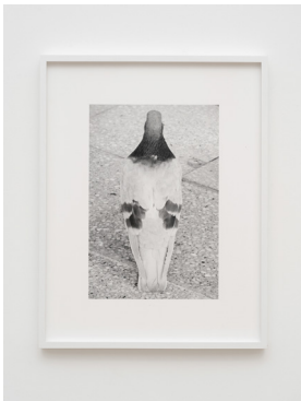
James Krone, Pigeon , 2023, archival pigment print in artists frame, 36 x 28 cm