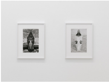
James Krone, Emergency of Pattern , 2024, exhibition view, (REPERTOIRE), Berlin/Tempelhof