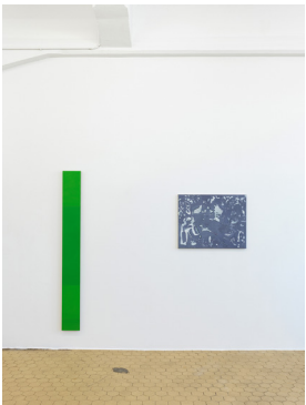
James Krone, Emergency of Pattern , 2024, exhibition view, (REPERTOIRE), Berlin/Tempelhof