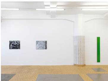
James Krone, Emergency of Pattern , 2024, exhibition view, (REPERTOIRE), Berlin/Tempelhof