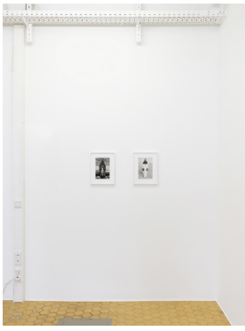
James Krone, Emergency of Pattern , 2024, exhibition view, (REPERTOIRE), Berlin/Tempelhof