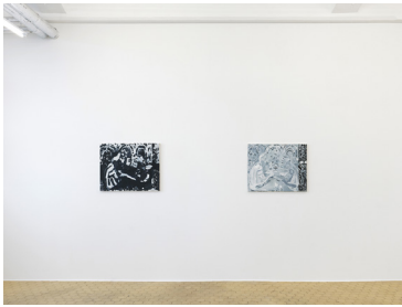
James Krone, Emergency of Pattern , 2024, exhibition view, (REPERTOIRE), Berlin/Tempelhof