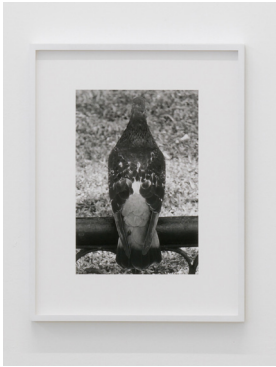
James Krone, Pigeon , 2023, archival pigment print in artists frame, 36 x 28 cm