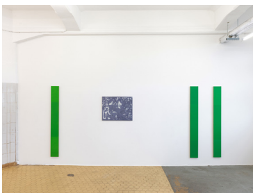
James Krone, Emergency of Pattern , 2024, exhibition view, (REPERTOIRE), Berlin/Tempelhof