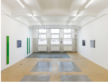
James Krone, Emergency of Pattern , 2024, exhibition view, (REPERTOIRE), Berlin/Tempelhof