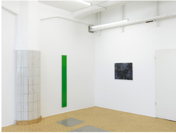
James Krone, Emergency of Pattern , 2024, exhibition view, (REPERTOIRE), Berlin/Tempelhof