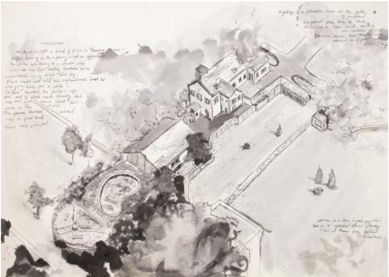
Katharina Jahnke „Graceland“, 2004, Tusche / Papier, (India ink / paper), 42 x 60 cm