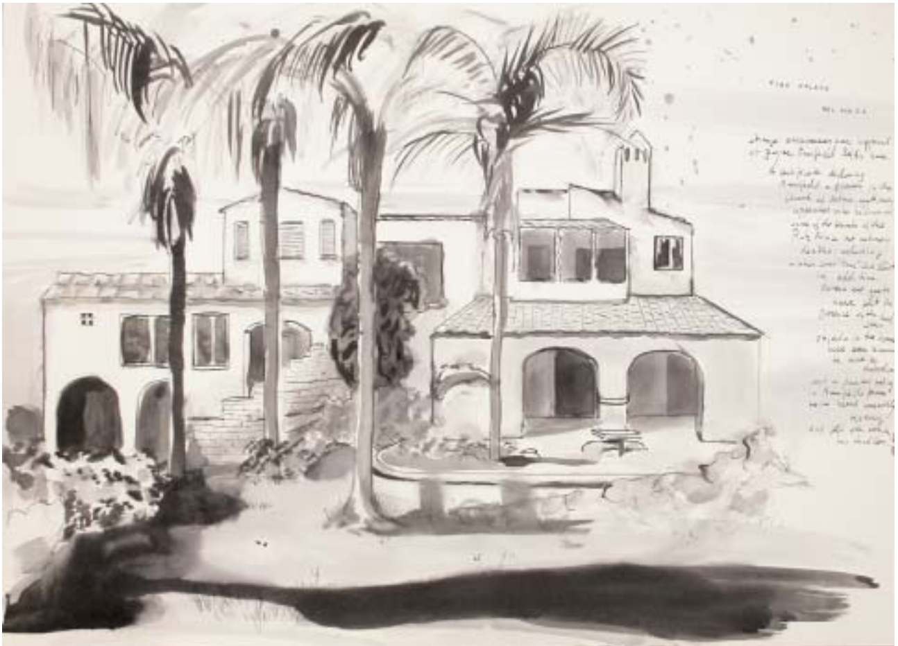
Katharina Jahnke „Pink Palace, Bel Air, CA“, 2004, Tusche / Papier, (India ink / paper), 42 x 60 cm