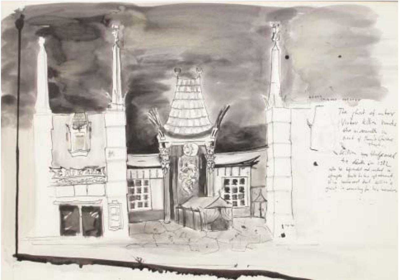
Katharina Jahnke „Mann's Chinese Theater“, 2004, Tusche / Papier, (India ink / paper), 42 x 60 cm