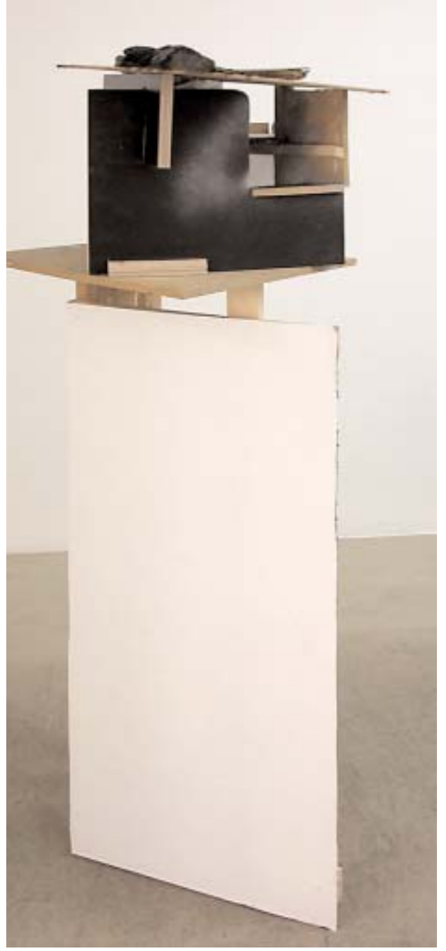
Katharina Jahnke „Woodhouse“, 2004, mixed media, 68 x 58 x 138 cm