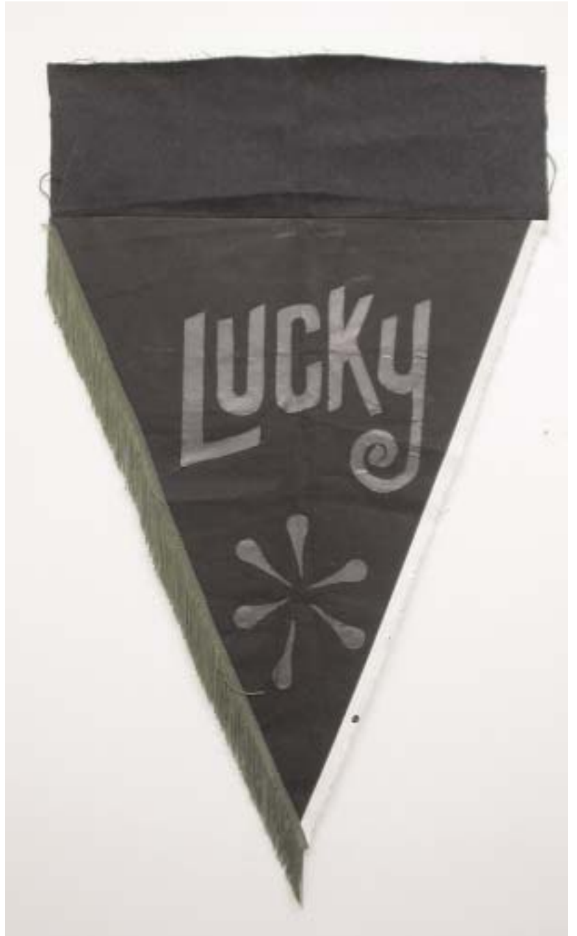
Katharina Jahnke „haloed angels“ und „Lucky“, 2003, Stoff mit Applikationen, 120 x 45 cm und 80 x 52 cm