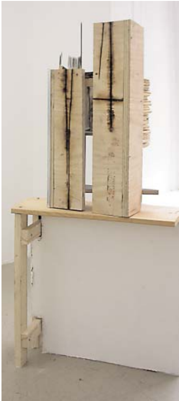
Katharina Jahnke „Highland Towers“, 2004, mixed media, 55 x 30 x 121,5 cm