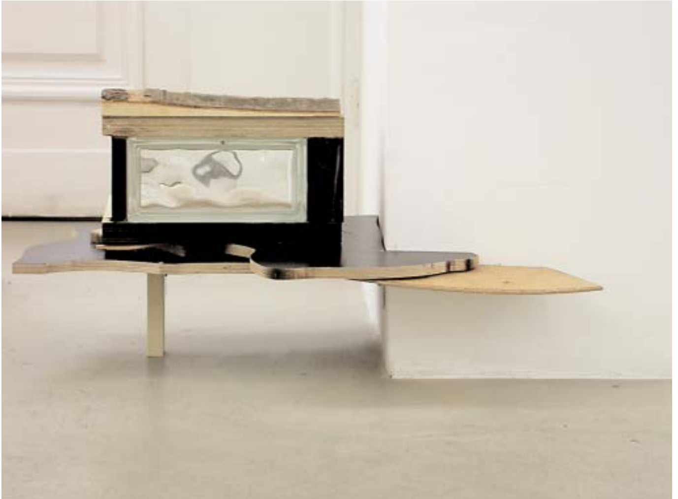
Katharina Jahnke „Nr. 37“, 2004, mixed media, 77 x 58 x 38 cm