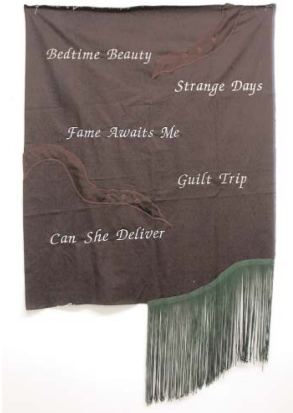
Katharina Jahnke „Bedtime beauty“, 2003, Stoff mit Applikationen, 135 x 90 cm