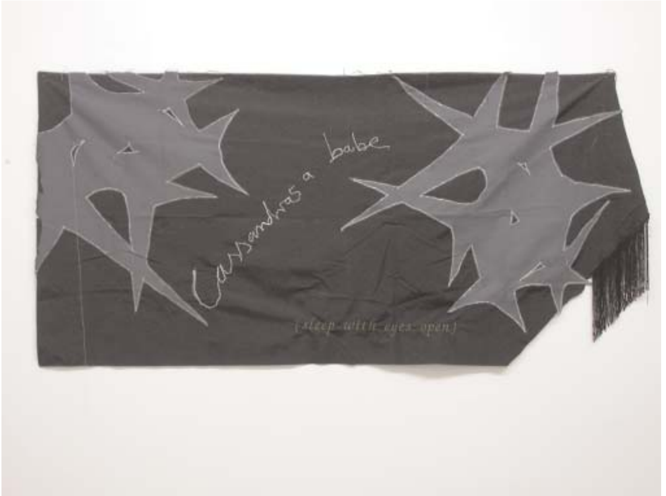
Katharina Jahnke „Cassandras a babe“, 2003, Stoff mit Applikationen, 60 x 150 cm