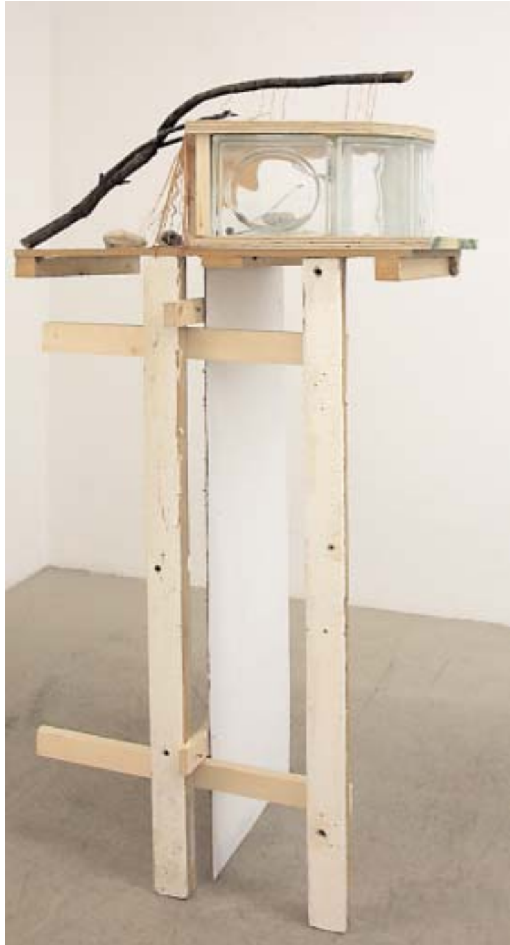
Katharina Jahnke „Last house on the left“, 2004, mixed media, 67,5 x 44 x 137 cm