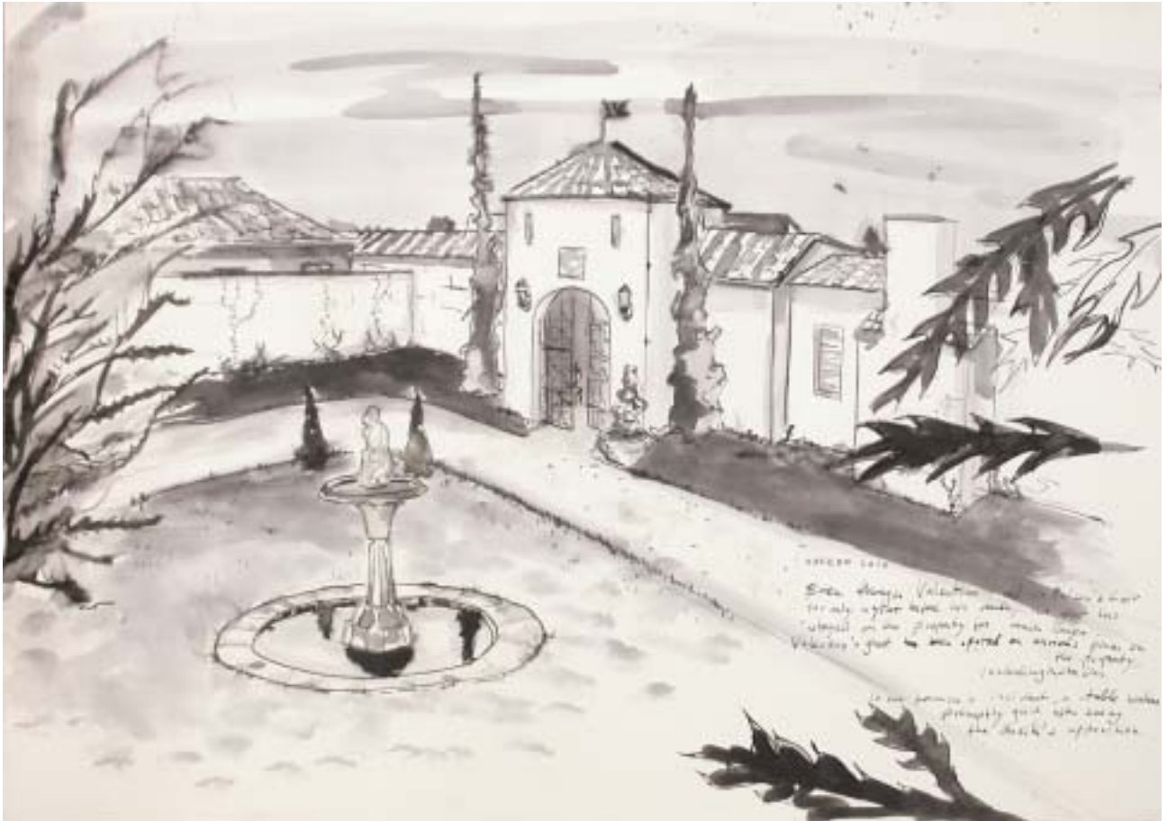
Katharina Jahnke „Falcon Lair“, 2004, Tusche / Papier, ( India ink / paper ), 42 x 60 cm