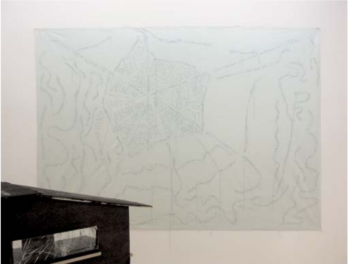
Katharina Jahnke „A, V, X, Z“, 2004, Faden / mit Kunststoff beschichtetem Stoff, (thread / fabric), 140 x 210 cm