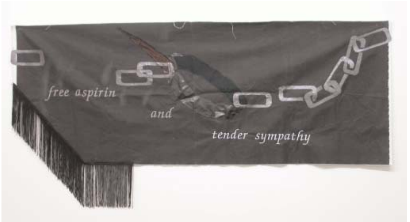
Katharina Jahnke „free aspirin...“, 2003, Stoff mit Applikationen, 60 x 150 cm