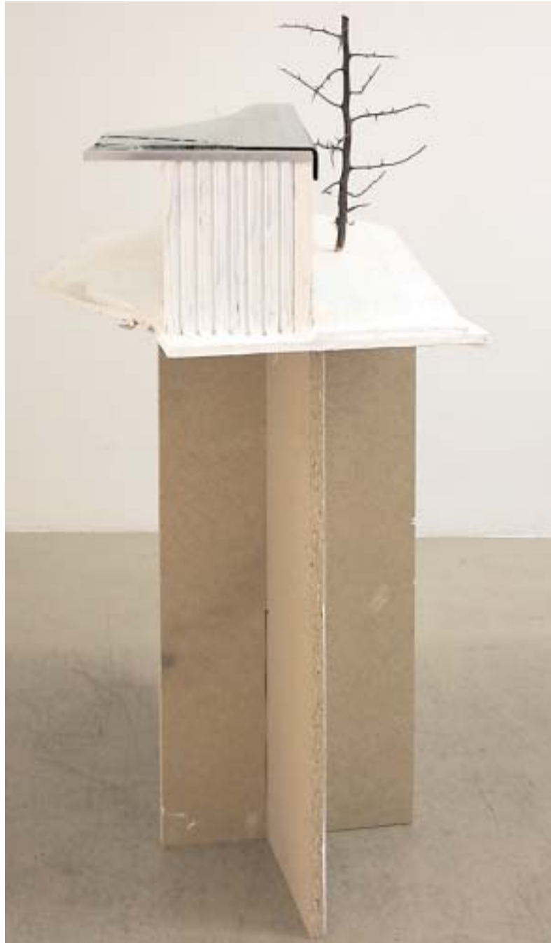
Katharina Jahnke „Motel opposite the Blue Parrot Bar“, 2004, mixed media, 85 x 60 x 120 cm