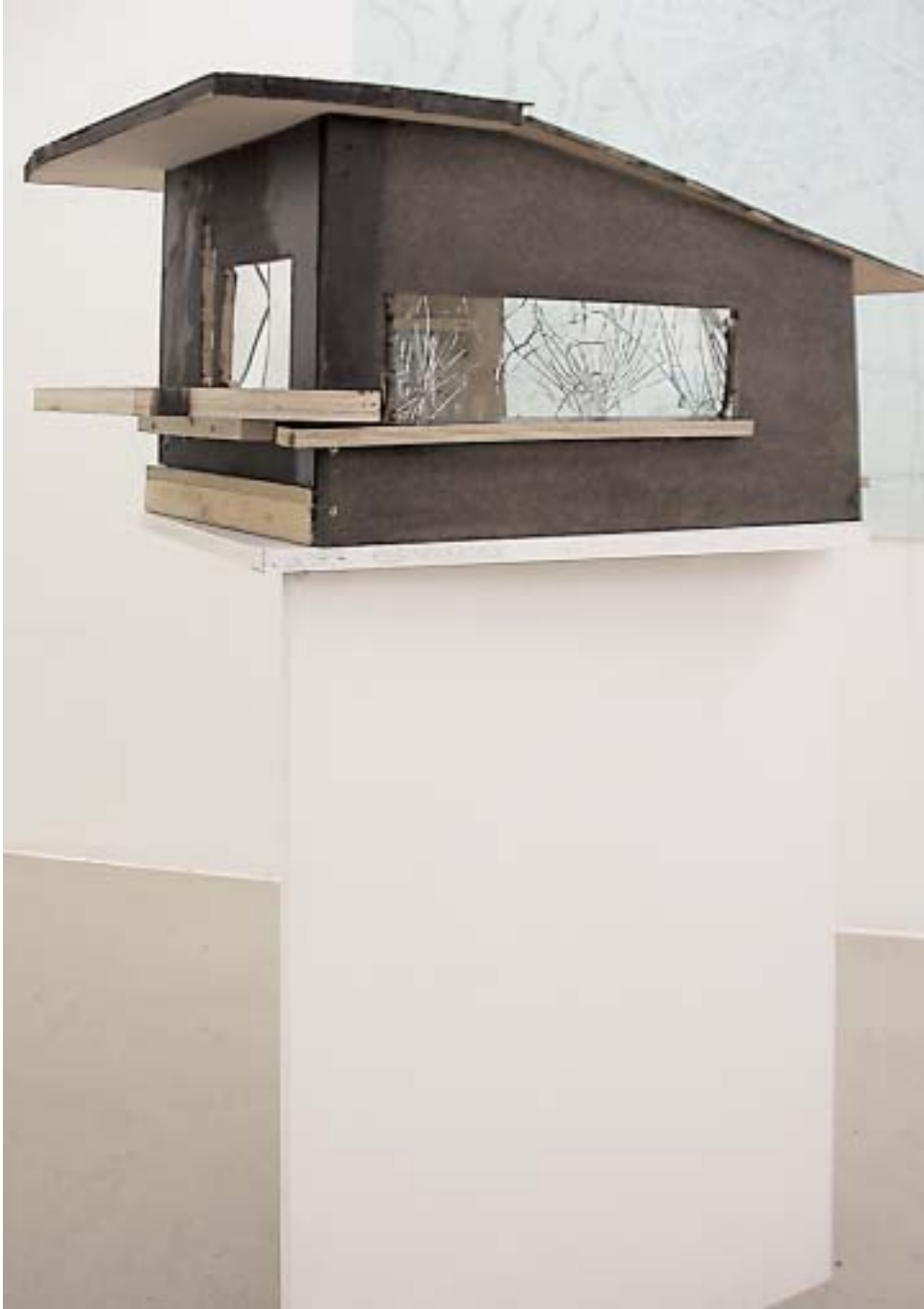
Katharina Jahnke „Backwoods“, 2004, mixed media, 76 x 40 x 122,5 cm