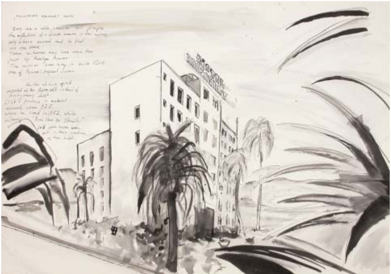
Katharina Jahnke „Hollywood Roosevelt Hotel“, 2004, Tusche / Papier (India ink / paper), 42 x 60 cm