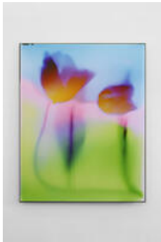
Ketuta Alexi-Meskhishvili making food out of sunlight (dawn), 2024 Dye sublimation on aluminum 125 × 100 cm (49 1/4 × 39 3/8 inches)