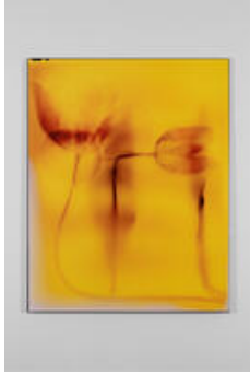
Ketuta Alexi-Meskhishvili making food out of sunlight (sunrise), 2024 Dye sublimation on aluminum 125 × 100 cm (49 1/4 × 39 3/8 inches)

Tsinamdzghvrishili st. 49, Tbilisi, Georgia