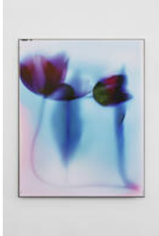
Ketuta Alexi-Meskhishvili making food out of sunlight (twilight), 2024 Dye sublimation on aluminum 125 × 100 cm (49 1/4 × 39 3/8 inches)