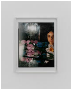
Ketuta Alexi-Meskhishvili A Life's Work Analog C-print 41.4 × 32 cm (16 1/4 × 12 5/8 inches)