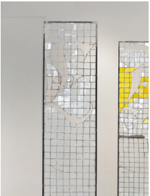
Frances Adair Mckenzie IDEAL (E), 2024 Cast Aluminium Aluminium, glass, solder, copper wire, copper foil, epoxy 84 x 17 x 1