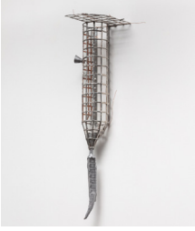
Frances Adair Mckenzie In between the lottery numbers, 2024 Cast Aluminum, glass, solder, copper wire, copper foil, 24 x 5 x 4 in.