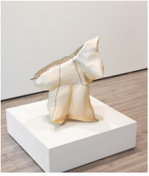
Frances Adair Mckenzie It stood up in the water and regarded me, 2024 Plaster, slumped glass, oil paint, aluminum wire, epoxy 28 x 24 x 25 in.