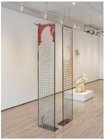
Frances Adair Mckenzie Ideal (D), 2024 Cast Aluminum, Aluminum, glass, solder, copper wire, copper foil, epoxy 84 x 17 x 1