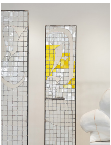
Frances Adair Mckenzie IDEAL (A), 2024 Cast Aluminium Aluminium, glass, solder, copper wire, copper foil, epoxy 84 x 17 x 1