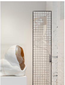
Frances Adair Mckenzie IDEAL (L), 2024 Cast Aluminium Aluminium, glass, solder, copper wire, copper foil, epoxy 84 x 17 x 1