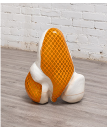
Frances Adair Mckenzie It was interested in music, 2024 Plaster, slumped glass, oil paint, copper wire, epoxy 28 x 20 x 20 in.