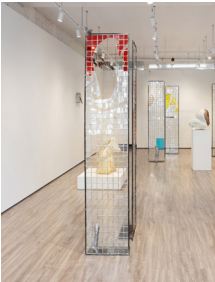
Frances Adair Mckenzie IDEAL (I), 2024 Cast Aluminum, Aluminum, glass, solder, copper wire, copper foil, epoxy 84 x 17 x 1 in.