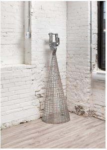
Frances Adair Mckenzie Down the grey avenue between the eyes, 2024 Cast Aluminum, glass, solder, copper wire, copper foil, epoxy 63 x 24 x 12 in.