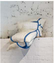
Frances Adair Mckenzie Between Thumb and Finger, 2024 Plaster, oil paint, epoxy, graphite 36 x 24 x 24 in.