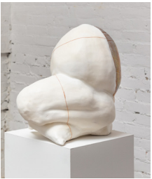
Frances Adair Mckenzie It was a believer in total immersion, 2024 Plaster, slumped glass, oil paint, copper wire, epoxy 24 x 24 x 28 in.