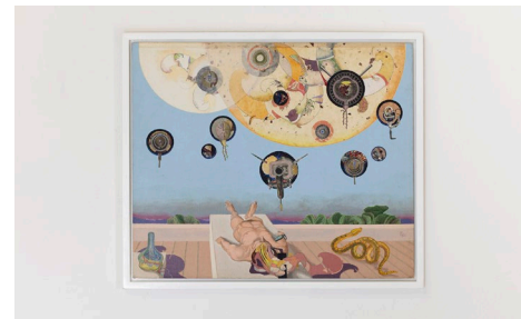
Susana Wald and Ludwig Zeller La visión de Montezuma / The vision of Montezuma , 1980 de la serie Mirages 40 x 51 cm Frame: 43 x 54 x 3 cm Collage, ink and acylic on paper