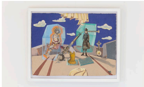
Susana Wald and Ludwig Zeller Untitled (Rencontre de Notre Dame des Christaux et L'Ermite) from Mirages series, (1978) drawing (signed): 30.2 x 40.5 cm frame: 36.2 x 46.5 x 3 cm Collage, ink and acylic on paper