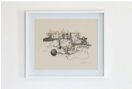
Susana Wald and Ludwig Zeller El poeta se casa con la medium / The poet marries the medium , 1980 de la serie Mirages drawing: 40 x 50 cm frame: 52 x 62 x 3 cm Collage and ink on paper