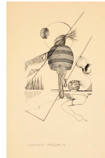
Susana Wald and Ludwig Zeller Untitled , 1979 de la serie Mirages drawing: 40.7 x 25.7 cm frame: 55 x 40 x 3 cm Collage and ink on paper WZ_Mirage79-002