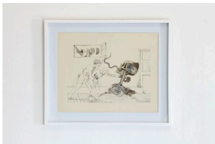
Susana Wald and Ludwig Zeller Los vidrios de la sed / The glass of thirst , 1980 de la serie Mirages drawing: 40 x 50 cm frame: 52 x 62 x 3 cm Collage and ink on paper