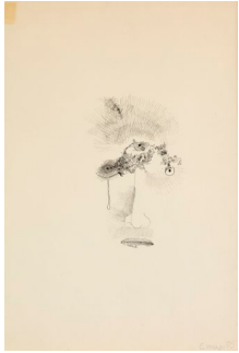
Susana Wald Sin título , (1965) ink and pencil on paper 55 x 39 cm / 21,6 x 15,3 in