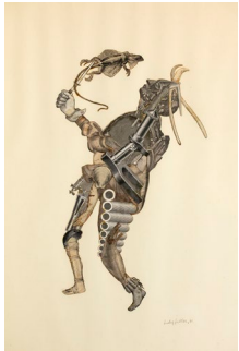
Ludwig Zeller Untitled (1979) Collage on paper drawing (signed): 40 x 30 cm NRGS24-002