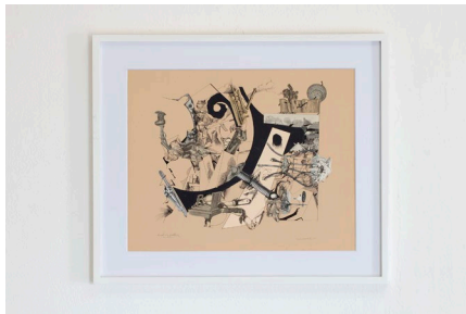
Susana Wald and Ludwig Zeller La otra cara de la medalla / The other face of the coin , 1980 de la serie Mirages drawing: 40 x 50 cm frame: 52 x 62 x 3 cm Collage and ink on paper