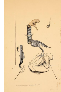
Susana Wald and Ludwig Zeller Preguntas y respuestas / Questions and answers , 1979 de la serie Mirages drawing: 40.7 x 25.7 cm frame: 55 x 40 x 3 cm Collage and ink on paper