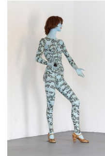
Ludwig Zeller & Patricia Pérez Untitled (1998) collage & object 180 x 90 x 70 cm Collage and ink on paper Collage and ink on paper