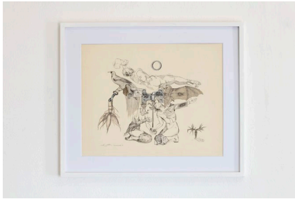
Susana Wald and Ludwig Zeller Ensayos de levitación / Levitation rehearsal , 1980 de la serie Mirages drawing: 40 x 50 cm frame: 52 x 62 x 3 cm Collage and ink on paper frame: 52 x 62 x 3 cm Collage and ink on paper