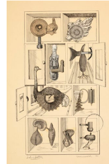
Susana Wald and Ludwig Zeller Botiquin transparente / Transparent medicine cabinet , 1979 de la serie Mirages drawing: 40.7 x 25.7 cm frame: 55 x 40 x 3 cm Collage and ink on paper