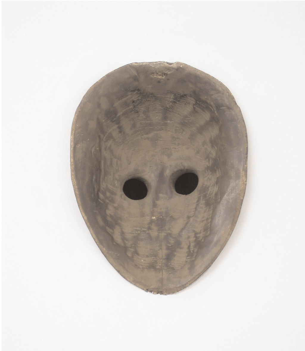
GALERIE KAMM Raphael Danke "and into the wall (Das Seufzen der Steine)", 2005, mask of the Gabun, 23,5 x 20 cm