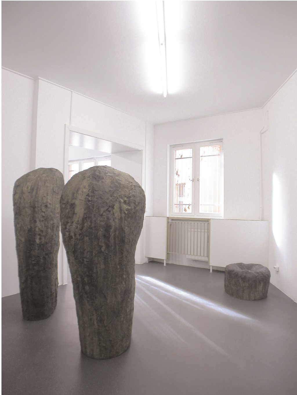
GALERIE KAMM Richard Hughes "Broken Circle", 2006, polystyrene, wire, jesmonite, stone powders, epoxy resin, leaves, laquer, acrylic paint, 170 x 80 x 80 cm, 165 x 60 x 75 cm and 80 x 80 x 50 cm