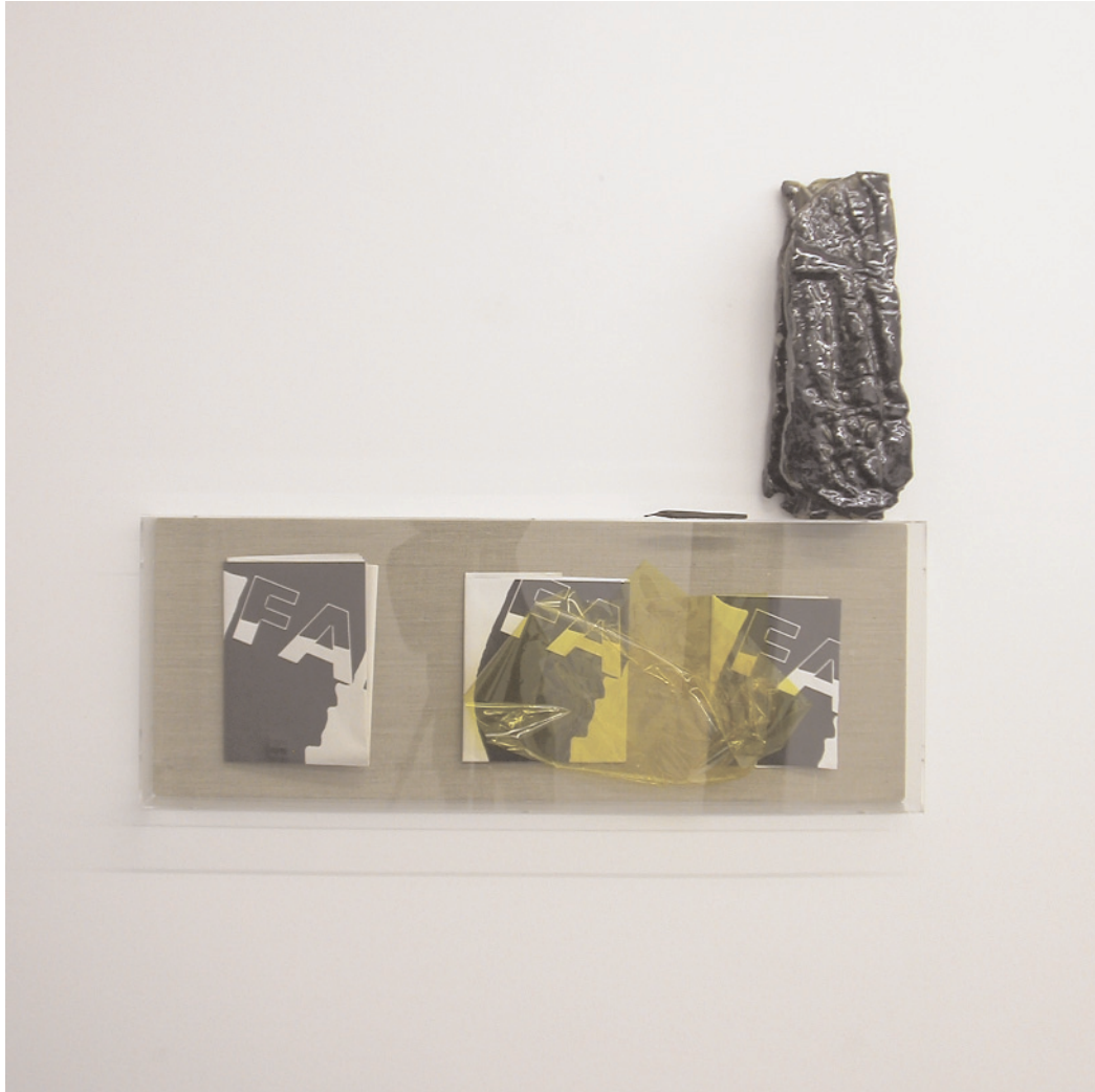
GALERIE KAMM Steven Claydon "The green-shirt movement for sozial credit", 2006, perspex, canvas, 3 folded prints, foil, ceramic vessel, 93 x 110,5 x 11cm