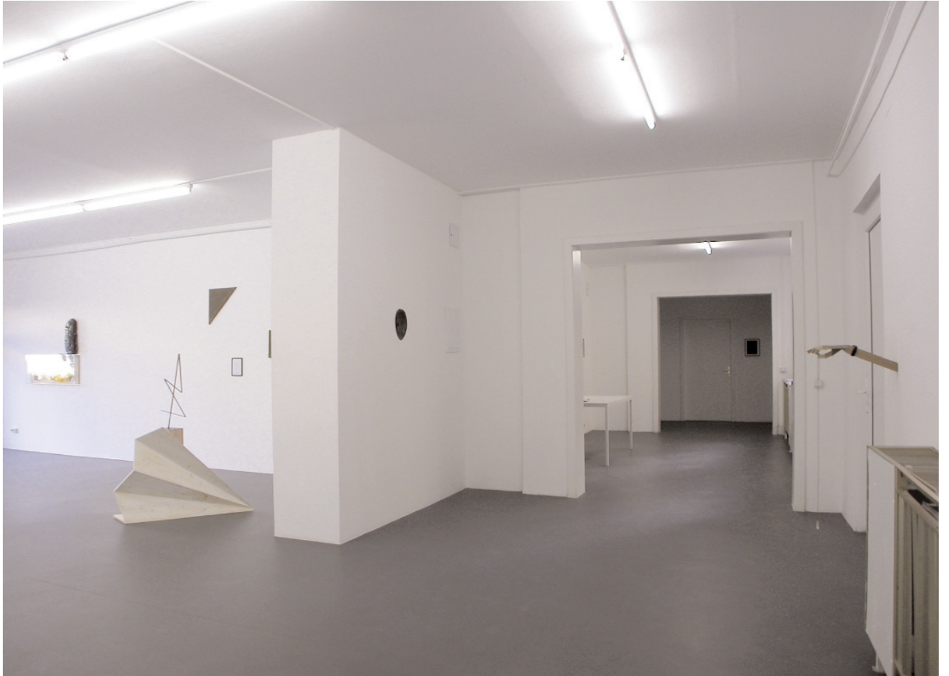
GALERIE KAMM "deep into that darkness peering", 2006, exhibition view, Galerie Kamm, Berlin