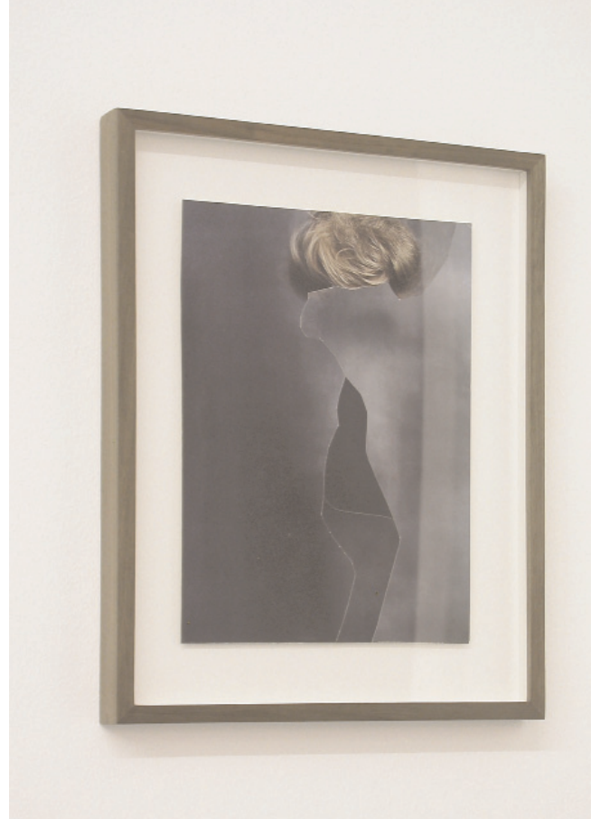
GALERIE KAMM Raphael Danke "Bra, Panties", 2005, collage, framed 38 x 28,4 cm and "Die Entfernung von Lindsay Eligson", 2006, collage, framed 31 x 25 cm