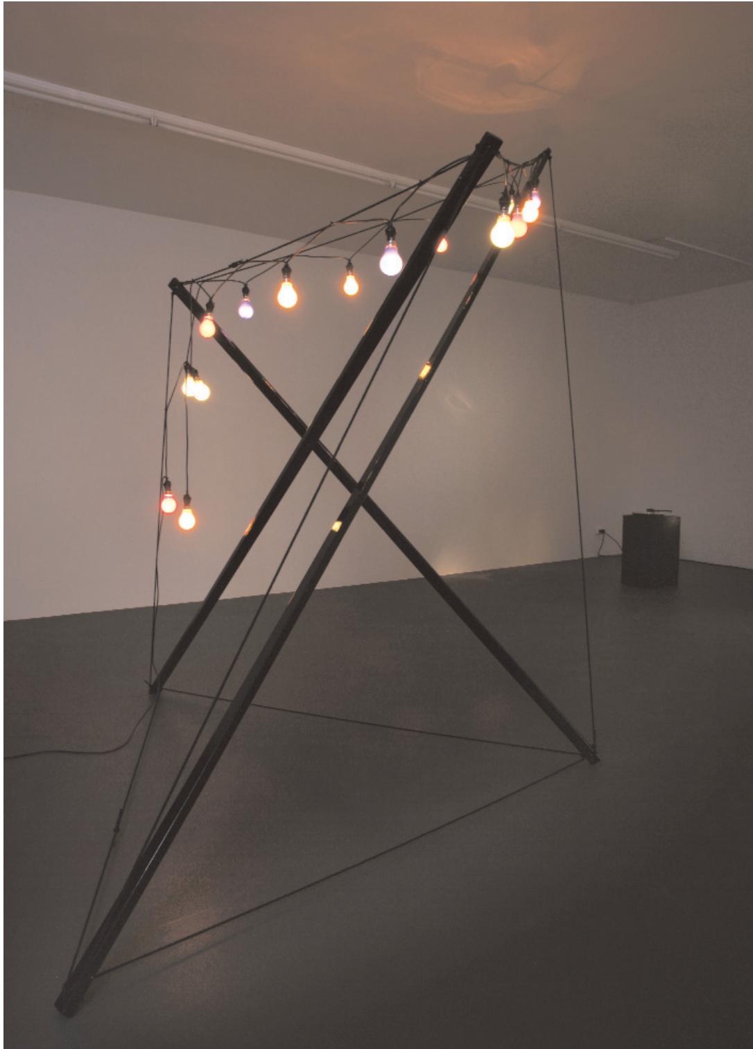
GALERIE KAMM Jacob Dahl Jürgensen "Antiprism Pavillion (Sketch for a Stage Set)", 2006, wood, synthetic resin, coloured light bulbs, cable, approx. 267 x 245 x 215 cm