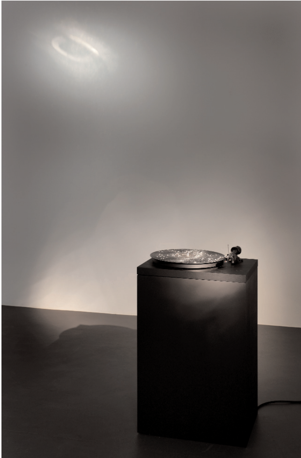
GALERIE KAMM Simon Dybbroe Møller "If the stars had a sound, it would sound like this", 2005, record, glass crystal, glitter, spot light, record player, pedestal, size variable