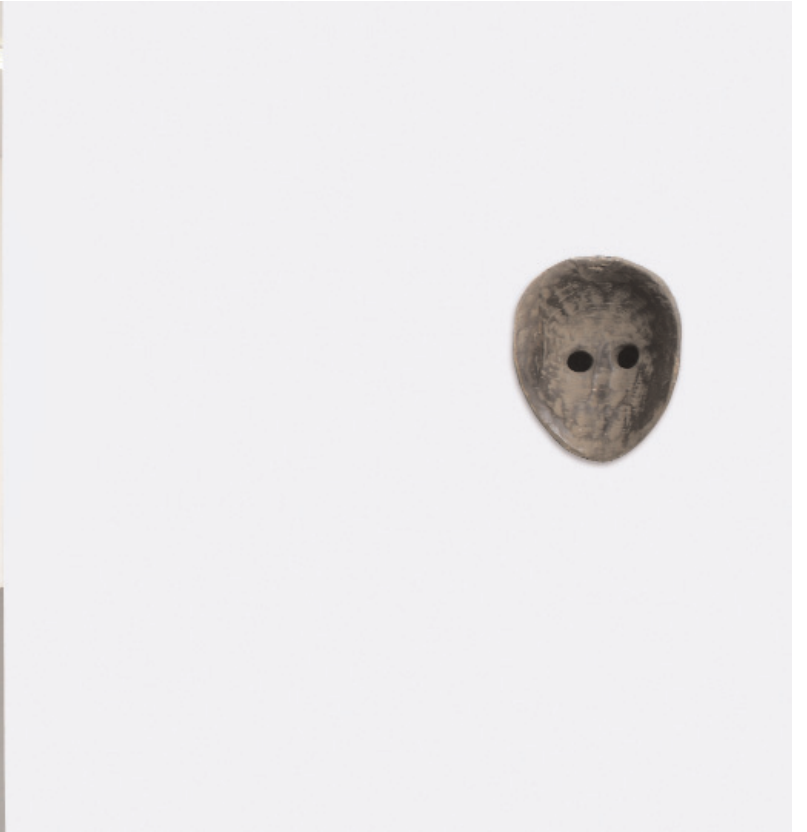
GALERIE KAMM "deep into that darkness peering", 2006, exhibition view with Matias Faldbakken "The Eyes They See", 2006 and Raphael Danke "and into the wall (Das Seufzen der Steine)", 2005