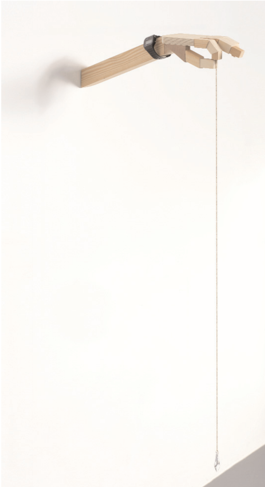
GALERIE KAMM Jacob Dahl Jürgensen "The Hand of Divination", 2005, wood, crystal glass pendulum, brass chain, Casio digital watch, 80 x 40 x 11 cm