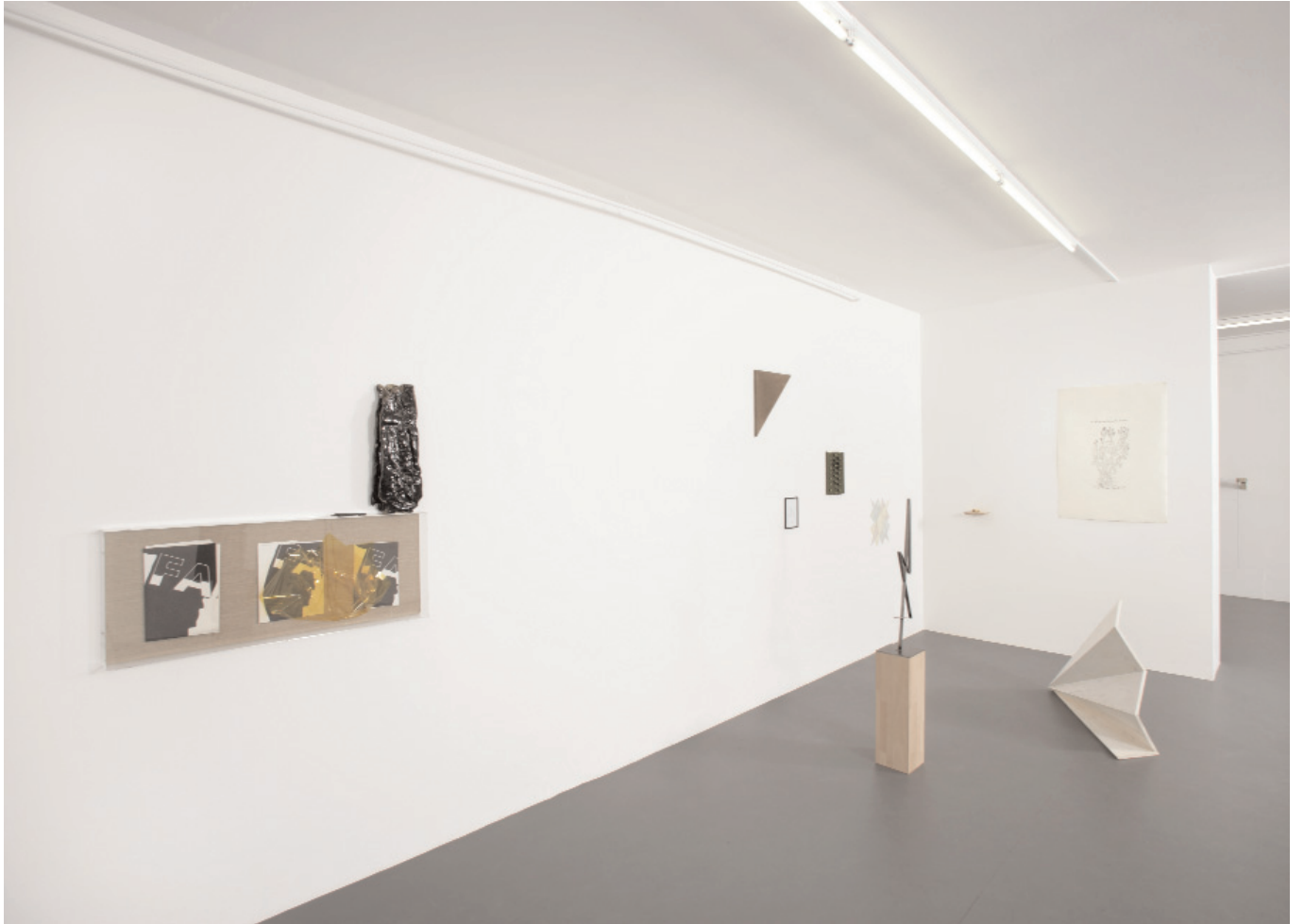
GALERIE KAMM "deep into that darkness peering", 2006, exhibition view, Galerie Kamm, Berlin