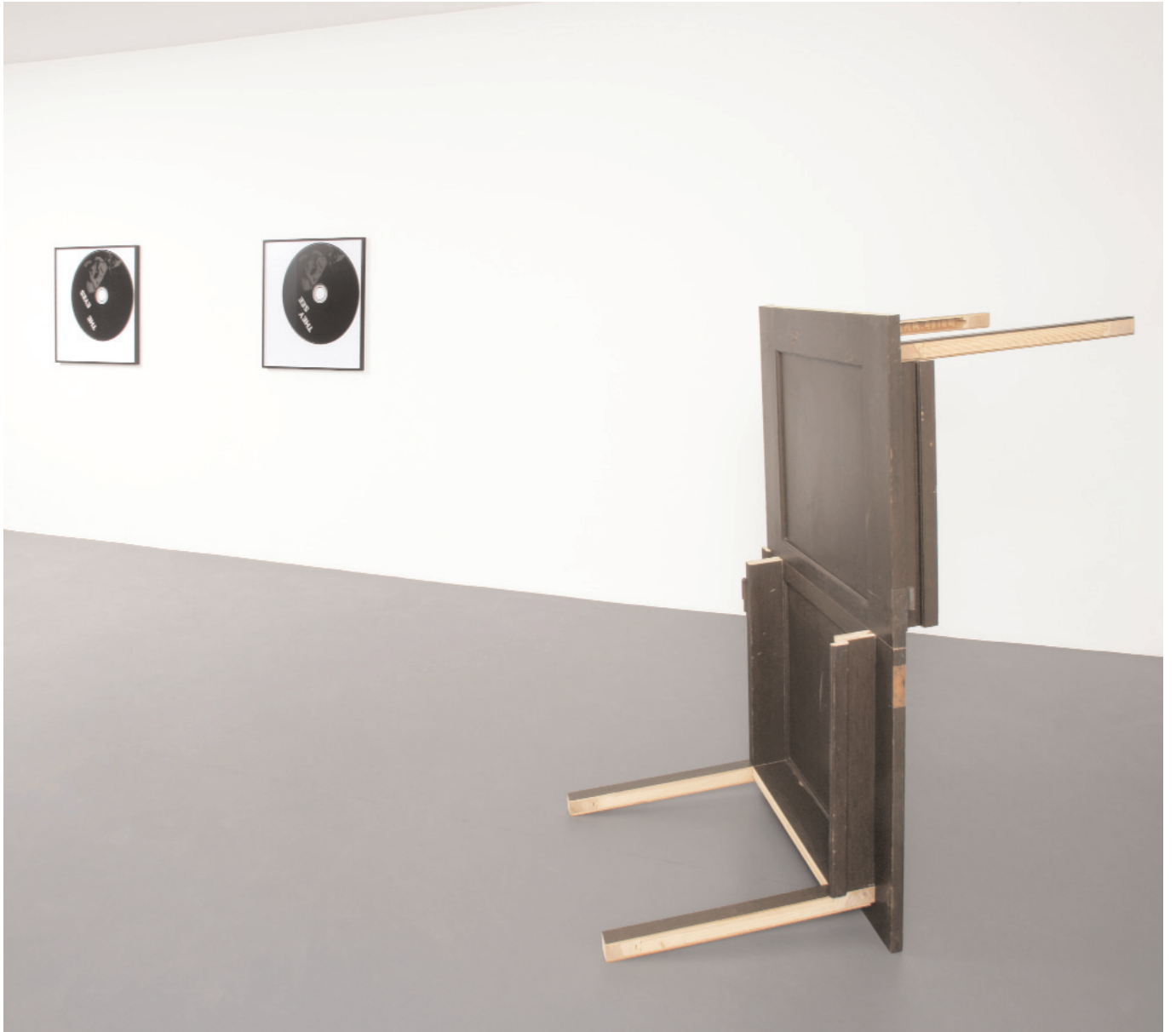
GALERIE KAMM "Deep into that darkness peering", 2006, exhibition view with Matias Faldbakken "The Eyes They See", 2006 and Raphael Danke "La Séance", 2006, door, wood, metal, varnish, 154 x 84 x 160 cm