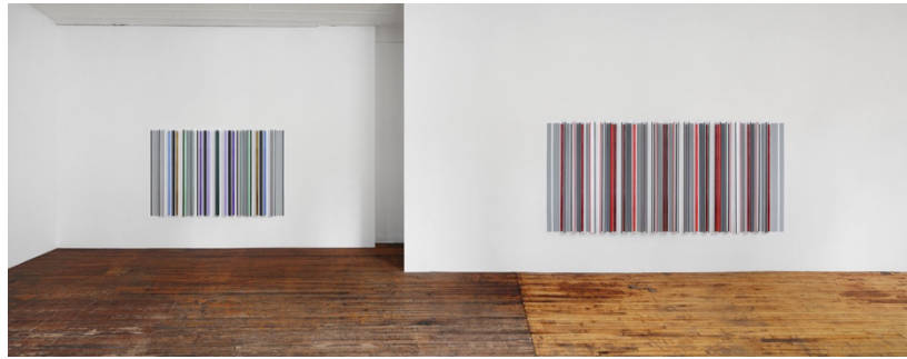
Installation view, Robert Irwin , April 4–August 31, 2024, 101 Spring Street, Judd Foundation, New York. Art © Robert Irwin / Artists Rights Society (ARS), New York.