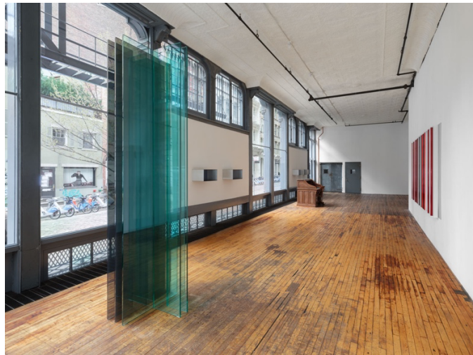
Installation view, Robert Irwin , April 4–August 31, 2024, 101 Spring Street, Judd Foundation, New York. Art © Robert Irwin / Artists Rights Society (ARS), New York.