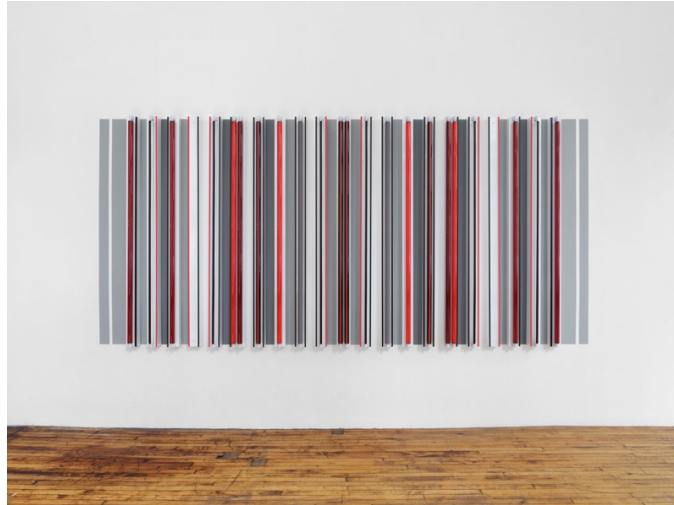
Robert Irwin, AS GOOD AS IT GETS , 2023, Shadow + Reflection + Color, 72 × 174 3/4 × 48 1/4 inches (182.9 cm × 443.9 cm × 10.8 cm), Robert Irwin , April 4–August 31, 2024, 101 Spring Street, Judd Foundation, New York. Art © Robert Irwin / Artists Rights Society (ARS), New York.