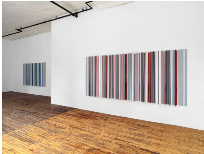
Installation view, Robert Irwin , April 4–August 31, 2024, 101 Spring Street, Judd Foundation, New York. Art © Robert Irwin / Artists Rights Society (ARS), New York.