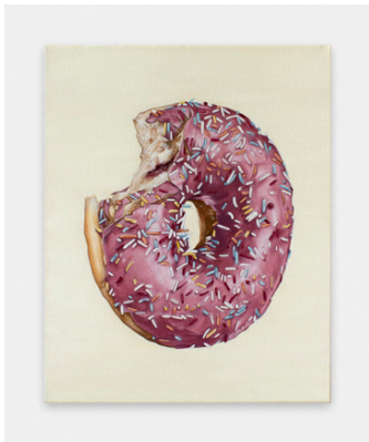
Bex Massey European Bank 568 2024 Oil on canvas 50 x 40 cm