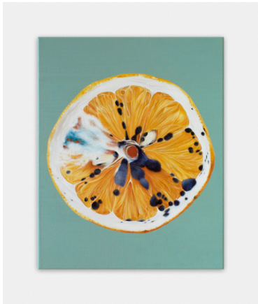
Bex Massey Pride Angel 13 2024 Oil on canvas 50 x 40 cm