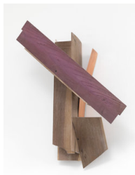
MALEPARTUS 2011, acrylic / cherry wood, nutwood, copper, plaster, 66 x 59 x 32 cm