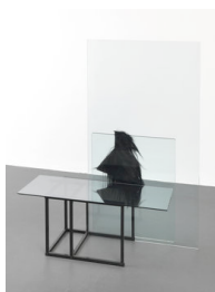
VITRINE #6 / DOPPLER

2011, bw digital print, 55.5 x 72 cm, framed 56.5 x 73 cm 1/3 + 1AP