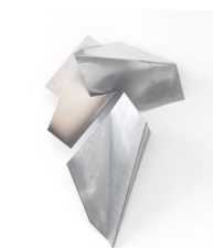
TATOOINE 2011, metal, 72 x 50 x 20 cm