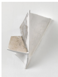
FALUN 2011, plaster, 33 x 32 x 27 cm