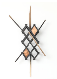
INTERNALLY FLAMELESS 2011, acrylic, wood, copper, 138 x 67 x 18 cm