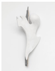
WAS MAN SICH KLAR UND DEUTLICH 2011, plaster, wood, 73 x 30 x 16 cm