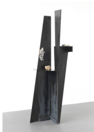
VITRINE #7 / BROCKEN UND LOSER

2011, hammer effect enamel / wood, stone, spy-mirror, paper, 216 x 54 x 51 cm