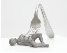
Urs Fischer Fork Guy , 2024 Stainless steel 24.6 x 38 x 25 cm 9 3/4 x 15 x 9 7/8 in