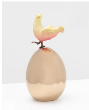
Urs Fischer Aviary Queens , 2024 Cast bronze, oil primer, oil paint 29.5 x 13 x 13 cm 11 5/8 x 5 1/8 x 5 1/8 in