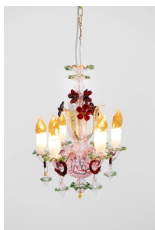
Urs Fischer Question of the Day , 2024 Hand-blown glass, LED lights, brass chain, enamel paint 23.1 x 16 x 16 cm 9 1/8 x 6 1/4 x 6 1/4 in Courtesy of The Artist and The Modern Institute/Toby Webster Ltd, Glasgow. Photo: Patrick Jameson.