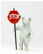
Urs Fischer Polar Bear , 2024 Cast bronze, enamel paint 30.2 x 19.9 x 8.7 cm 11 7/8 x 7 7/8 x 3 3/8 in