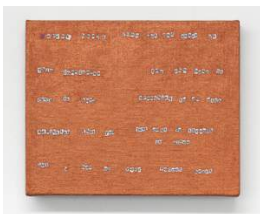
Ann Zhao Untitled, 2023 Oil and collage on canvas 9 7 / 8 x 15 in