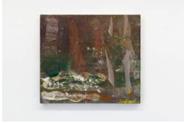
Ull Hohn Untitled, 1987 Oil on canvas 16 x 18 in