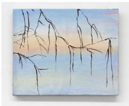
Ann Zhao The wild geese fly across the long sky above / Their image is reflected upon the chilly water below / The geese do not mean to cast their image on the water / Nor does the water mean to hold the image of the geese, 2023 Oil on canvas 9 x 11 in