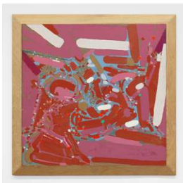
Molly Rose Lieberman Flicker Baby, 2024 Flashe and oil on masonite in artist's frame 30 x 30 in