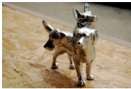
KARL LARSSON CARNIVORE 2013, aluminium, 22 x 13.5 x 19 cm 1/3 + 1AP