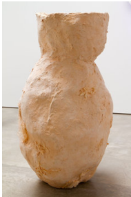
MICHELE DI MENNA VESSEL (APRICOT) 2013, papier-mâché, chicken wire, 91 x 56 x 44 cm