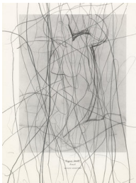
KATE DAVIS DISGRACE, III 2009, pencil / found image, 30 x 21 cm, framed 38.5 x 29 cm

DISGRACE, II 2009, pencil / found image, video 9:36 min, loop, colour, sound (edition of 4), size variable