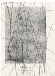
KATE DAVIS DISGRACE, IV 2009, pencil / found image, 30 x 21 cm, framed 38.5 x 29 cm

DISGRACE, III 2009, pencil / found image, video 9:36 min, loop, colour, sound (edition of 4), size variable