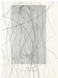
KATE DAVIS DISGRACE, II 2009, pencil / found image, 30 x 21 cm, framed 38.5 x 29 cm

DISGRACE, I 2009, pencil / found image, video 9:36 min, loop, colour, sound (edition of 4), size variable