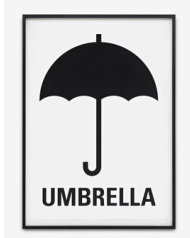
KARL LARSSON UMBRELLA POSTER (SHOW THE PROBLEM, NOT THE SOLUTION) 2012, 6 silkscreen prints, framed, edition 1/6 - 6/6, each 108,5 x 77 x 3 cm