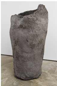
MICHELE DI MENNA VESSEL (ROCK) 2013, papier-mâché, metal mesh, chicken wire, 79 x 44 x 43 cm