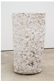
MICHELE DI MENNA VESSEL (HELLO KITTY) 2013, papier-mâché, chicken wire, 74 x 41 x 39 cm