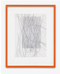
KATE DAVIS DISGRACE, I 2009, pencil / found image, 30 x 21 cm, framed 38.5 x 29 cm

DISGRACE, I 2009, pencil / found image, video 9:36 min, loop, colour, sound (edition of 4), size variable