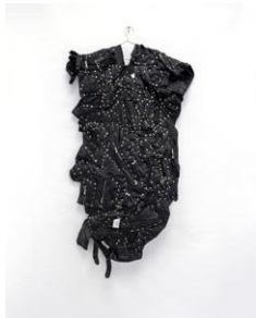
Tenant of Culture Faux Biker, 2022 recycled pleather biker jackets, rivets 165 x 85 x 26 cm