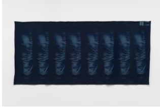
Tenant of Culture Ferrero, 2024 laser technology on demin 140 x 295.5 cm

GALERIE FONSWELTERS Bloemstraat 140 1016 LJ Amsterdam