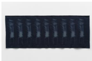
Tenant of Culture Jane, 2024 laser technology on denim 140 x 355 cm