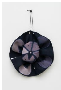
Tenant of Culture Untitled, 2024 cotton, fusing, thread, used hats, eyelet, elastic, toggle 60 x 52 x 18 Ø 40 cm