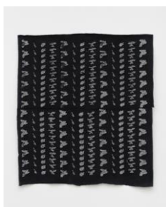
Tenant of Culture Untitled, 2024 laser technology on denim 170 x 153 cm

Courtesy the artist and Galerie Fons Welters, Amsterdam, photo Gunnar Meier