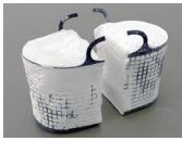
Etti Abergel Cut basket , 2019 Ready made, plaster bandege, wires polystyrene 38 x 29 x 57 cm