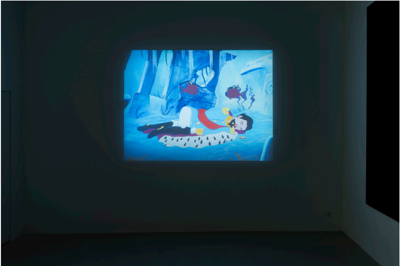
Ludwig 2024 Digital video, sound 8 min (loop) Installation view