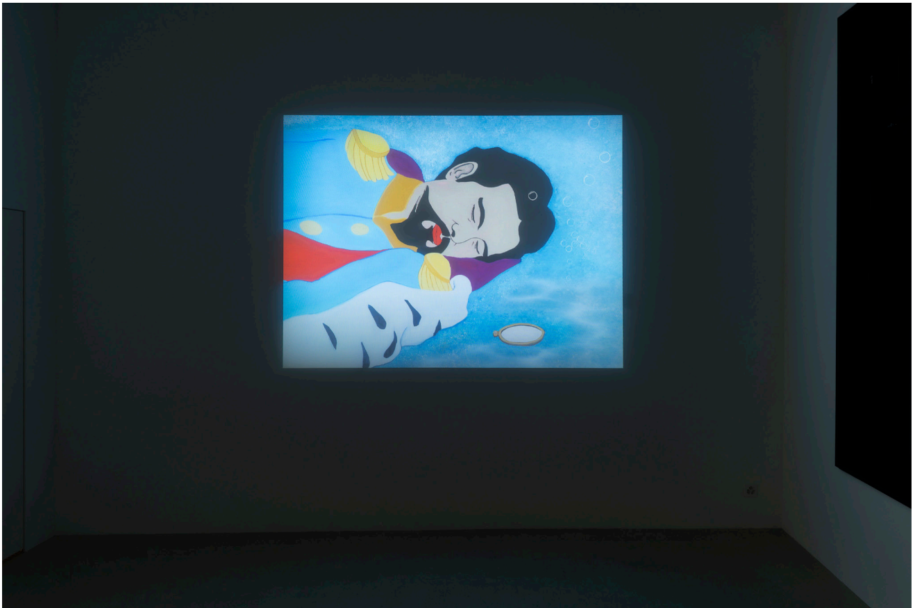
Ludwig 2024 Digital video, sound 8 min (loop) Installation view