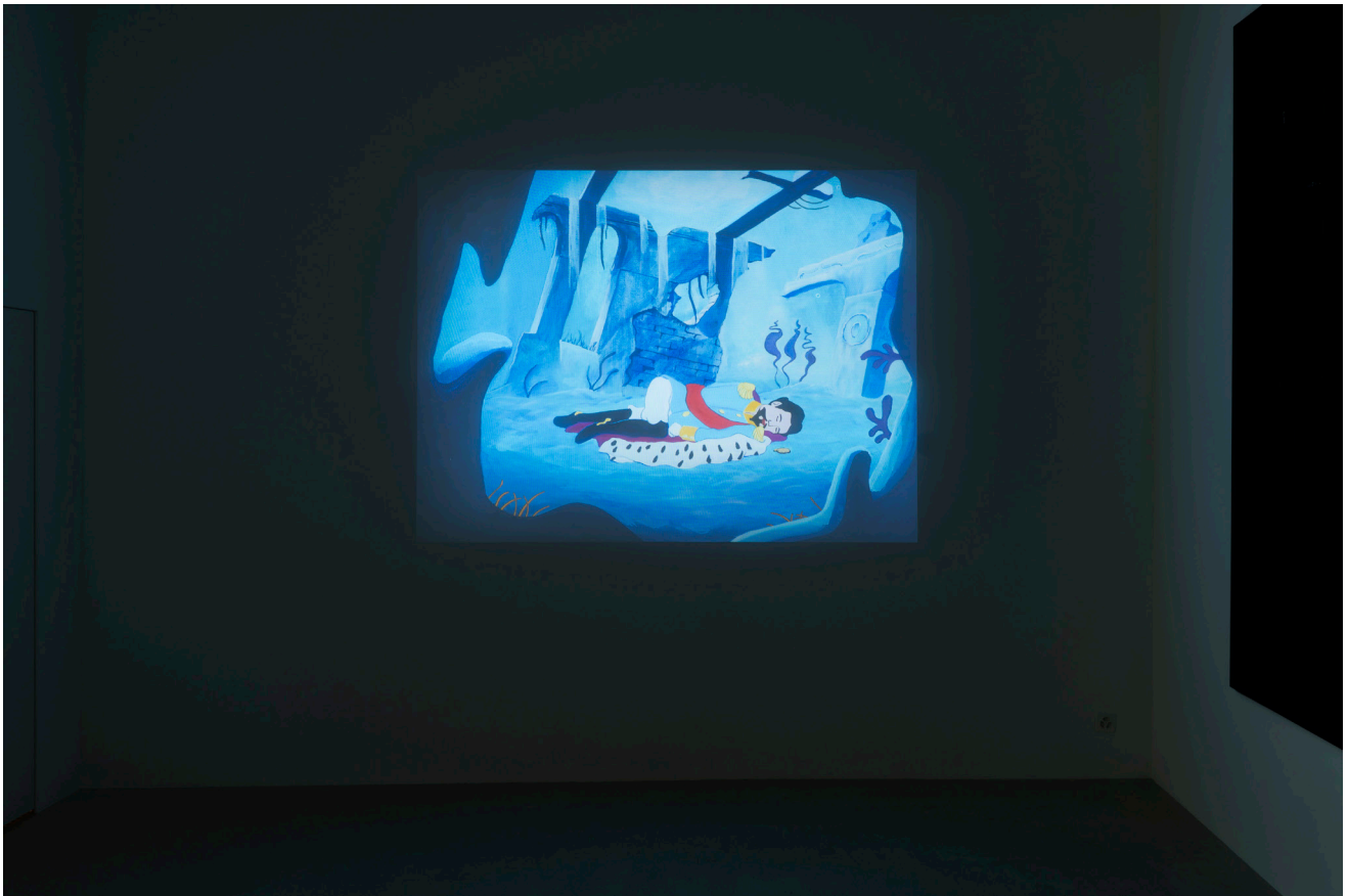
Ludwig 2024 Digital video, sound 8 min (loop) Installation view